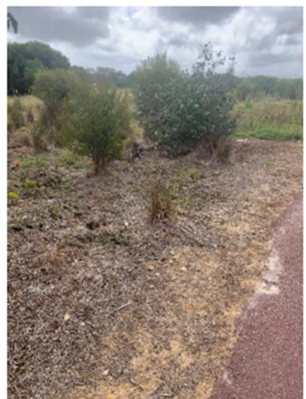
Figure 6 Photographs of vegetation in Area 5