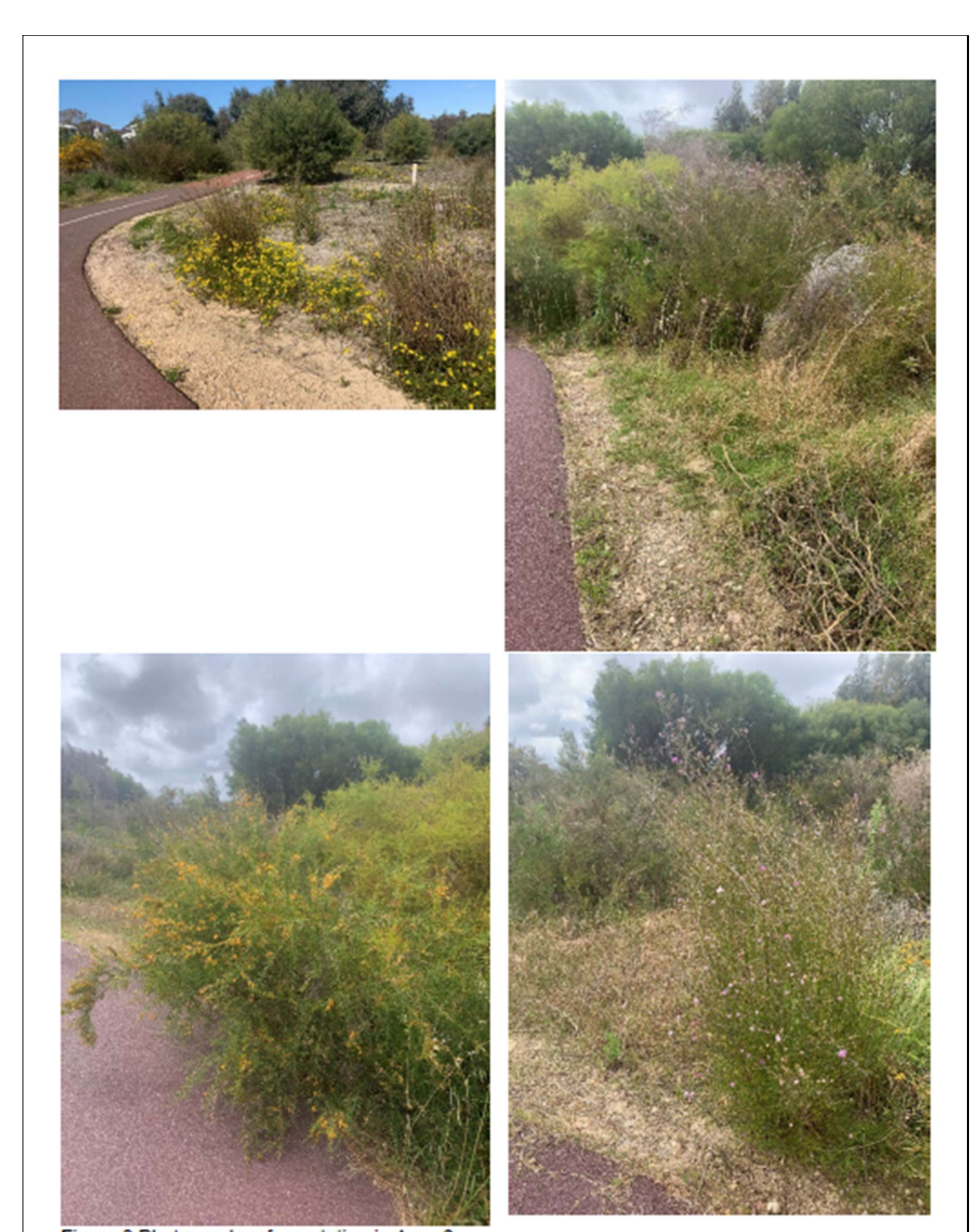
Figure 8 Photographs of vegetation in Area 6