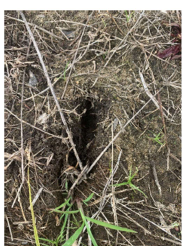
Figure 7 Photographs of Quenda diggings in Area 5