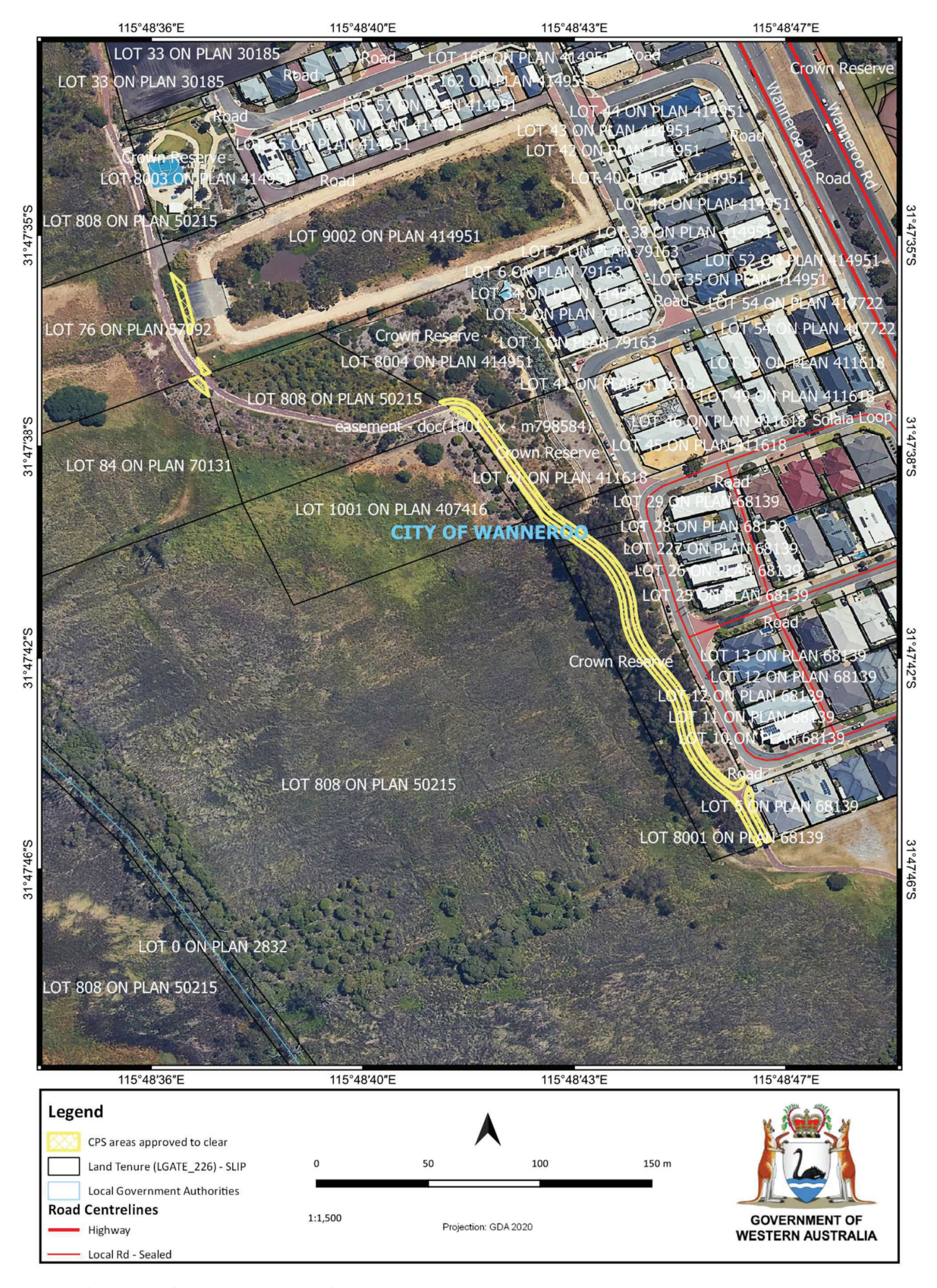
Figure 2: Map of the boundary of the area within which clearing may occur