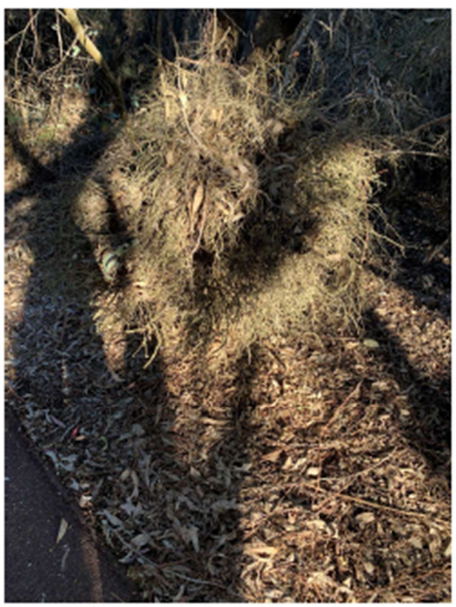
Figure 2. Photograph of vegetation in Area 1