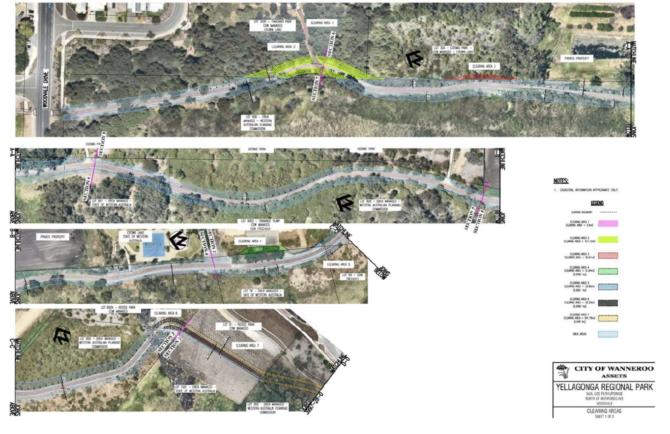
Figure 10 Proposed clearing areas for upgrades to drainage along the path. The applicant indicated the blue hatched areas will be cleared under an exemption pursuant to Schedule 6(3) of the EP Act. The decision to utilise an exemption is the responsibility of the individual or entity intending to clear native vegetation.