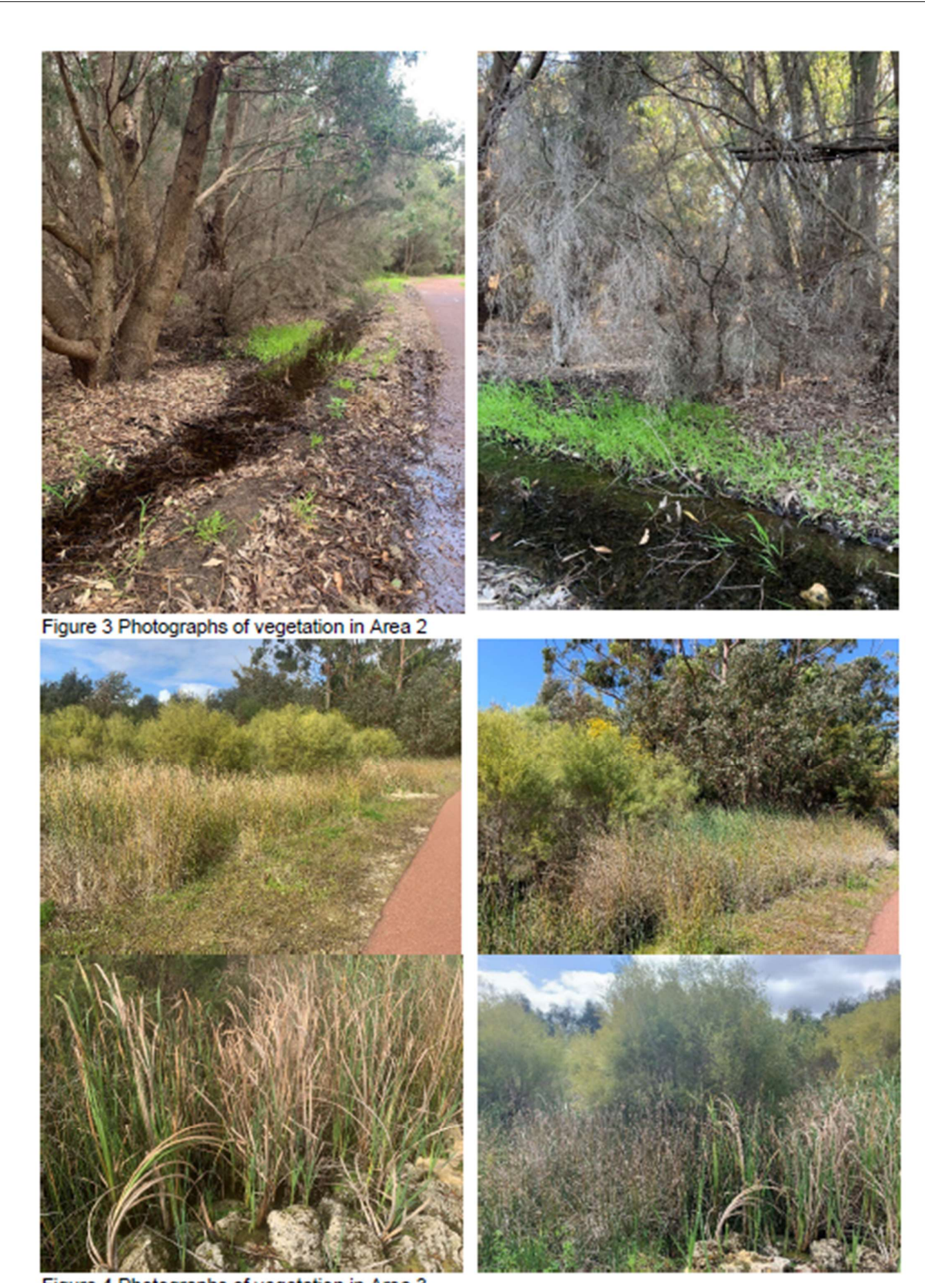
Figure 4 Photographs of vegetation in Area 3