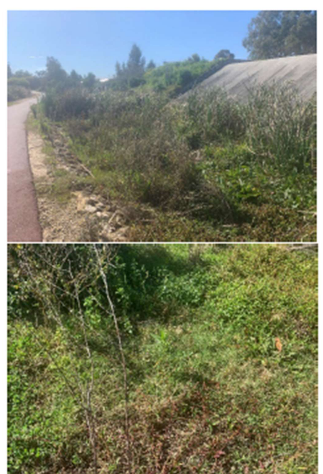
Figure 5 Photographs of vegetation in Area 4