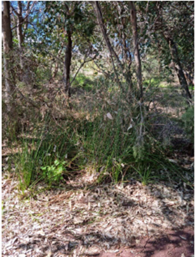
Figure 9 Photographs of vegetation in Area 7