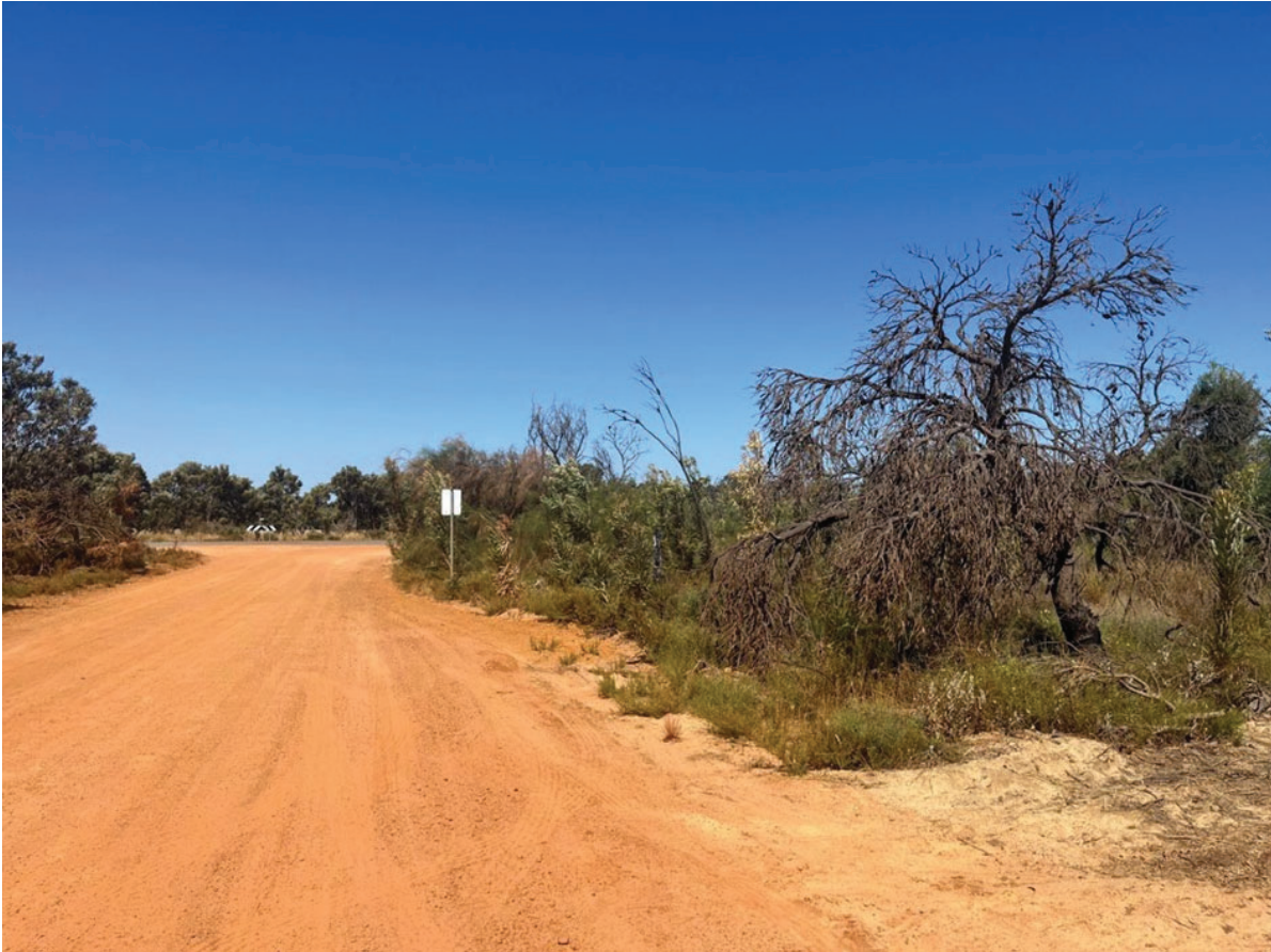
Photo A1 Hunter Road - Facing East toward Brand Highway