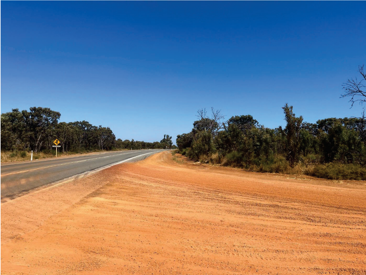
Photo A7 Brand Highway - North Lane Facing South