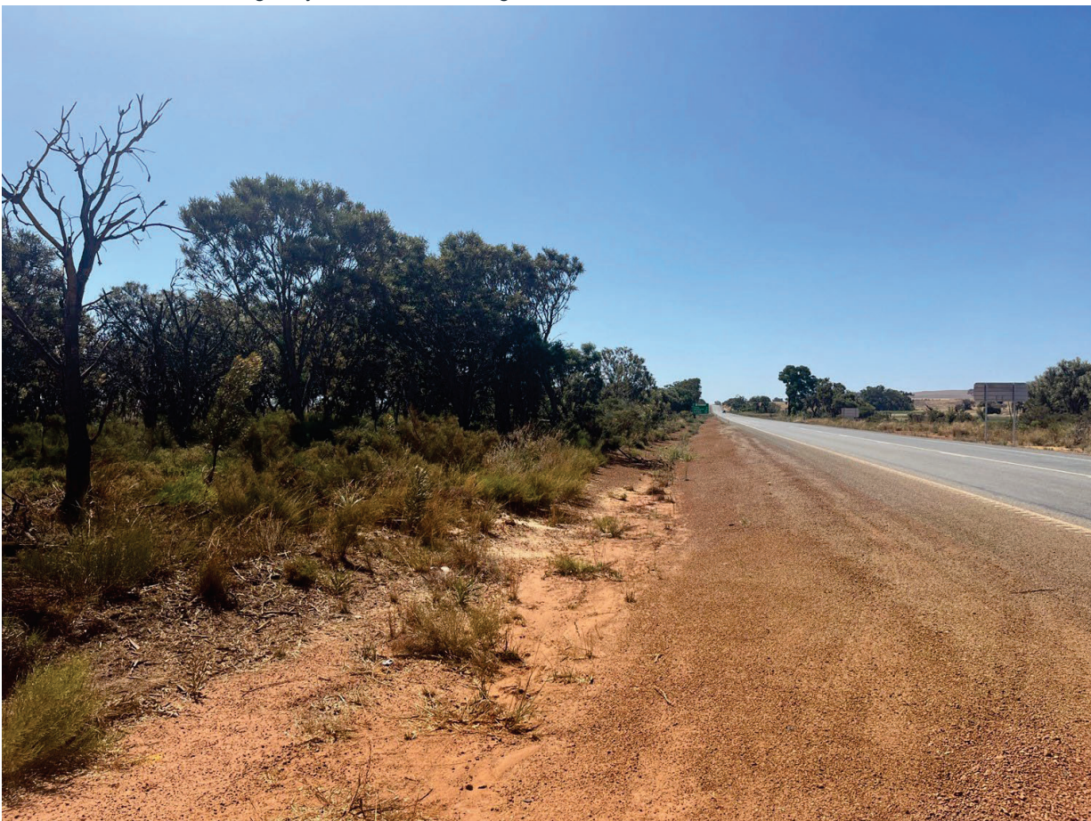
Photo A8 Brand Highway - North Lane Facing North