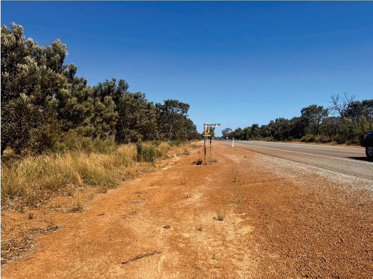
Photo A5 Brand Highway - South Lane Facing South