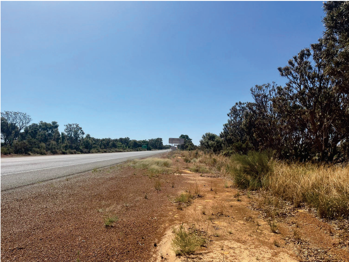
Photo A6 Brand Highway - South Lane Facing North