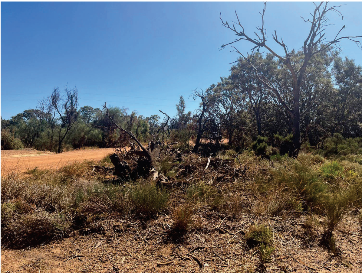
Photo A4 Hunter Road - Facing West off Brand Highway - East Lane Hunter Road