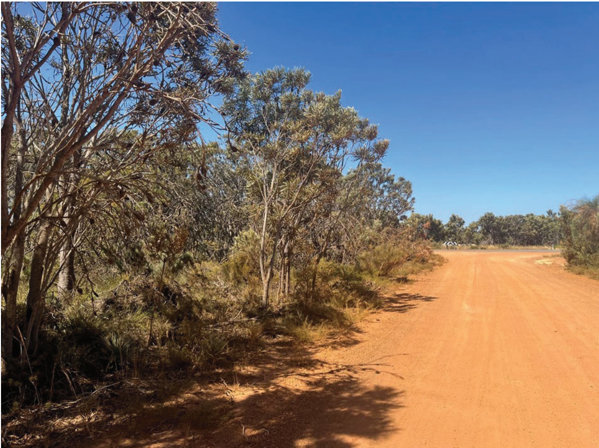
Photo A2 Hunter Road - Facing East toward Brand Highway - East Lane