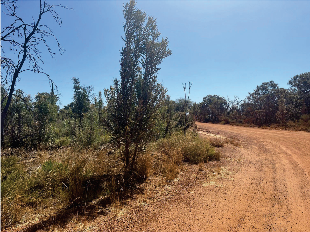
Photo A3 Hunter Road - Facing West off Brand Highway - West Lane Hunter Road