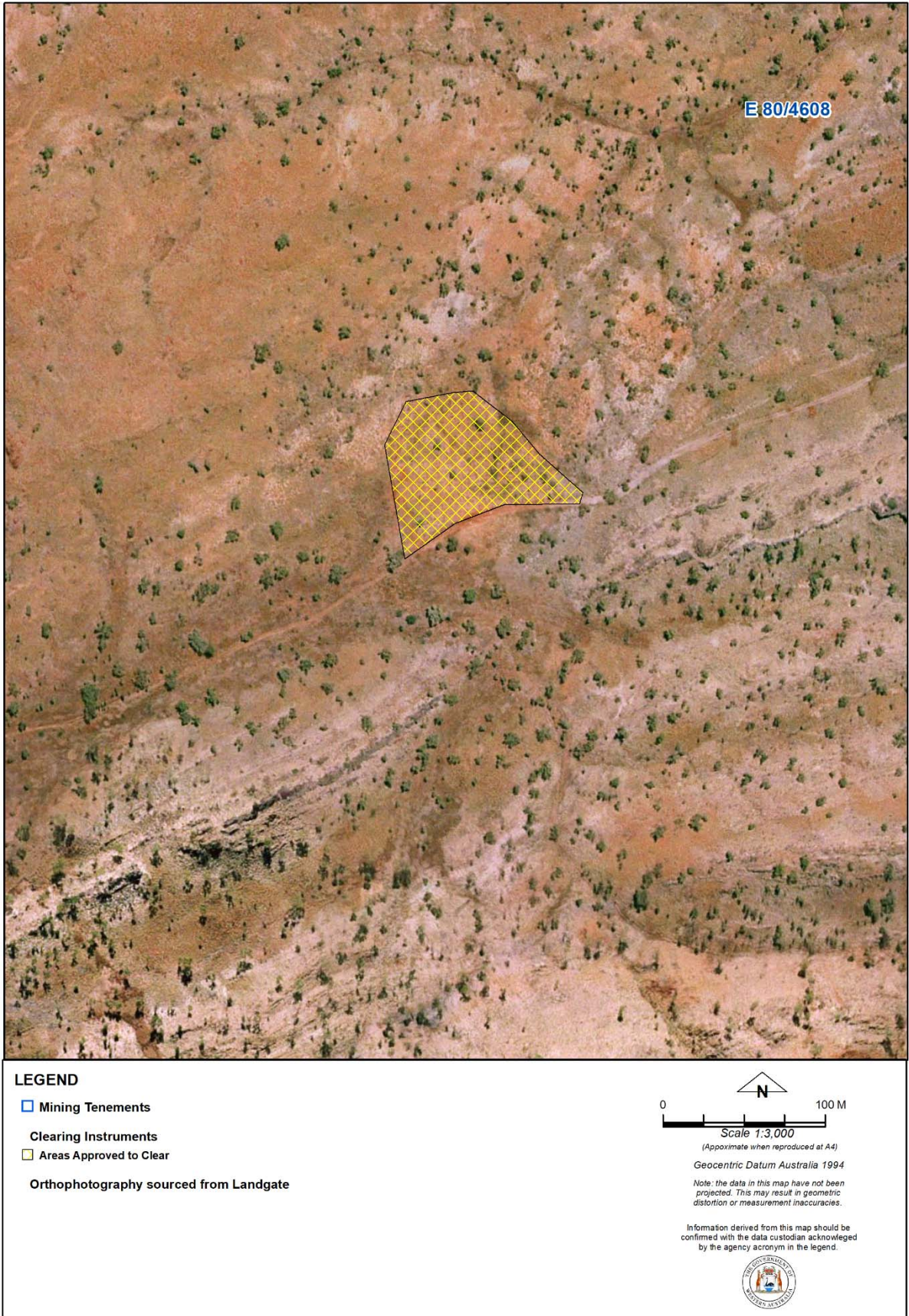
Figure 3: Map of the boundary of the area within which clearing may occur