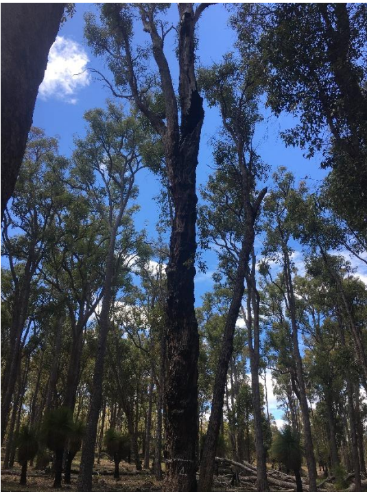
Fig 6: Tree number 4 (senescent jarrah)