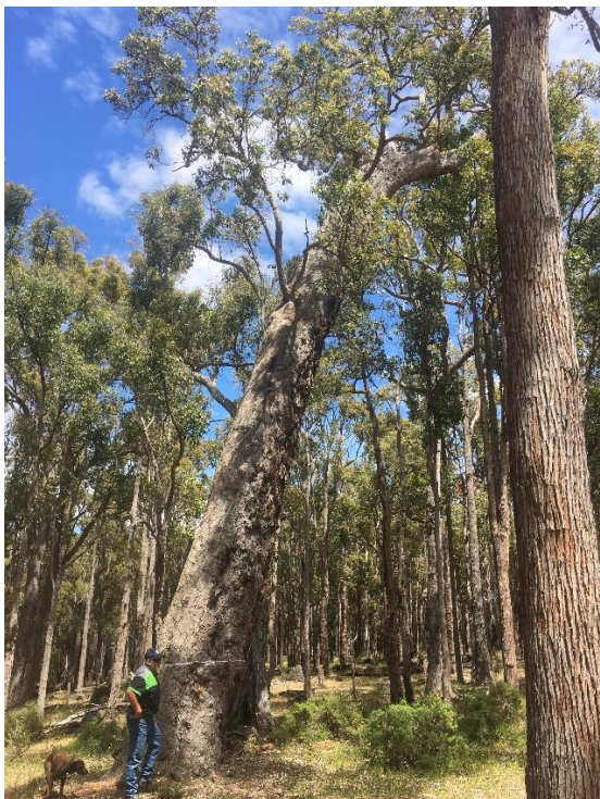
Fig 3: Tree number 2 (over-mature marri) hollow