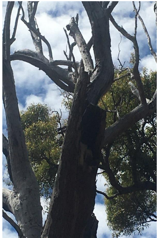
Fig 2: Tree number 1 showing close-up of hollow