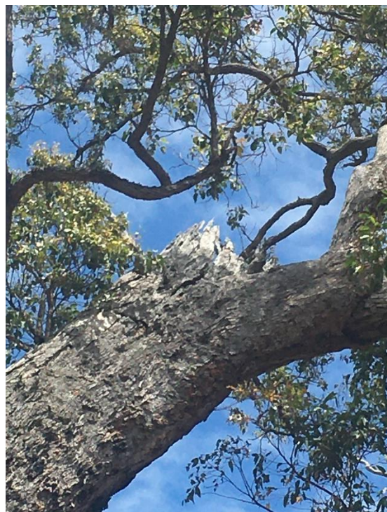
Fig 4: Tree number 2 showing close-up of hollow