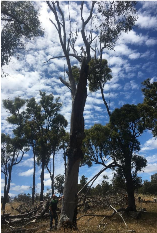
Fig 1: Tree number 1 (dead jarrah)