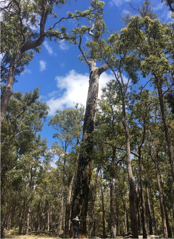
Fig 5: Tree number 3 (dead marri). Hollows at top branches.