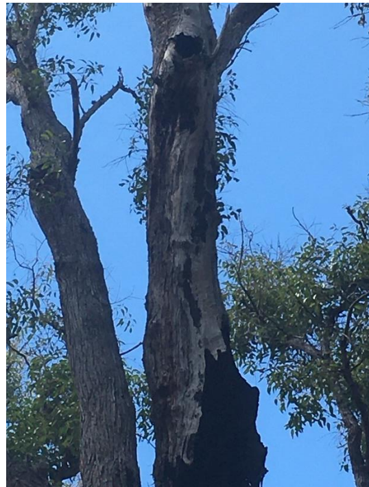
Fig 7: Tree number 4 showing close-up of hollows