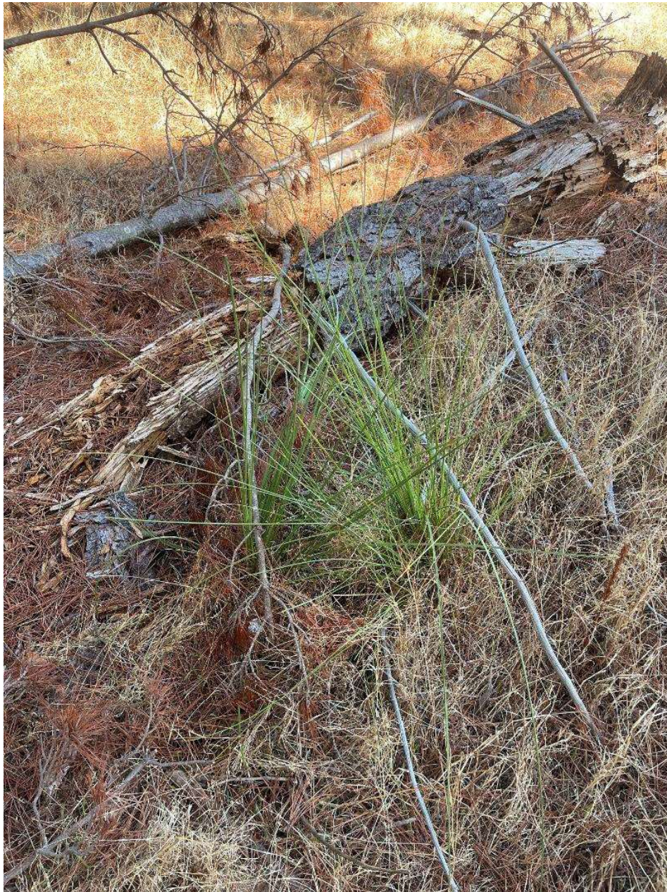
Example photograph – Xanthorrhoea sp.