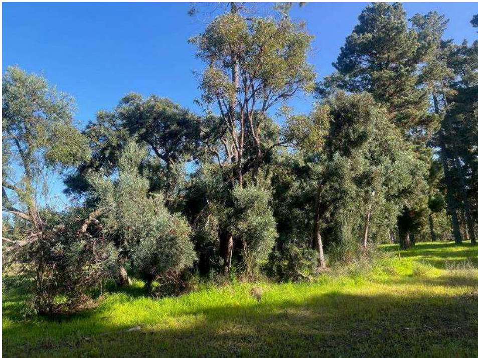
Example photogra – Nuytsia floribunda .