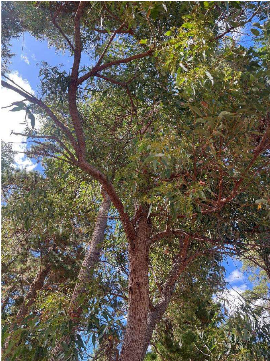
Example photograph – Eucalyptus marginata .