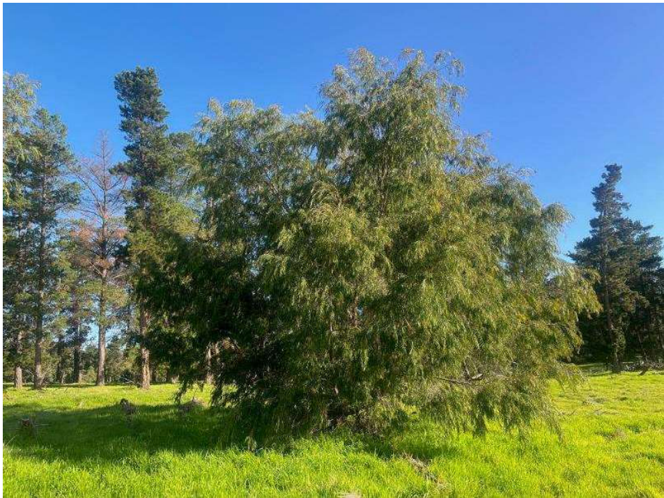
Example photograph – Agonis flexuosa .