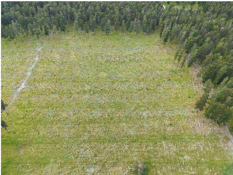
Site photograph 4 (elevated)(approx. location 383615E, 6338884N GDA2020 MGA z50 looking east).