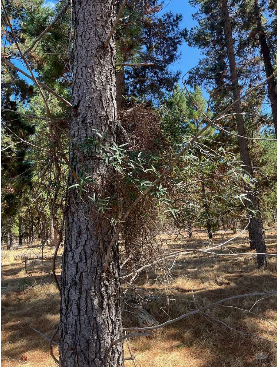
Example photograph – Hardenbergia comptoniana .