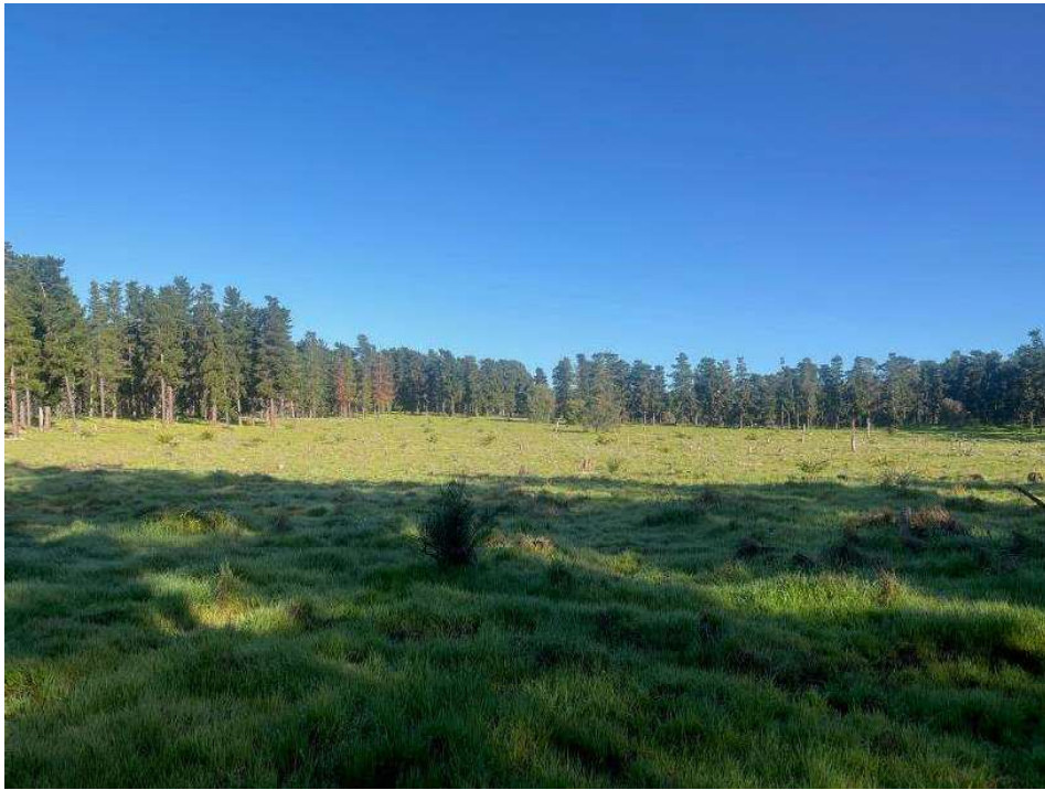
Site photograph 1. (approx. location 383699E, 6339061N GDA2020 MGA z50, looking southeast).