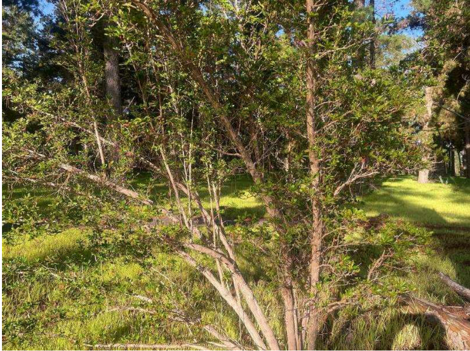
Example photograph – Hibbertia cuneiformis .