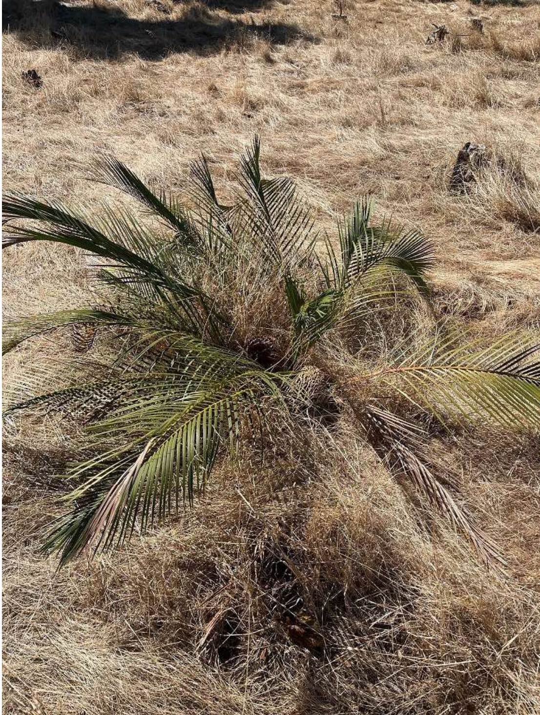
Example photograph – Macrozamia riedlei .