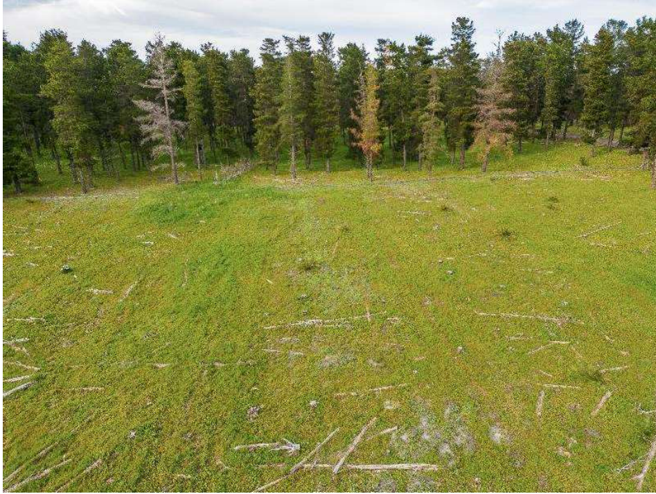
Site photograph 3 (elevated)(approx. location 383464E, 6338913N GDA2020 MGA z50 looking north).