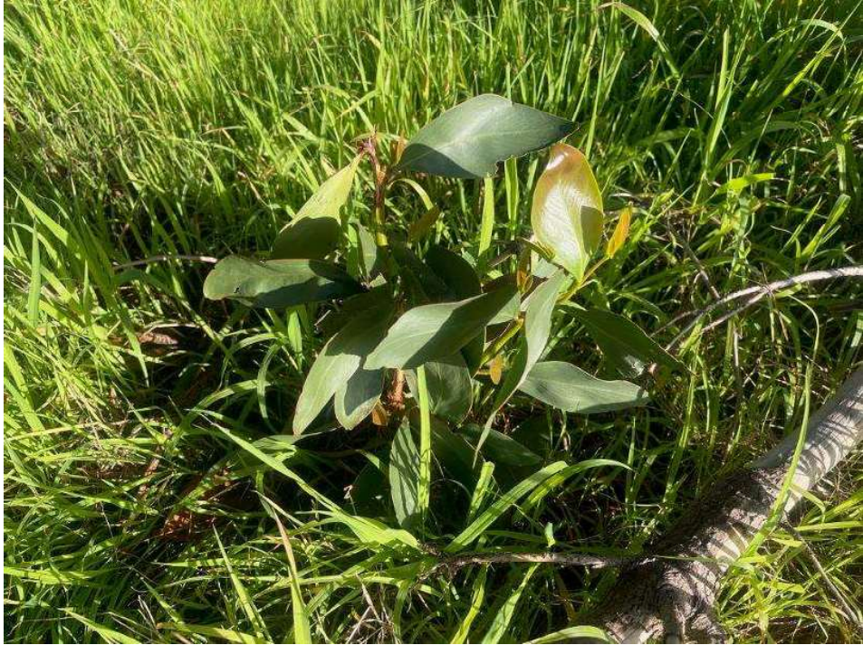
Example photograph – Acacia saligna .