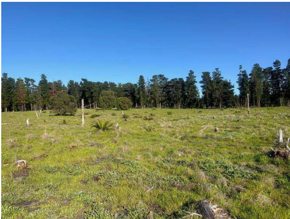
Site photograph 2. (approx. location 383427E, 6338890N GDA2020 MGA z50 looking southeast).