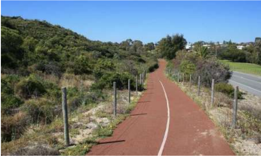
Plate 11: Coastal Share path at Ch 2700 – 4275: Whitfords Avenue / Northshore Drive to Tom Simpson park (FPR2301) – currently 3m wide asphalt path.