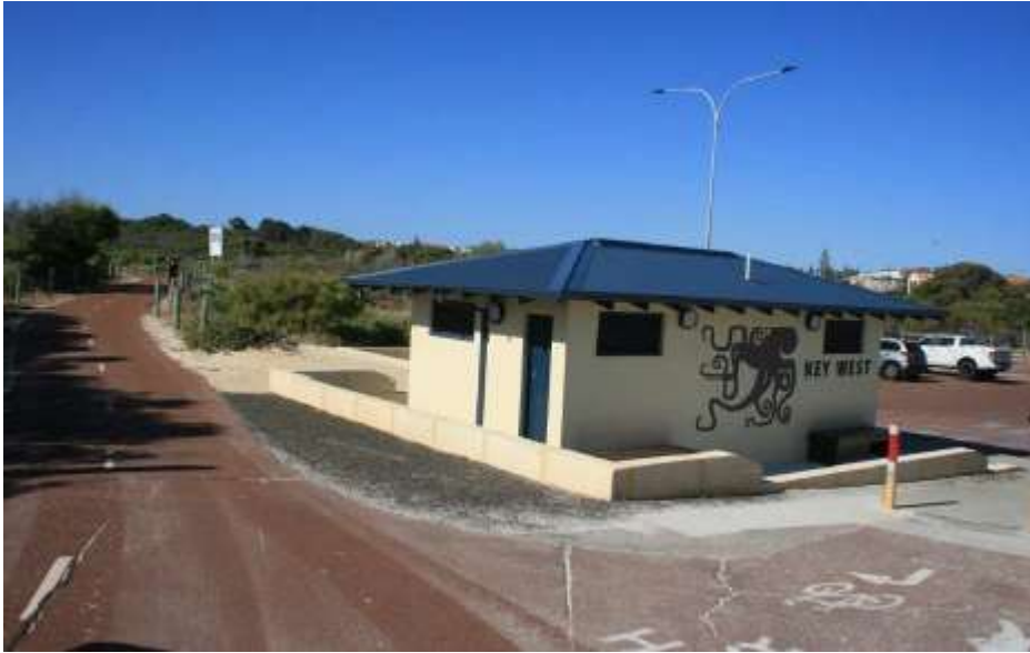
Plate 15: Coastal Share path at Ch 5590 – 6570: Westview carpark to Swanson Way path (FPR2297) – currently 3m wide asphalt path of poor condition.