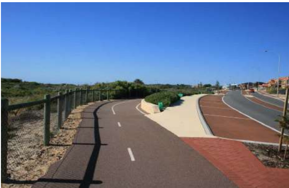
Plate 14: Coastal Share path at Ch 4275 – 5590: Tom Simpson park to Westview carpark – currently 3m wide asphalt path of good condition.