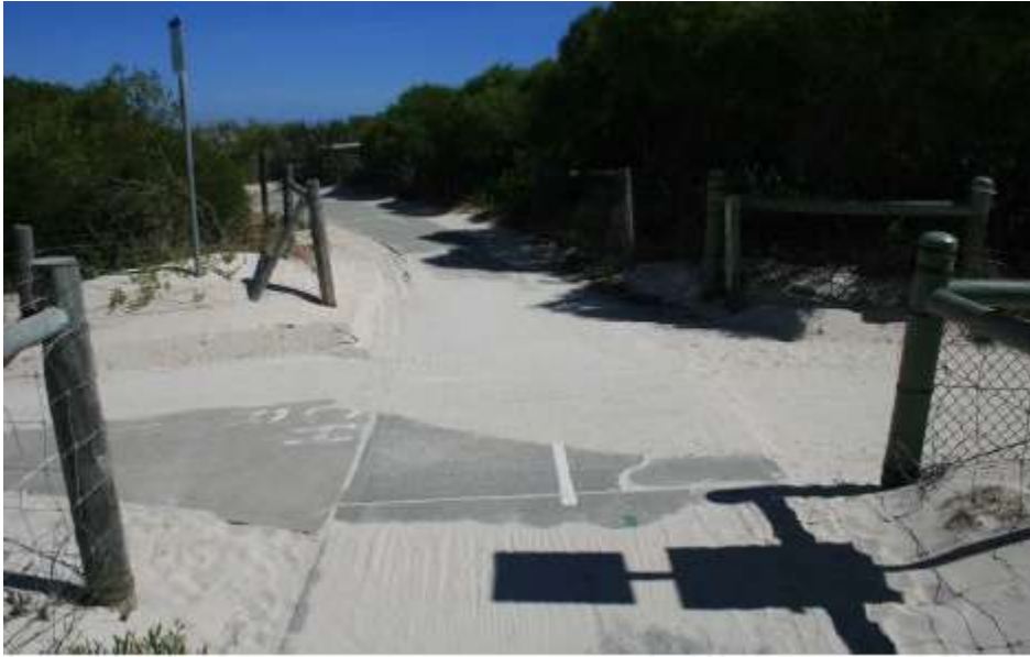
Plate 3: Coastal Share path at Ch 700 – 1385: Whitfords Nodes carpark to Hillarys animal beach carpark (FPR2299) – currently 2m wide concrete path in poor condition.