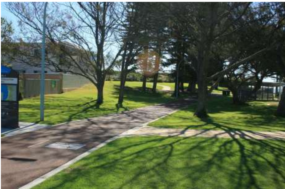
Plate 12: Coastal Share path at Ch 4275 – 5590: Tom Simpson park to Westview carpark – currently 3m wide asphalt path of good condition.