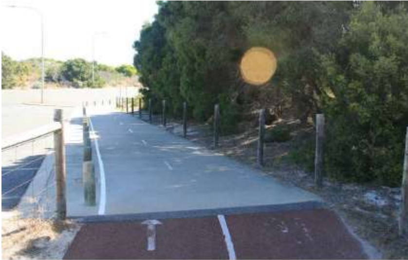
Plate 9: Coastal Share path at Ch 2700 – 4275: Whitfords Avenue / Northshore Drive to Tom Simpson park (FPR2301) – currently 3m wide concrete path.