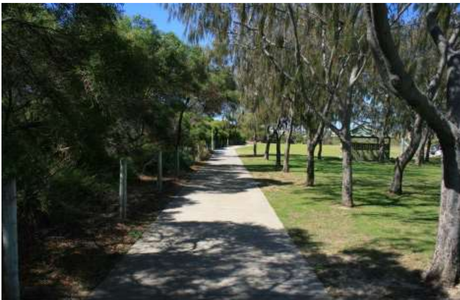
Plate 4: Coastal Share path at Ch 1800 – 2700: Hillarys animal beach carpark to Whitfords Avenue / Northshore Drive (FPR2300)– currently 2.5m wide concrete path.