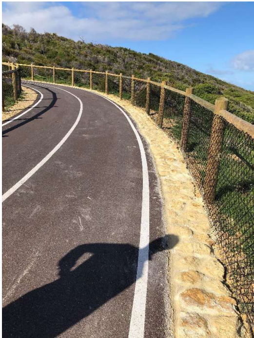
Plate 1: Stone Pitching Drainage