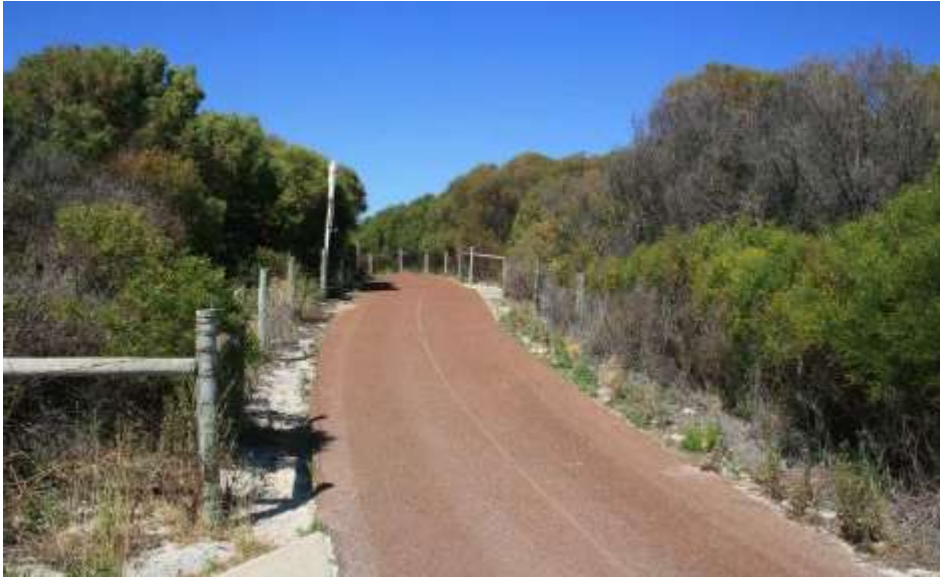
Plate 7: Coastal Share path at Ch 2700 – 4275: Whitfords Avenue / Northshore Drive to Tom Simpson park (FPR2301) – currently 3m wide asphalt path.