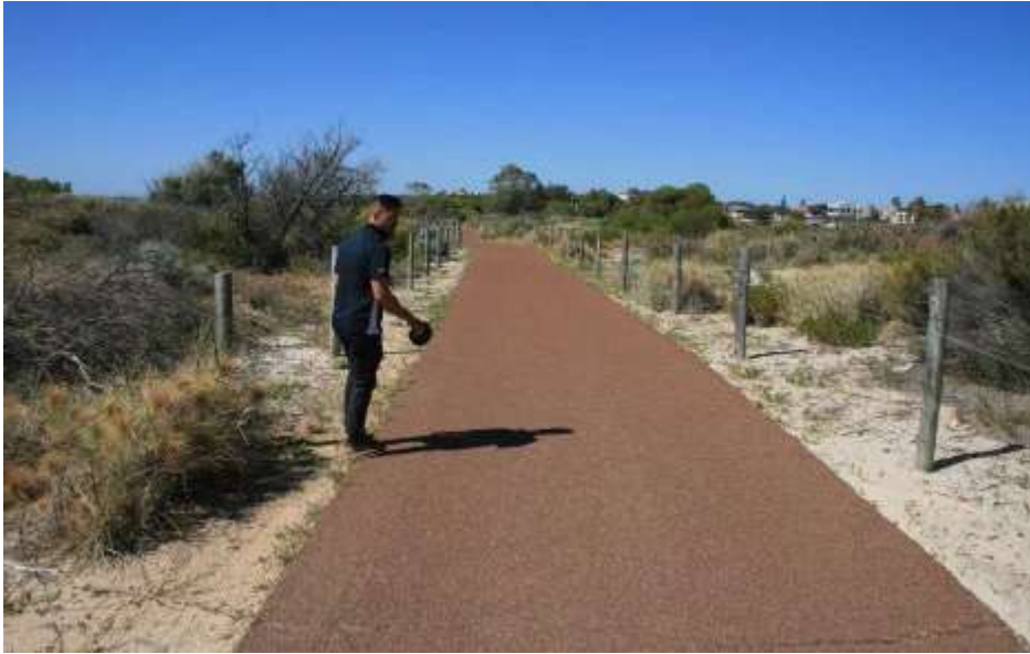
Plate 5: Coastal Share path at Ch 1800 – 2700: Hillarys animal beach carpark to Whitfords Avenue / Northshore Drive (FPR2300)– currently 3m wide asphalt path.