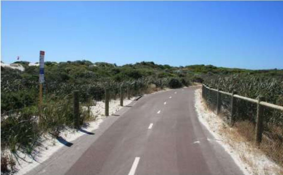
Plate 1: Coastal Share path at Ch 1385 – 1800: Hillarys animal beach carpark – currently 4m wide asphalt path in good condition.