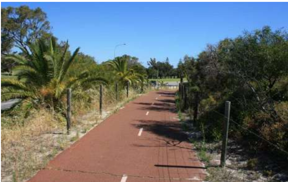
Plate 10: Coastal Share path at Ch 2700 – 4275: Whitfords Avenue / Northshore Drive to Tom Simpson park (FPR2301) – currently 3m wide asphalt path.