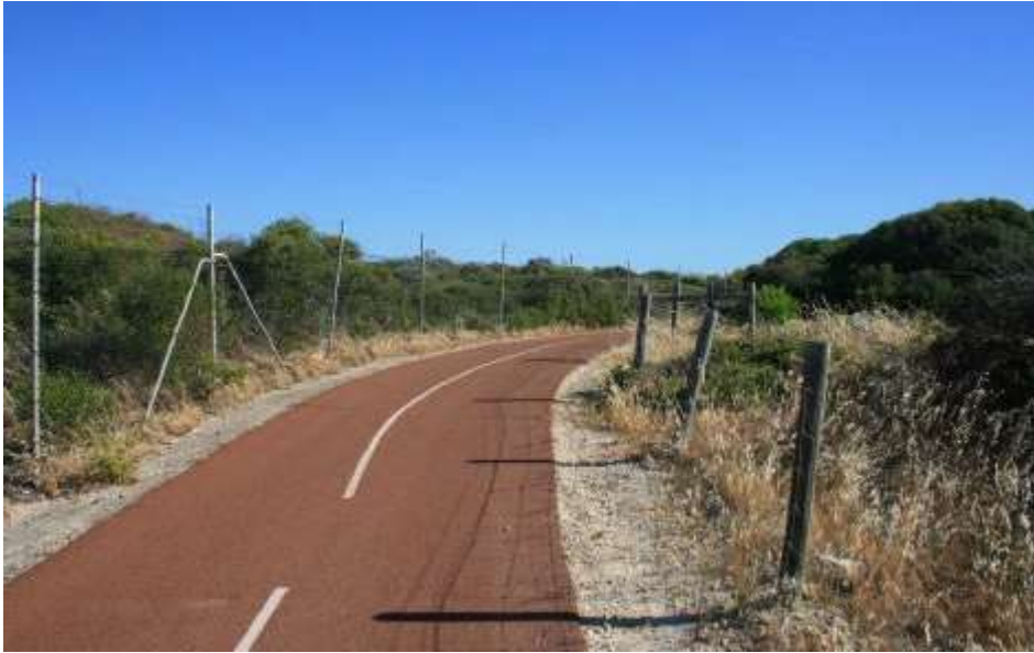
Plate 17: Coastal Share path at Ch 6570 – 7200: Swanson Way path to Ocean Reef Marina (FPR2297) – currently 3m wide asphalt path of poor condition.