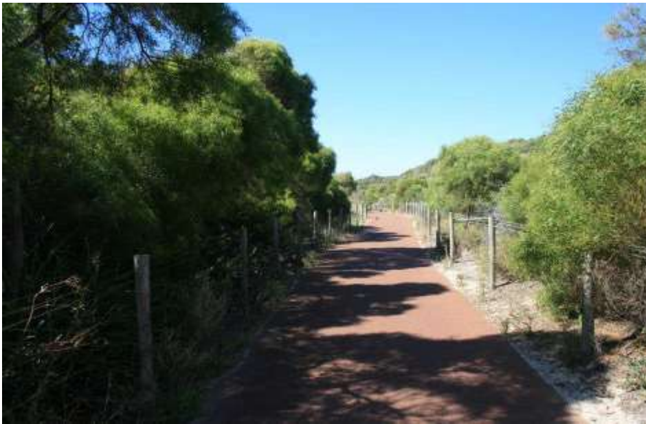
Plate 8: Coastal Share path at Ch 2700 – 4275: Whitfords Avenue / Northshore Drive to Tom Simpson park (FPR2301) – currently 3m wide asphalt path.