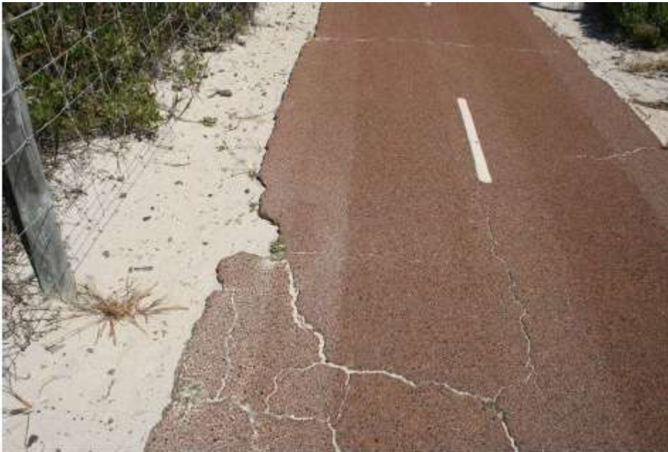
Plate 2: Coastal Share path at Ch 700 – 1385: Whitfords Nodes carpark to Hillarys animal beach carpark (FPR2299) – currently 2m wide asphalt path in poor condition.