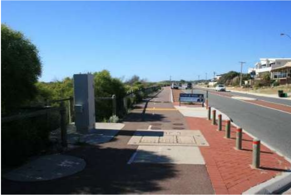
Plate 13: Coastal Share path at Ch 4275 – 5590: Tom Simpson park to Westview carpark – currently 3m wide asphalt path of good condition.