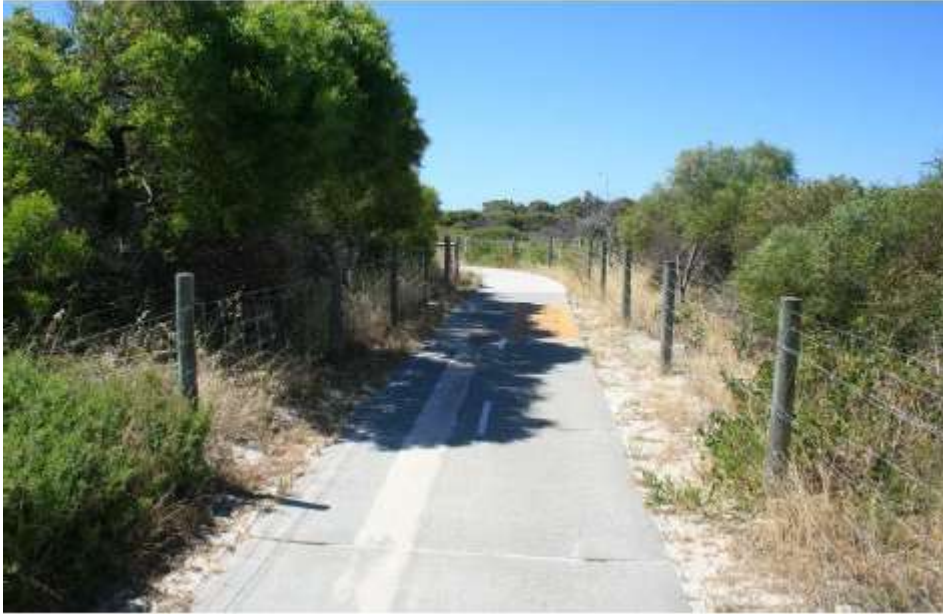
Plate 1: Coastal Share path at Ch 700 – 1385: Whitfords Nodes carpark to Hillarys animal beach carpark (FPR2299) – currently 2m wide concrete path in poor condition.