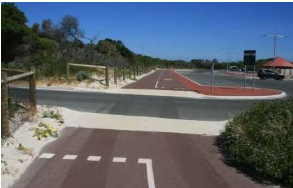
Plate 2: Coastal Share path at Ch 1385 – 1800: Hillarys animal beach carpark – currently 4m wide asphalt path in good condition.