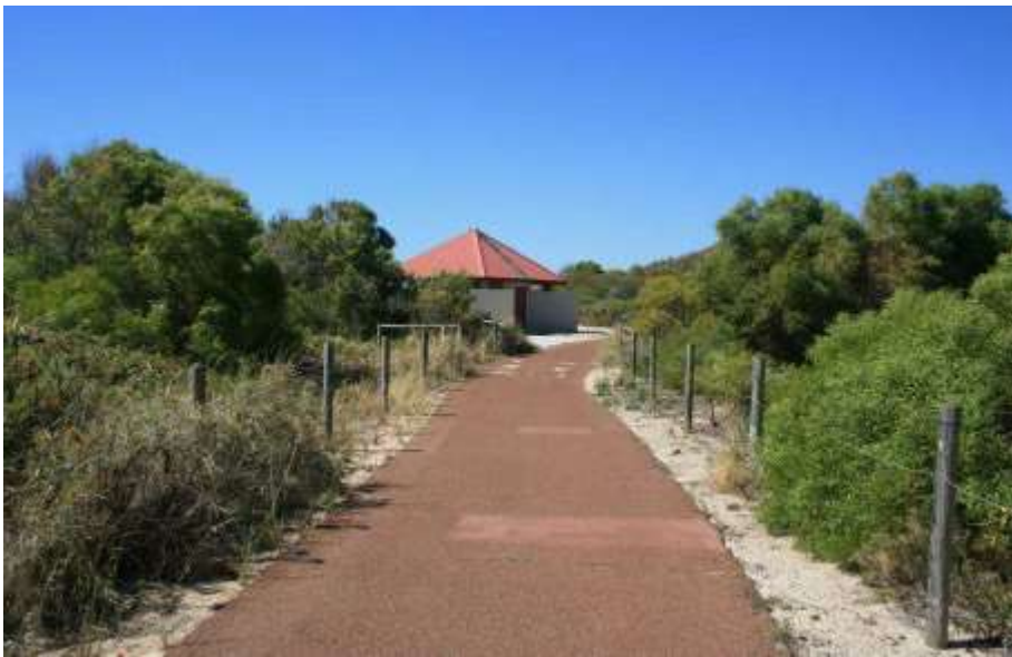
Plate 6: Coastal Share path at Ch 2700 – 4275: Whitfords Avenue / Northshore Drive to Tom Simpson park (FPR2301) – currently 3m wide asphalt path.