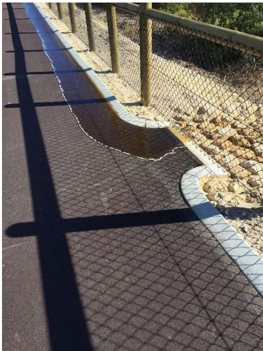
Plate 3: Kerbed to Stone Pitching Drainage