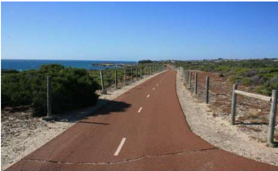
Plate 16: Coastal Share path at Ch 6570 – 7200: Swanson Way path to Ocean Reef Marina (FPR2297) – currently 3m wide asphalt path of poor condition.