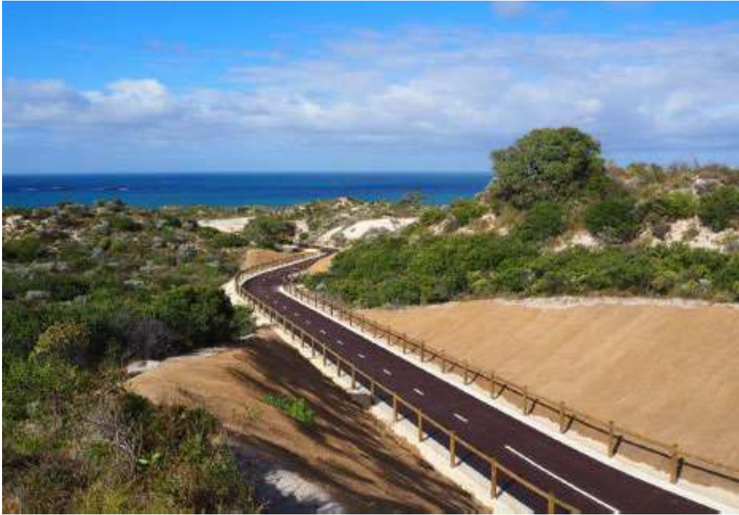
Plate 3: Example of Coastal Share path at 4m wide asphalt path in good condition.