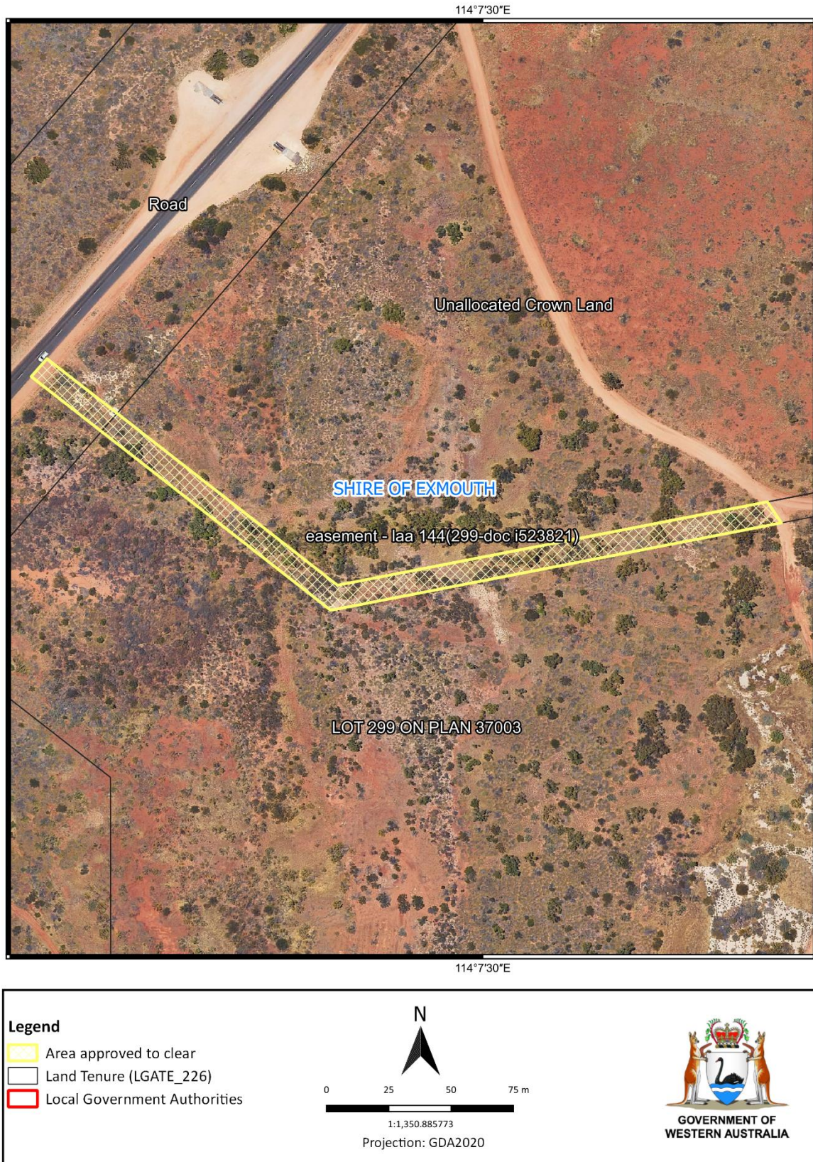
Figure 1: Map of the boundary of the area within which clearing may occur

The boundary of the area authorised to be cleared is shown in the map below (Figure 1).