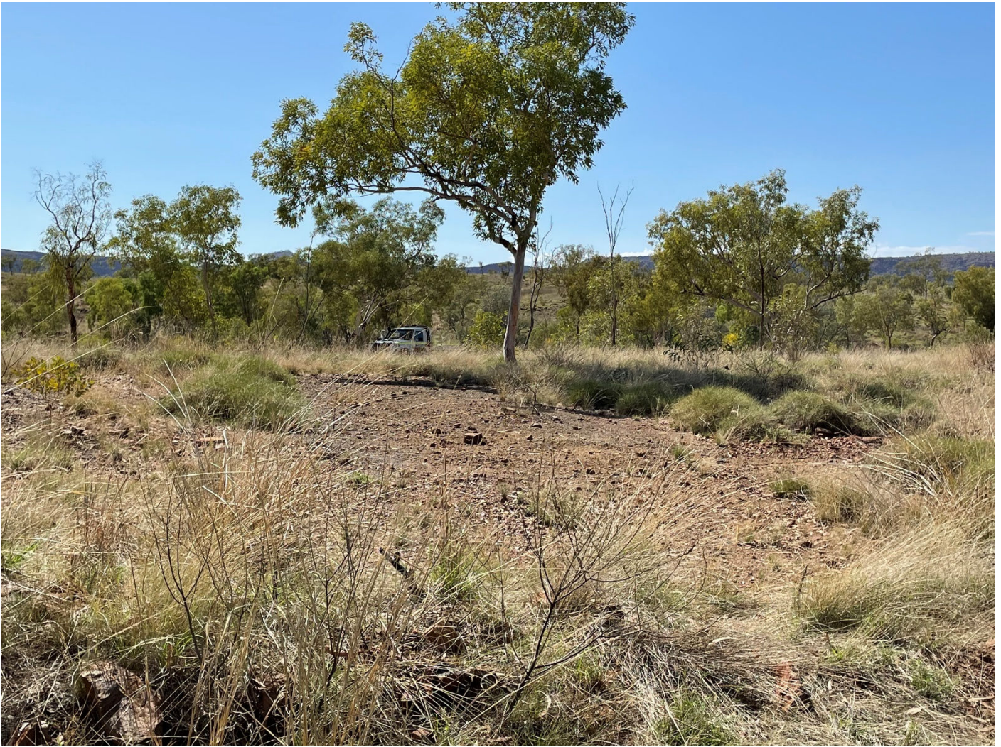
Photograph 2, Site of Proposed Hole B (Avoiding Tree) in Middle Distance. Vehicle at top centre is on Springvale Pastoral Track