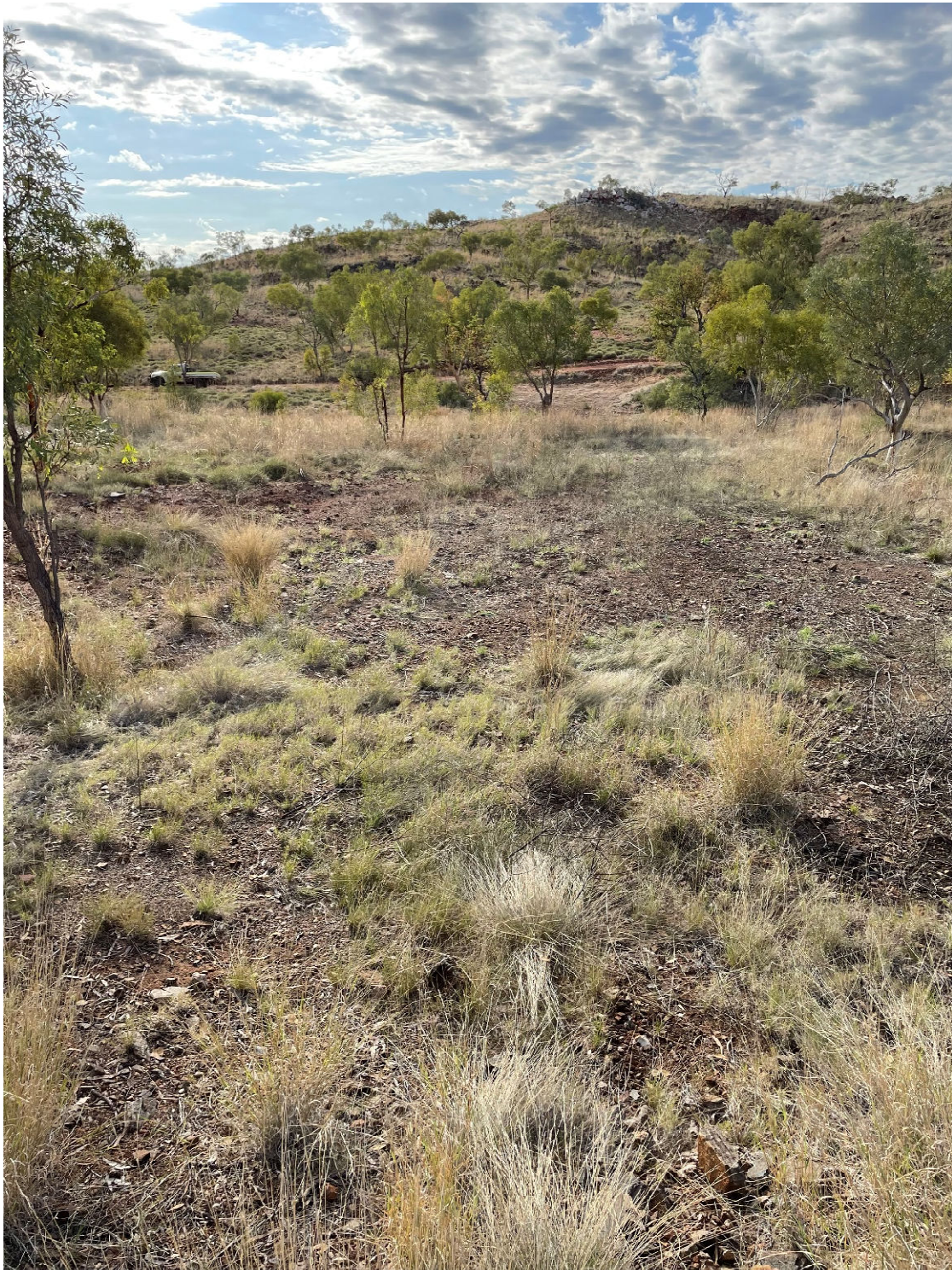
Photograph 1, Site of Proposed Hole A in Middle Distance. Vehicle at top left is on Springvale Pastoral Track