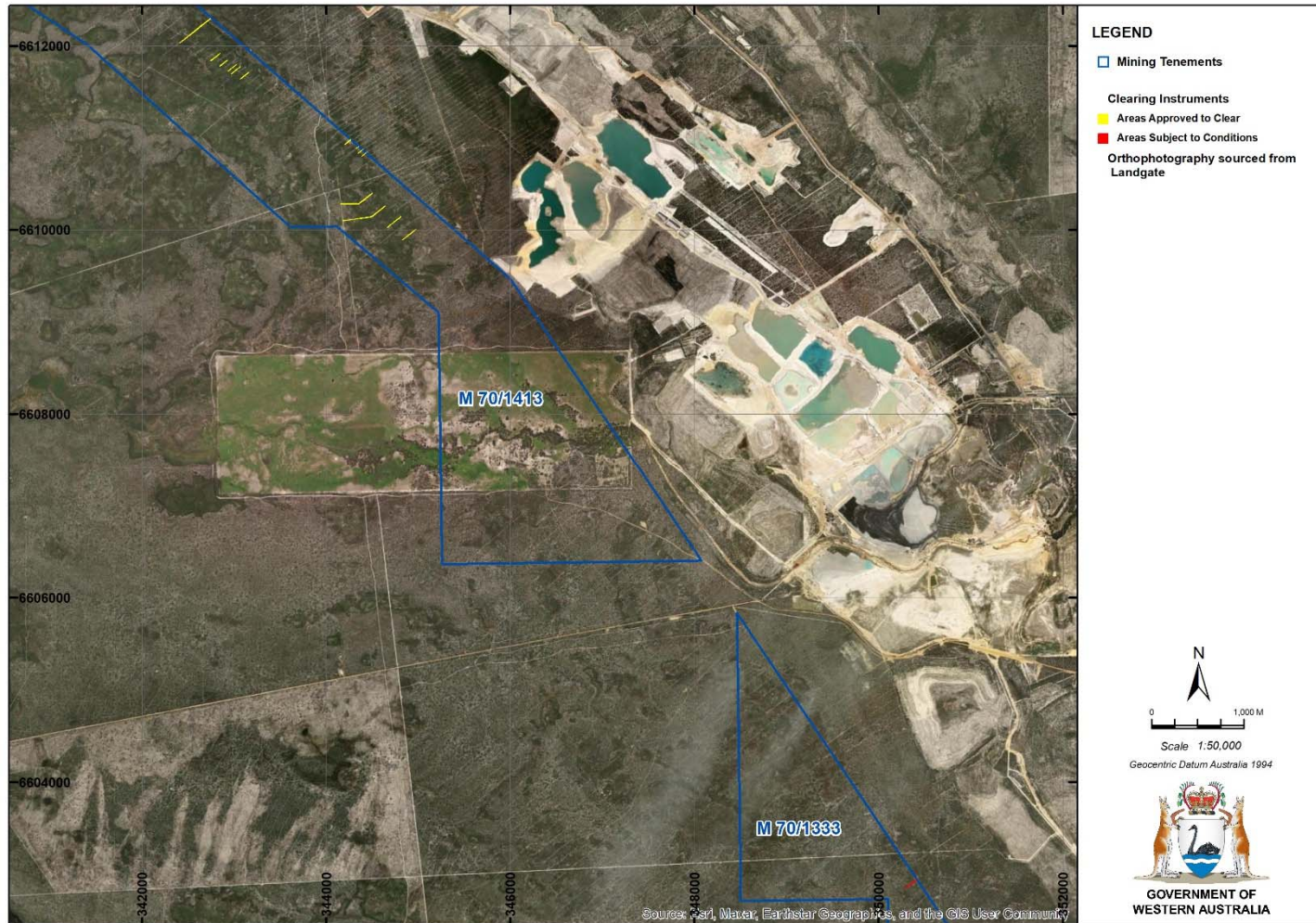
Figure 1: Map of the boundary of the area within which clearing may occur. Areas shaded in red are subject to Conditions.

The boundary of the area authorized to be cleared is shown in the map below (Figure 1).