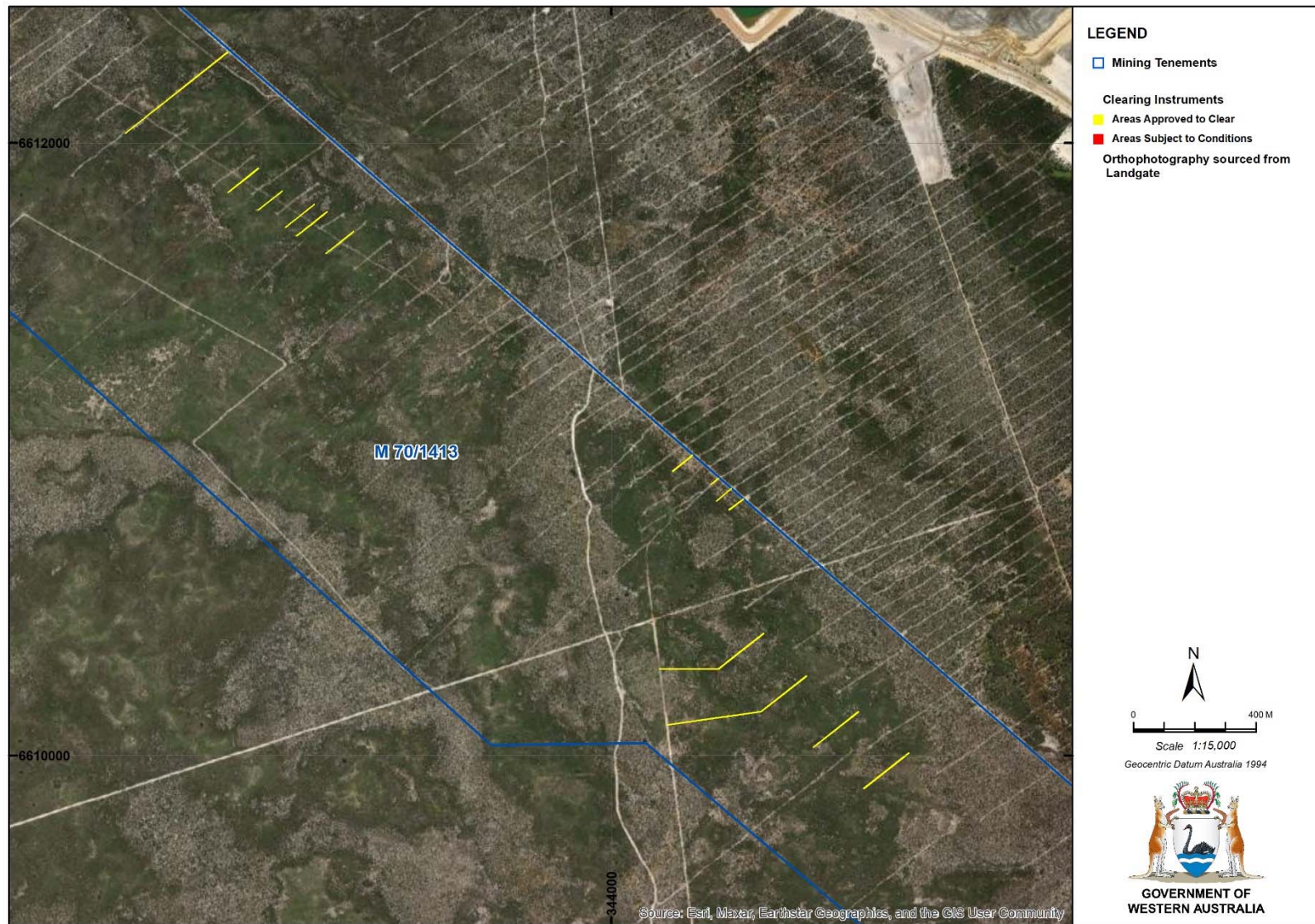
Figure 2: Map of the boundary of the area within which clearing may occur.