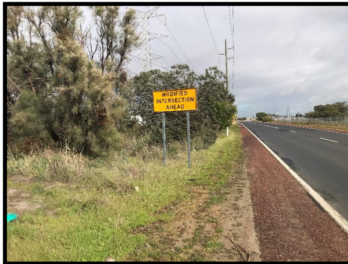
Plate 7: Banksia menziesii / Allocasuarina fraseriana

The Adenanthos cygnorum / Xanthorrhoea preissii Low Open Heath at the south-west corner of the current intersection has a dense ground cover of the native sedge Alexgeorgea nitens and a low density of taller native shrubs such as Acacia pulchella , Allocasuarina humilis and Bossiaea eriocarpa (Plate 8). A total of 17 native species in this small area at the end of July. Additional ephemeral species would be recorded in a spring survey. The very small size of the area to be cleared suggests the potential for Threatened plant species to occur in that area is very low.