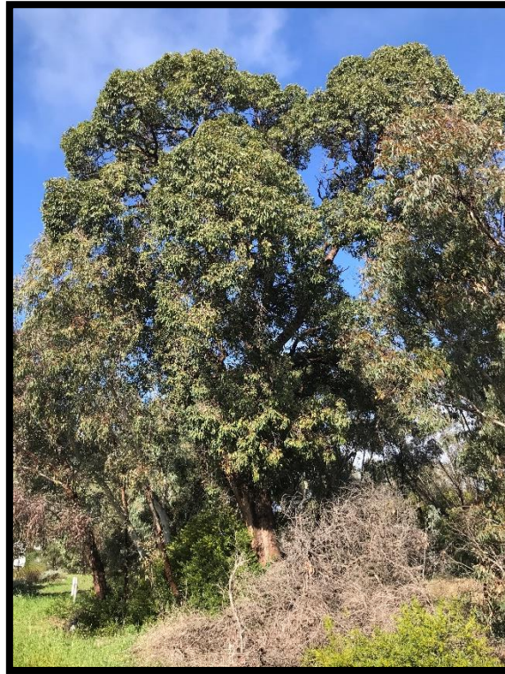
Plate 2: Eucalyptus tottiana scattered small trees