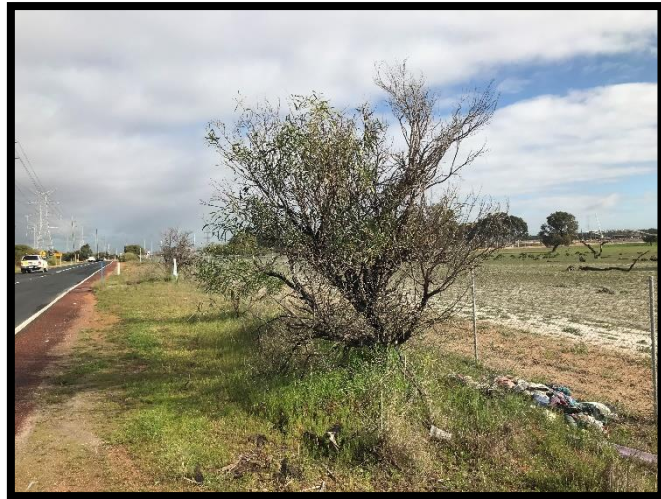
Plate 4: Adenanthos cygnorum shrubs