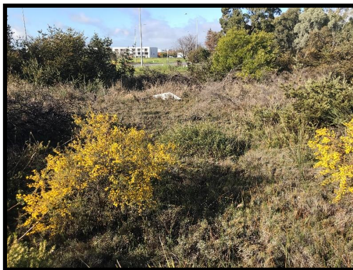
Plate 8: Adenanthos cygnorum / Xanthorrhoea preissii Low Open Heath