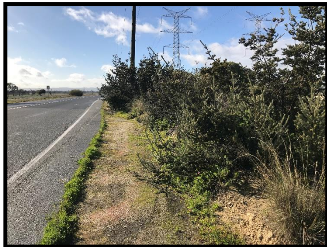
Plate 5: Xanthorrhoea preissii shrubs