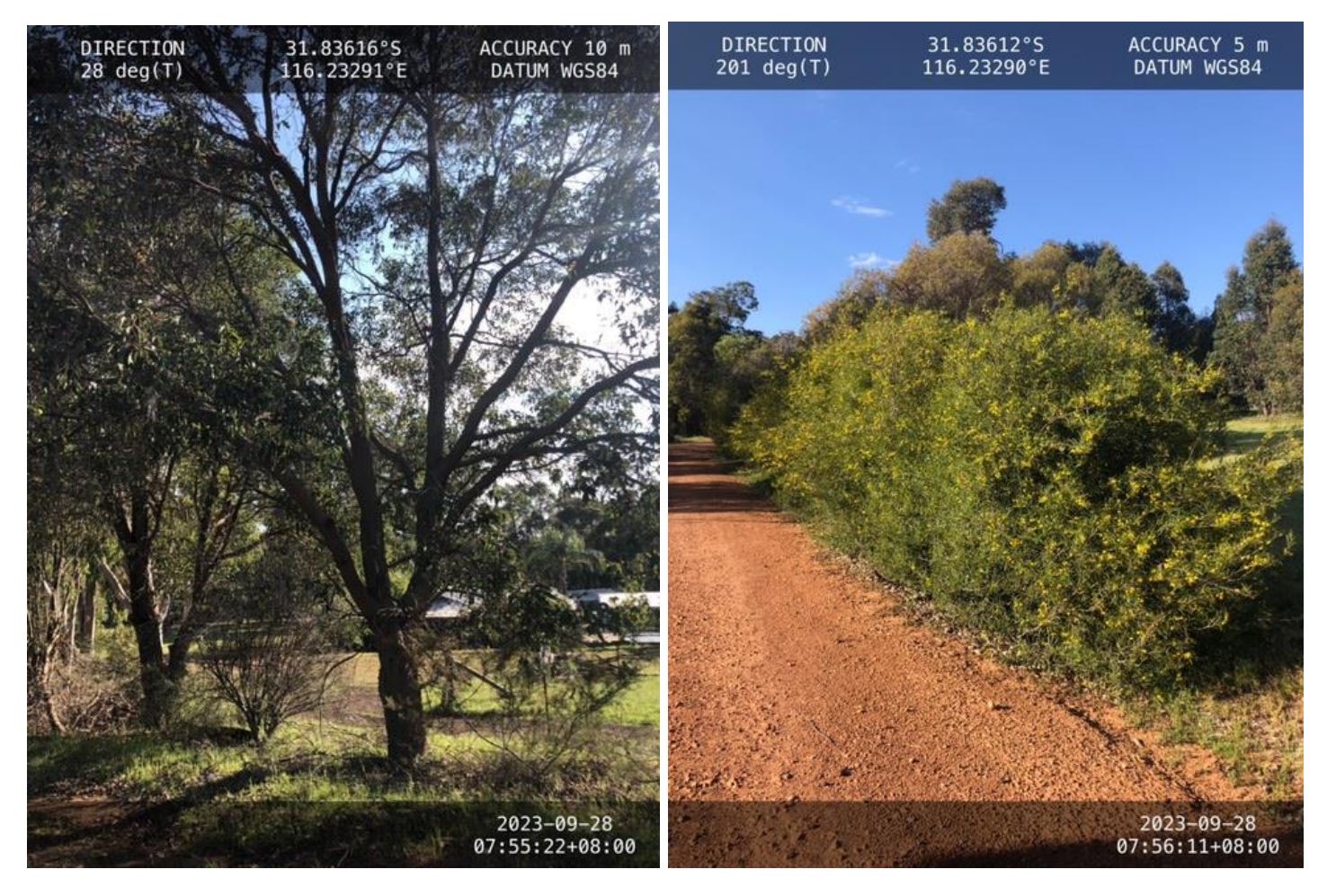
Photo 7 (above left): Native trees, such as the one in this photo will require pruning of lower branches only.

Photo 8 (above right): Planted native vegetation. Proposed to trim the vegetation in the first instance however may need to be removed for the proposed road upgrades.