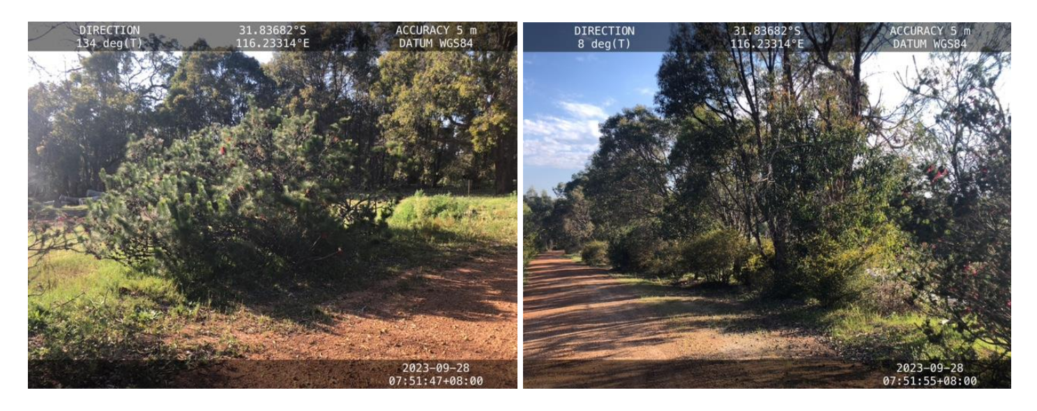
Photo 5 & 6 (above): Planted native vegetation, Calothamnus rupestris and Acacia saligna . Proposed to trim the vegetation in the first instance however may need to be removed for the proposed road upgrades. If cleared the area measures 420sqm (or 0.042ha) in total.

Photo 4 (above right): Native vegetation on the south side of the road verge that may be impacted. This includes a small Corymbia calophylla (Marri) under 30cm DBH and 1 x Banksia grandis .