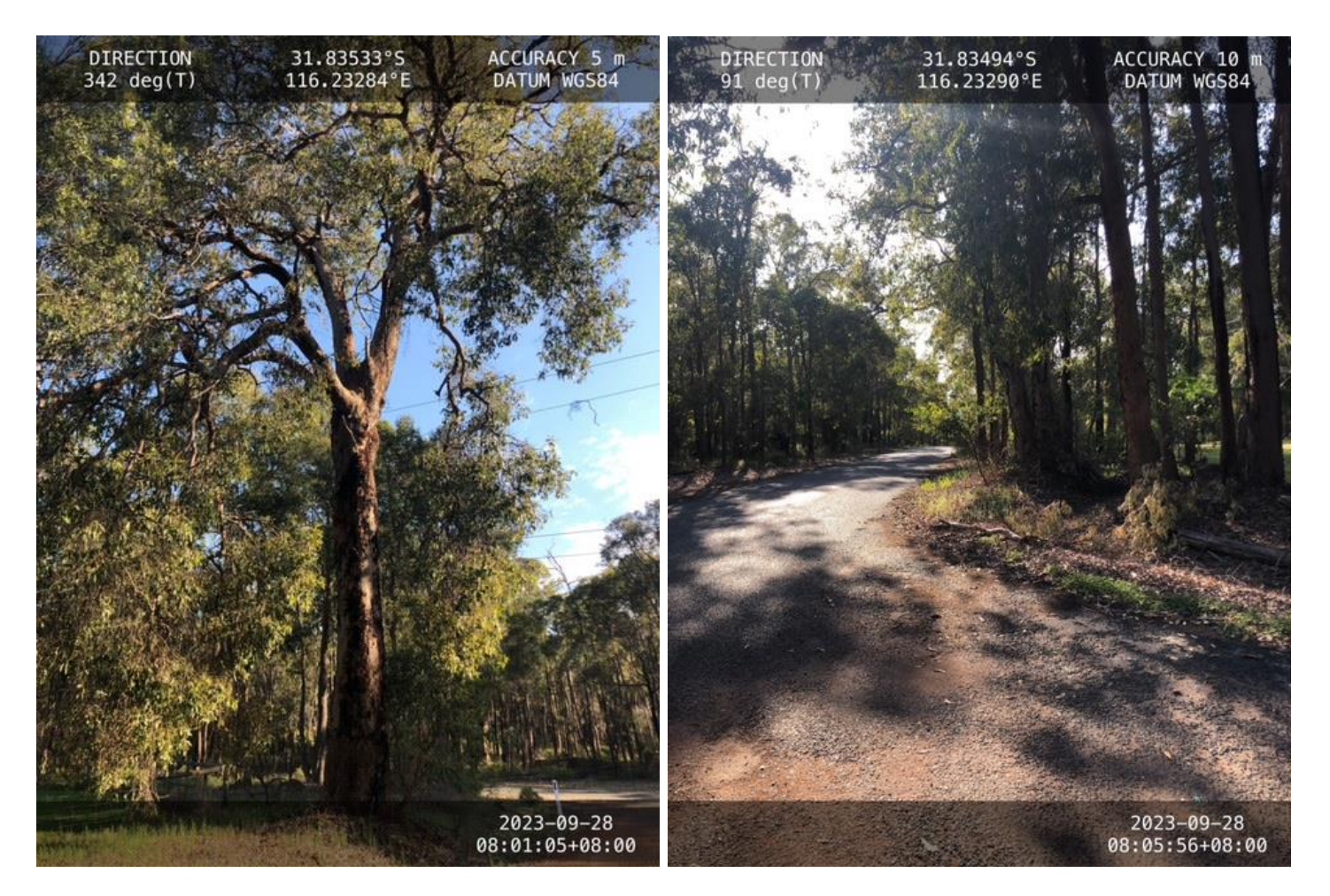
Photo 11 (above left): Habitat tree Corymbia calophylla (Marri) located near the south west corner of Honeyeater Glade. No impact to this tree with the proposed works. However there is some decline in the canopy which may be Marri Canker and would benefit from removal of dead and lower hanging branches. Environmental Services recommends measures are taken to protect the habitat tree during construction works.

Photo 12 (above right): View of sight lines looking east towards Keenan Road. Some minor trimming only is proposed.