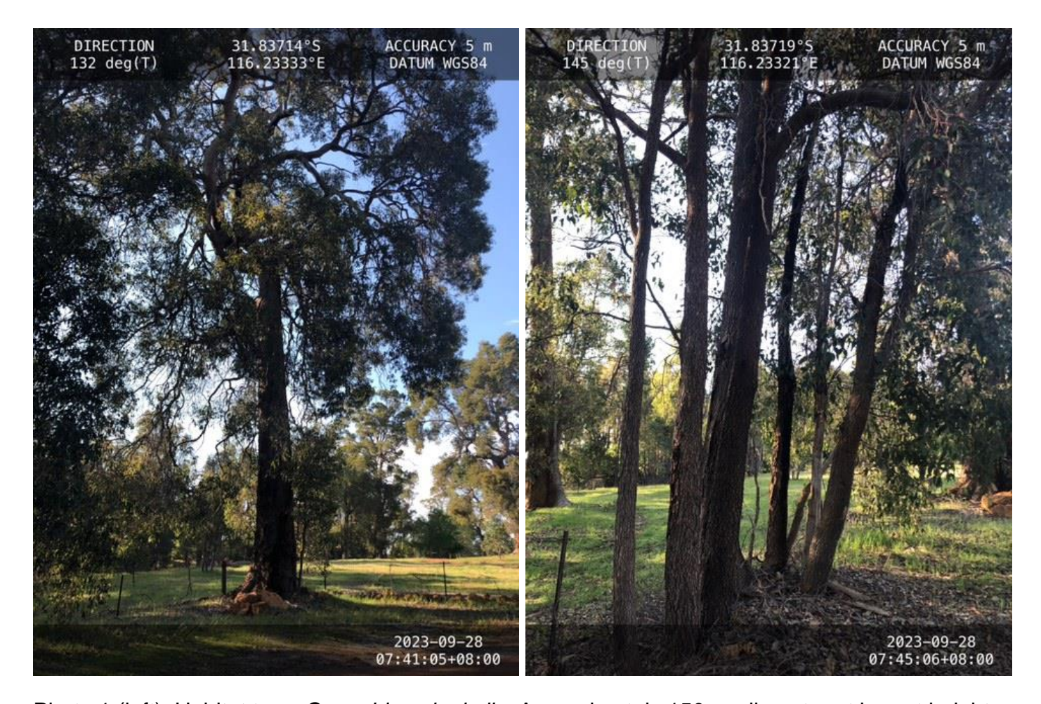
Photo 1 (left): Habitat tree, Corymbia calophylla . Approximately 150cm diameter at breast height (DBH). Tree is in good condition, one small hollow visible, possibly others. No impact with proposed road upgrades however Environmental Services recommends measures are taken to protect the habitat tree during construction with an area fenced off as a tree protection zone to create a physical barrier from construction works.

Photo 2 (right): Native vegetation that will be impacted on the northern side of the cul-de-sac. There are 7 native trees, all Corymbia calophylla (Marri) and under 30cm DBH.