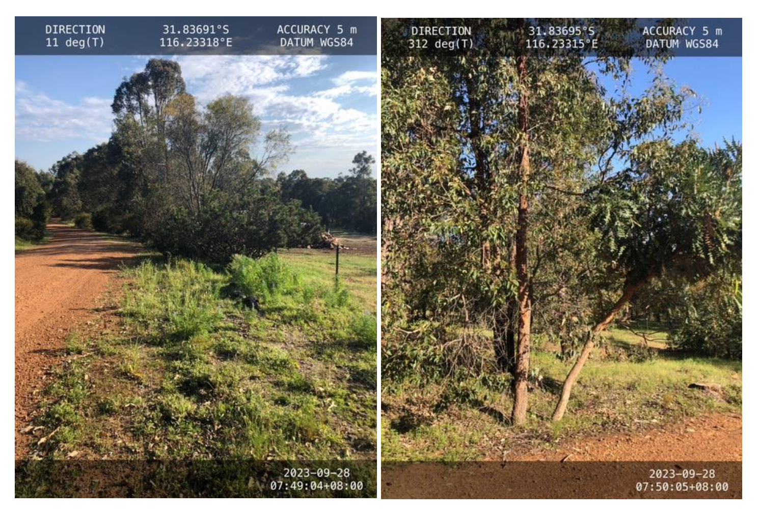
Photo 3 (above left): Weeds along the verge. No concerns with clearing however, follow up weed control after the completion of the road works is recommended.

Photo 4 (above right): Native vegetation on the south side of the road verge that may be impacted. This includes a small Corymbia calophylla (Marri) under 30cm DBH and 1 x Banksia grandis .