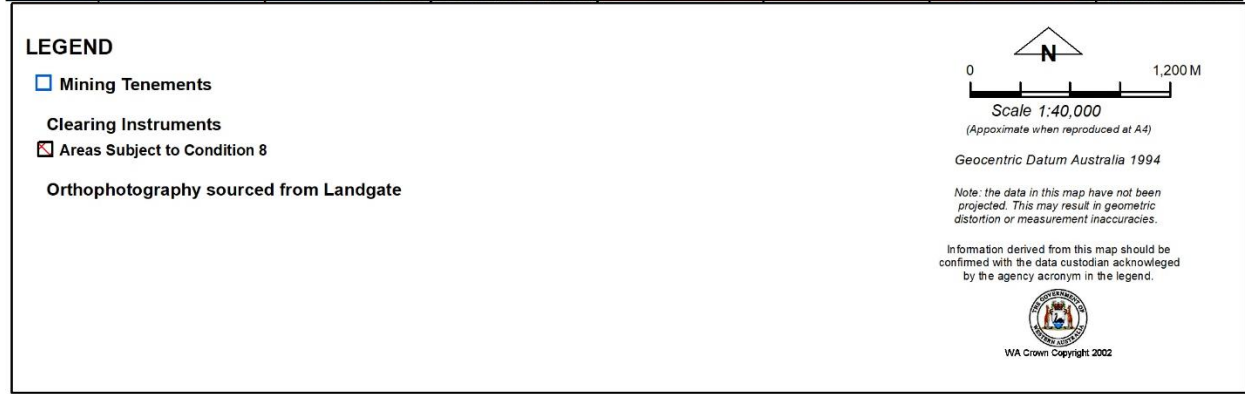
Figure 2: Map of the area subject to Condition 8.