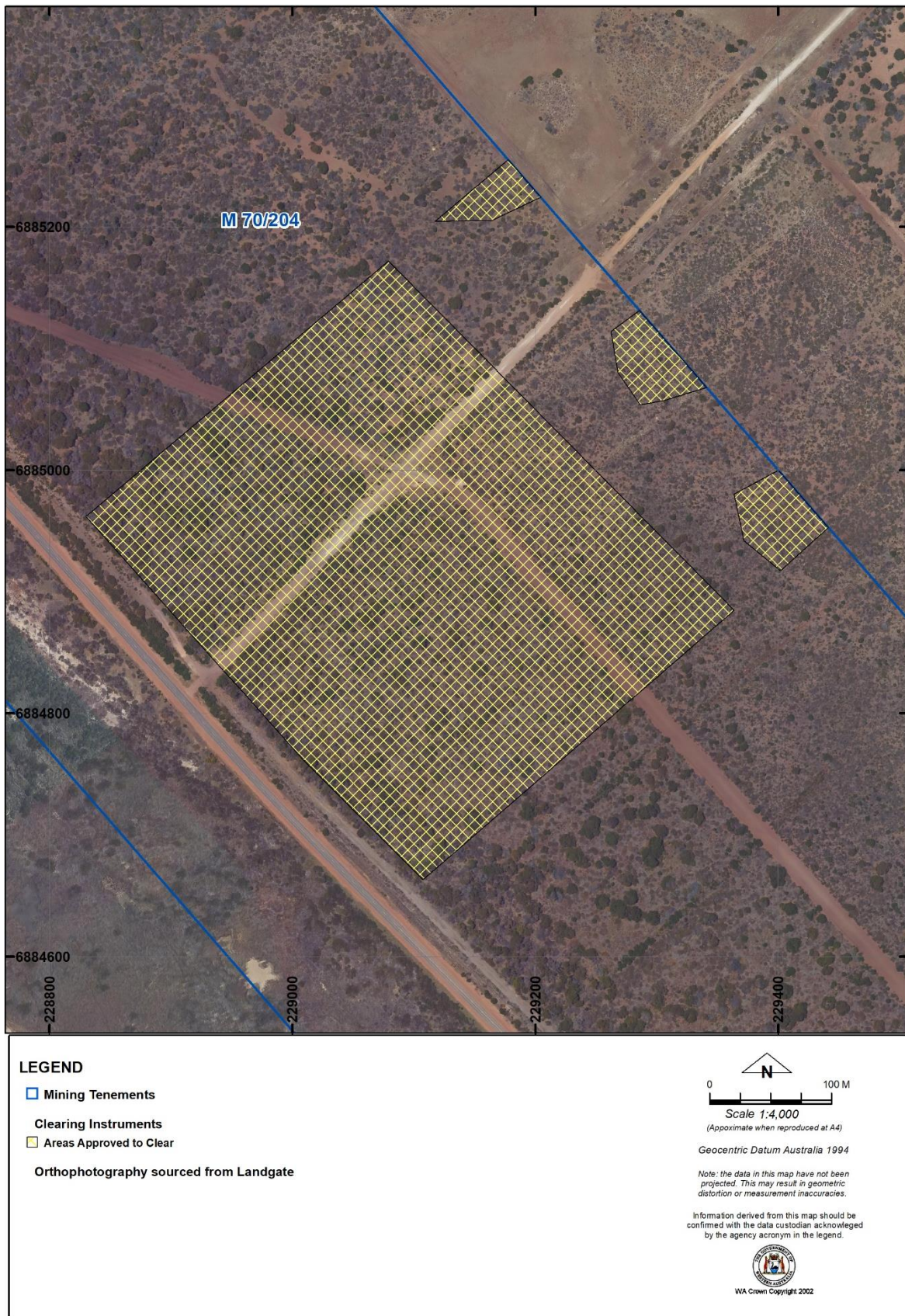
Figure 1: Map of the boundary of the area within which clearing may occur

The boundary of the area authorised to be cleared is shown in the map below (Figure 1).