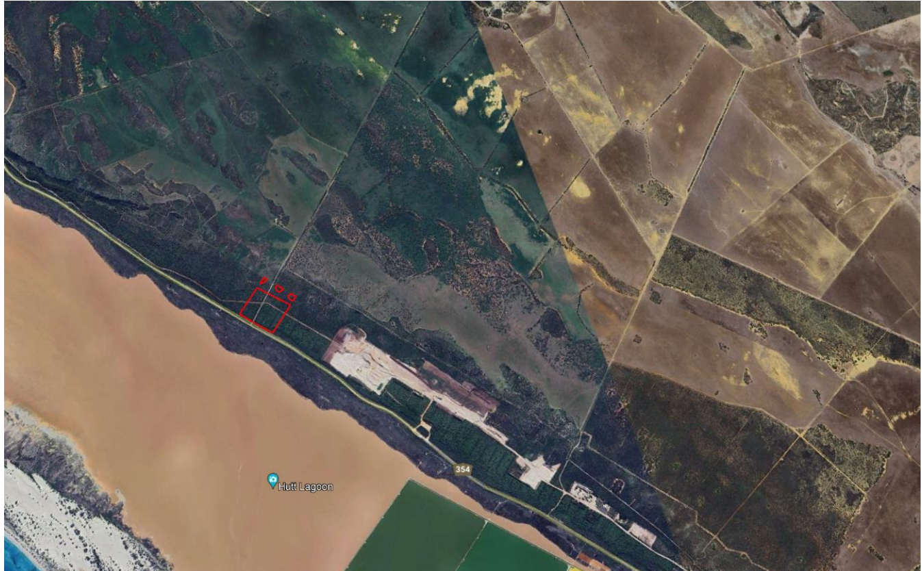
Figure 1. Aerial imagery showing land cleared for agriculture to the east of the application area (GIS Database).