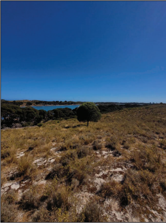
Figure 5: Buffer Offset site – Looking North.