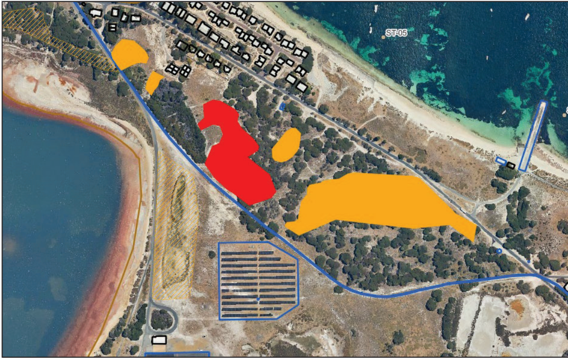
Figure 2: Aboriginal Cultural sites – Red (Registered), Yellow (Lodged); Black lines (Buildings); Blue lines (Infrastructure).