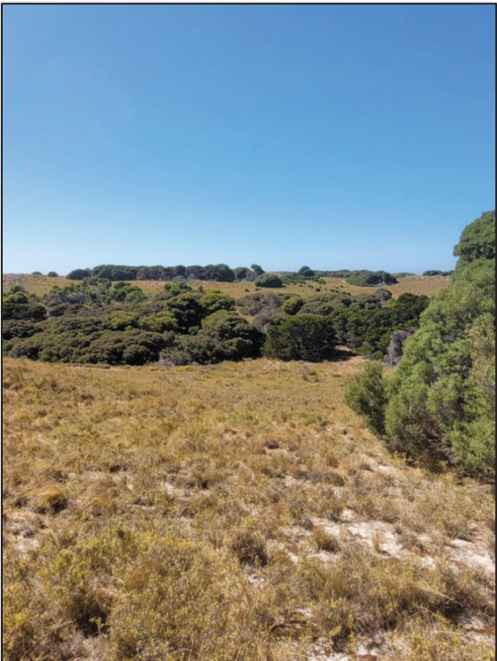
Figure 6: Buffer Offset site – Looking South-East.