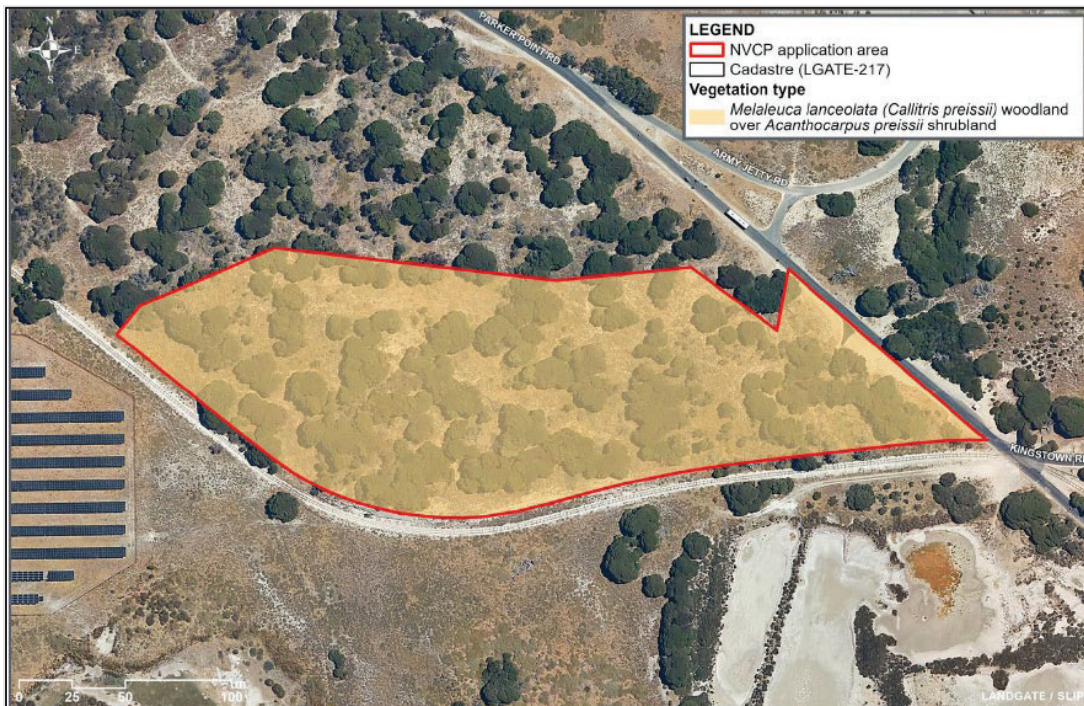
Figure 3 Vegetation types of the clearing site

The proposal includes the clearing of up to 3.29 ha of potential TEC. The vegetation condition within the Survey Area ranged from Very Good to Degraded.