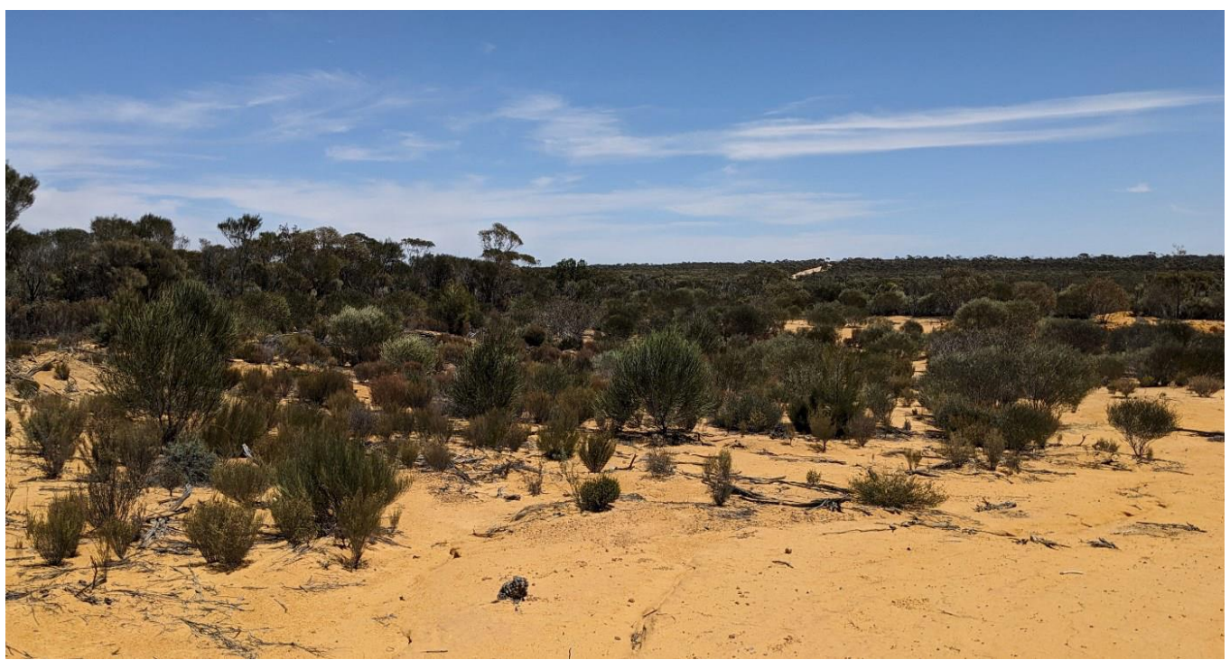
Figure 1. Existing clearing and revegetation in the application area (MBS, 2023).