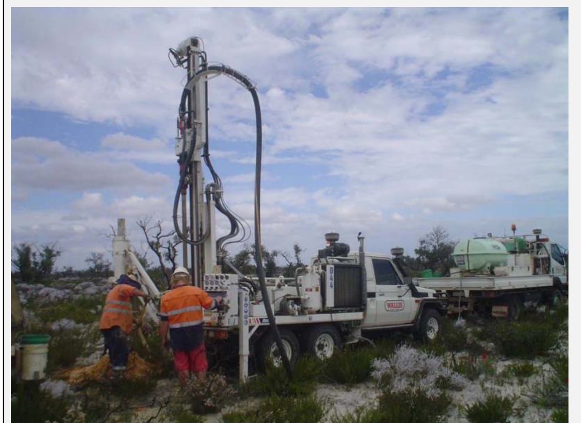
Plate 1: Example of exploration drill rig avoiding large scale clearing by driving over and around vegetation instead of removal.

The proponent provided details of successful rehabilitation following drill programs within the area (Tronox, 2024a).