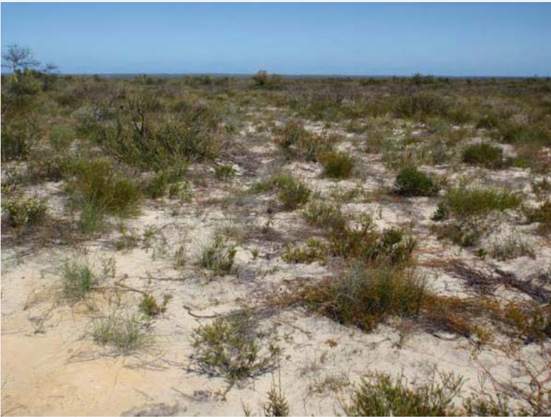
Plate 2: Example of a two year old exploration line where vegetation was previously been driven over.

An additional flora survey was undertaken in October 2023 (Umwelt, 2024b).