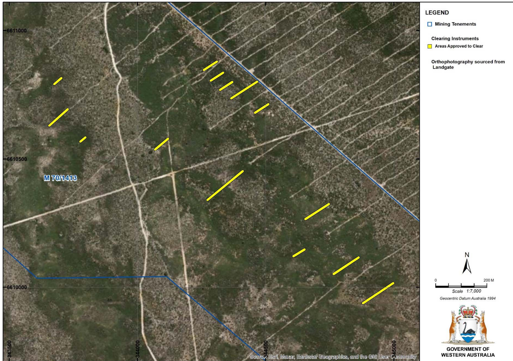
Figure 3: Map of the boundary of the area within which clearing may occur.