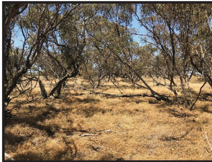
Plate 10: Typical stem diameter of trees on site

The York Gum trees in and around the old household consist of two distinct stands, one to the north of the house and one to the east of the house surrounding a large dam. The size of the northern stand is around 2.6ha and the size of the eastern stand around 2.0ha. If considered as two separate patches the size of the patches is below the minimum 5ha required to meet the Eucalypt Woodland PEC criteria. If the stands are considered as one patch, PGV Environmental has calculated that the size of the patch is around 4.57ha which is also below the minimum 5ha required to meet the Eucalypt Woodland PEC criteria.