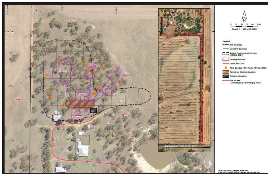
Plate 1: Area requiring ACM remediation

The Department of Planning, Lands and Heritage (DPLH) is managing the remediation of asbestos containing material (ACM) at the Former Gnowangerup Agricultural College on 493 Gnowangerup-Jerramungup Road, Jackitup, on behalf of the Department of Education. The area of remediation is approximately 3,500m 2 and is shown by the black dashed line in Plate 1.