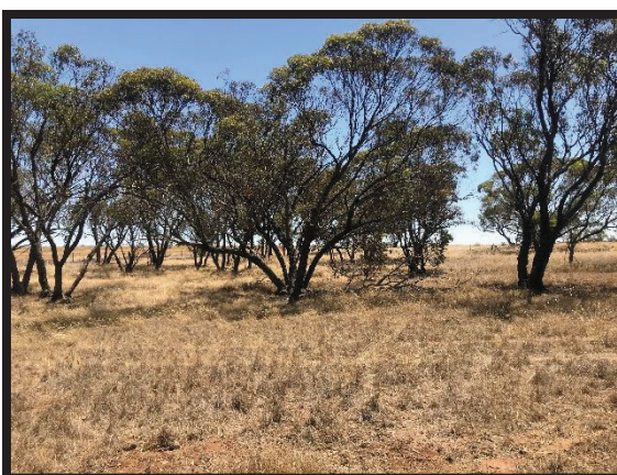
Plate 5: North-west area