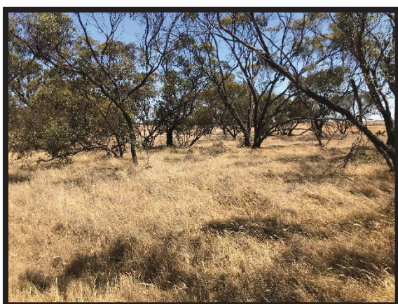
Plate 6: North-east area