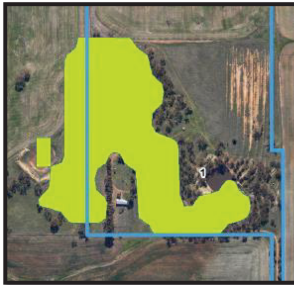
Plate 2: Priority 3 Ecological Community mapped on the site

The remediation area is mapped within a WA Priority 3 Ecological Community (PEC) as shown in Plate 2 (as provided to PGV Environmental by DPLH). The specific PEC is the 'Eucalypt Woodlands of the Western Australian Wheatbelt'.