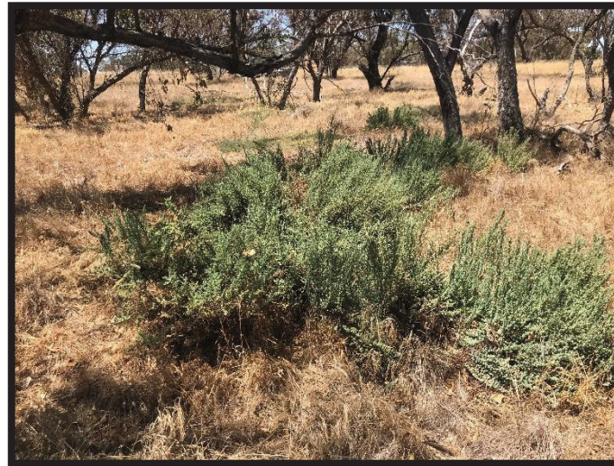
Plate 8: Small stand of Maireana brevifolia

Overall, the percentage cover of native understorey was rated as 2-5% in the area shown on Plate 9 and 0% outside that central area. The area shown on Plate 9 with sparse native understorey is around 0.42ha in size.