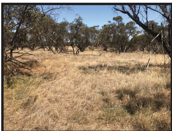
Plate 4: Southern area