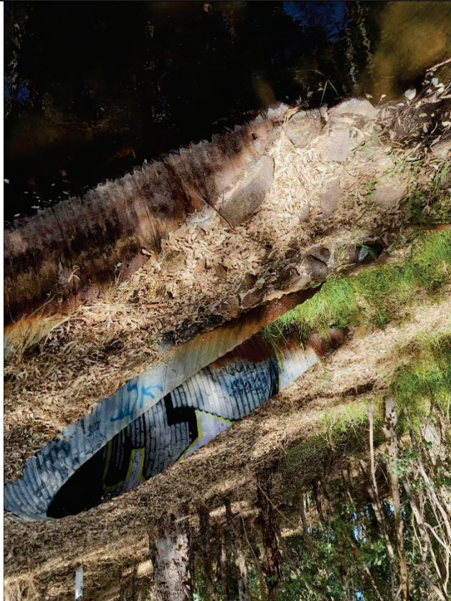
Area 1 (not recommended)