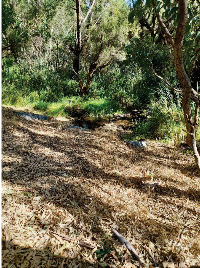
Area 2 (Not Recommended)