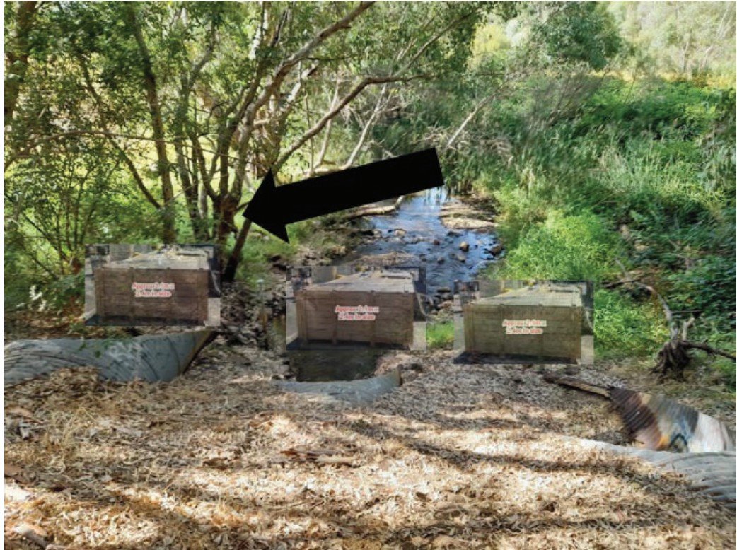
Area 4 (recommended)

please refer to Figure 3: Recommended Trees to be removed.