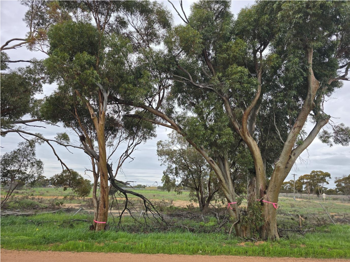
Site 1 - 2 Trees.