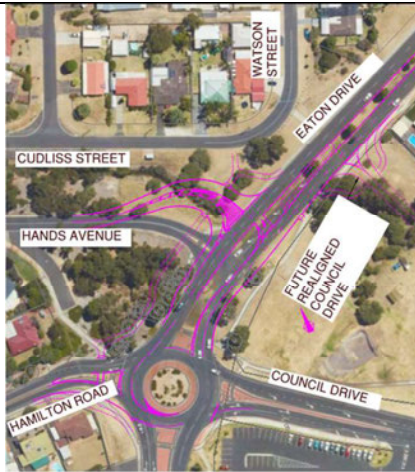
MRWA Modifications Concept 2021, shifting Hands Ave intersection away from roundabout

This concept would have had a much greater impact on vegetation including Hands Creek. The proposed new Cudliss Street intersection concept, developed by the Shire, including closing of a portion of the existing Hands Avenue, has recently been endorsed by Council and has a significantly lower impact on vegetation as well as Hands Creek.