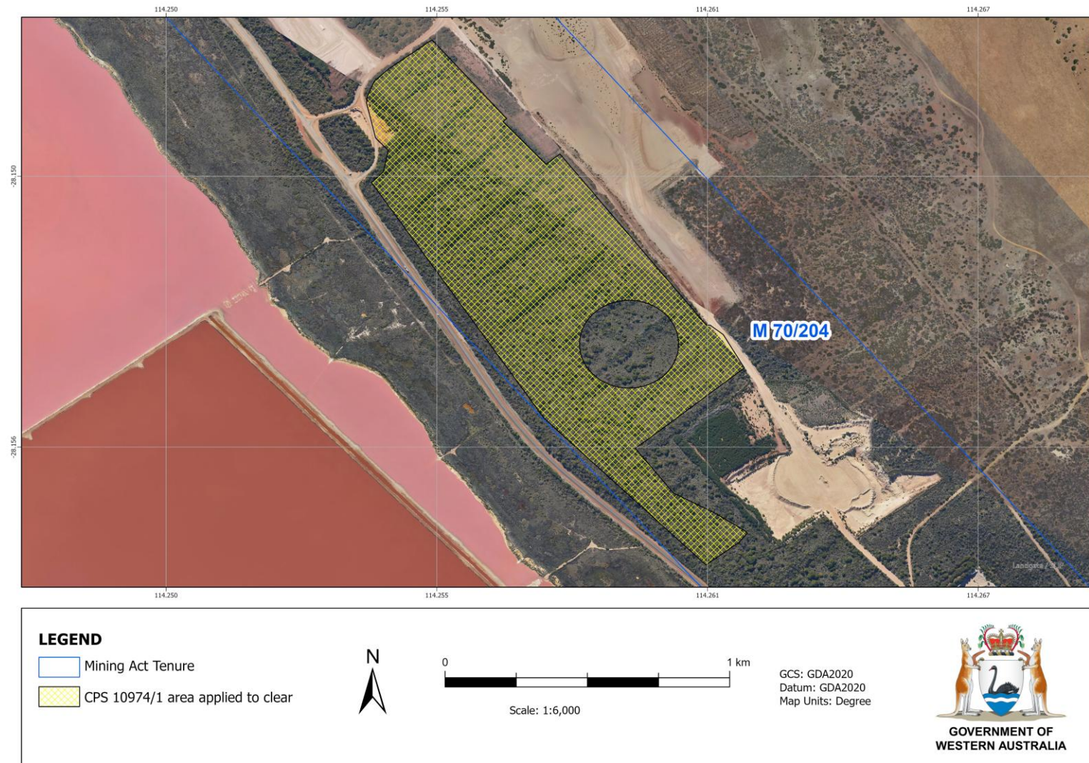
Figure 1: Map of the boundary of the area within which clearing may occur.

The boundary of the area authorised to be cleared is shown in the map below (Figure 1).