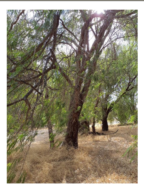
Photo: 2 Description: Row of peppermint trees within clearing extent