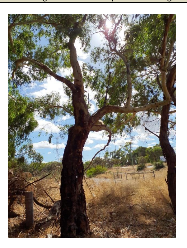
Photo: 4 Description: Vegetation along eastern boundary within clearing extent