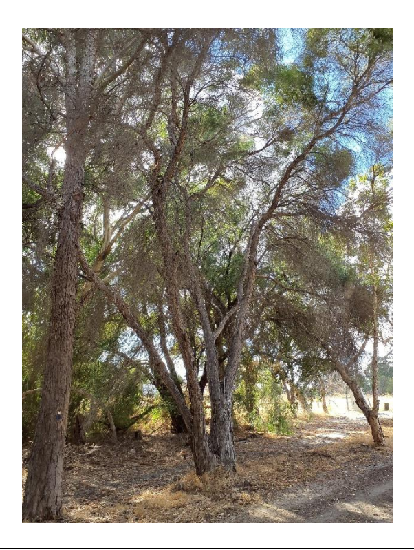
Photo: 3 Description: Vegetation along eastern boundary within clearing extent