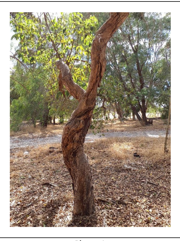
Photo: 1 Description: Marri within clearing extent, assessed as unhealthy