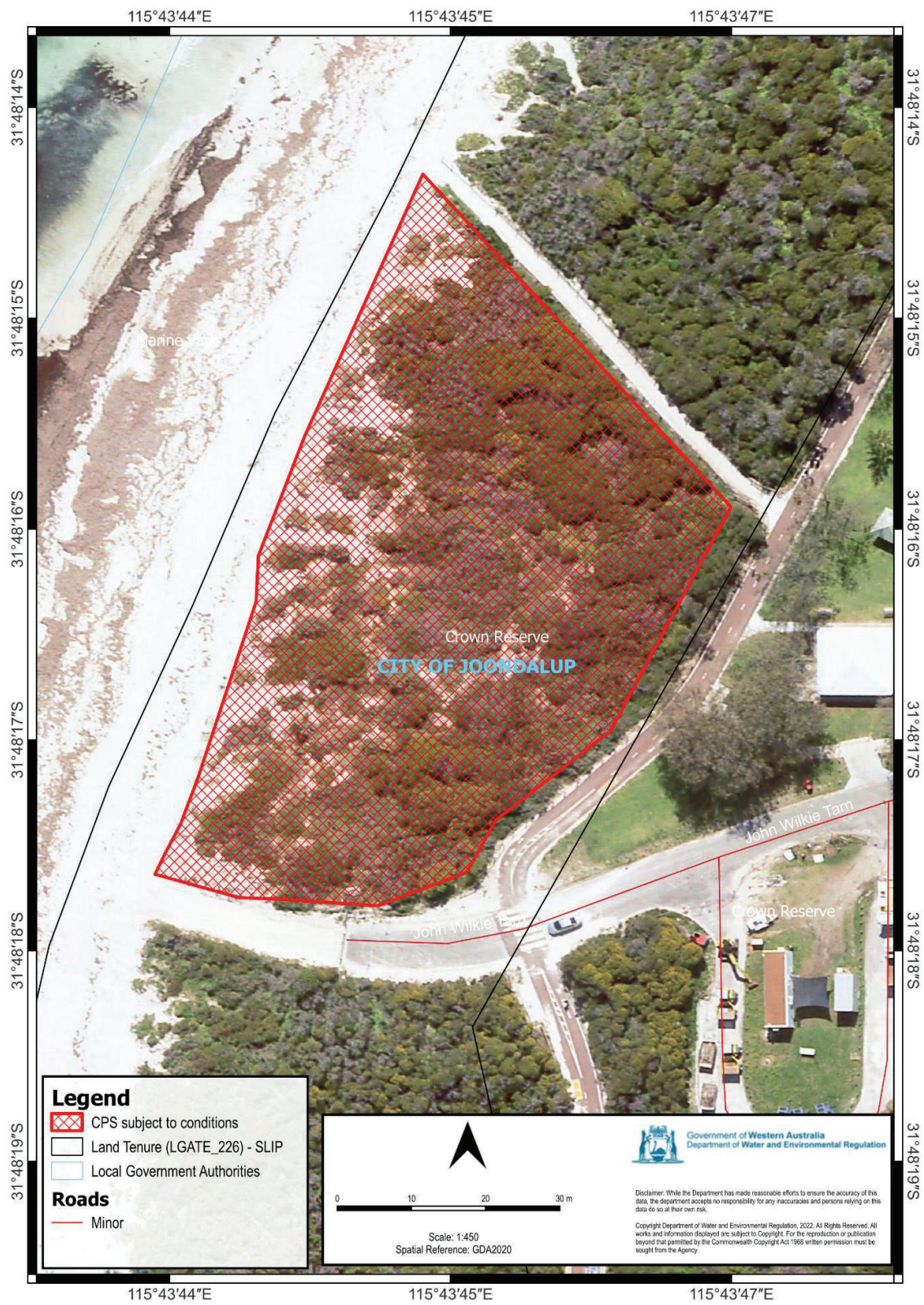
Figure 3: Map of the boundary of the area subject to condition 5 (offset)