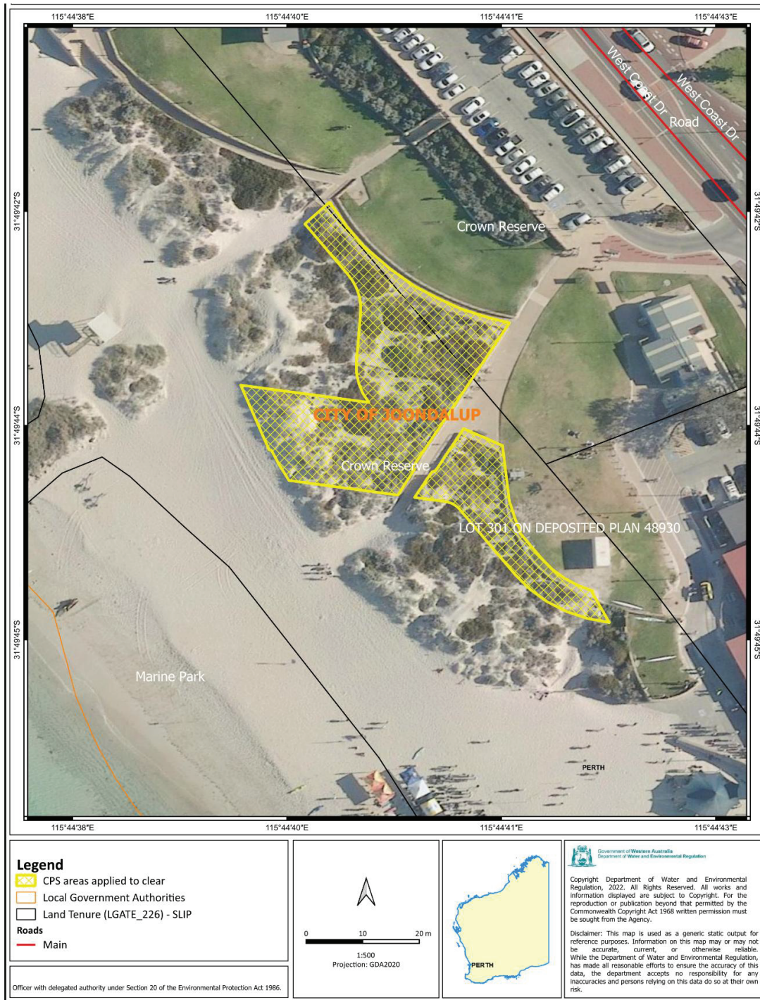
Figure 1: Map of the boundary of the area within which clearing may occur

The boundary of the area authorised to be cleared is shown in the map below ( Figure 1).