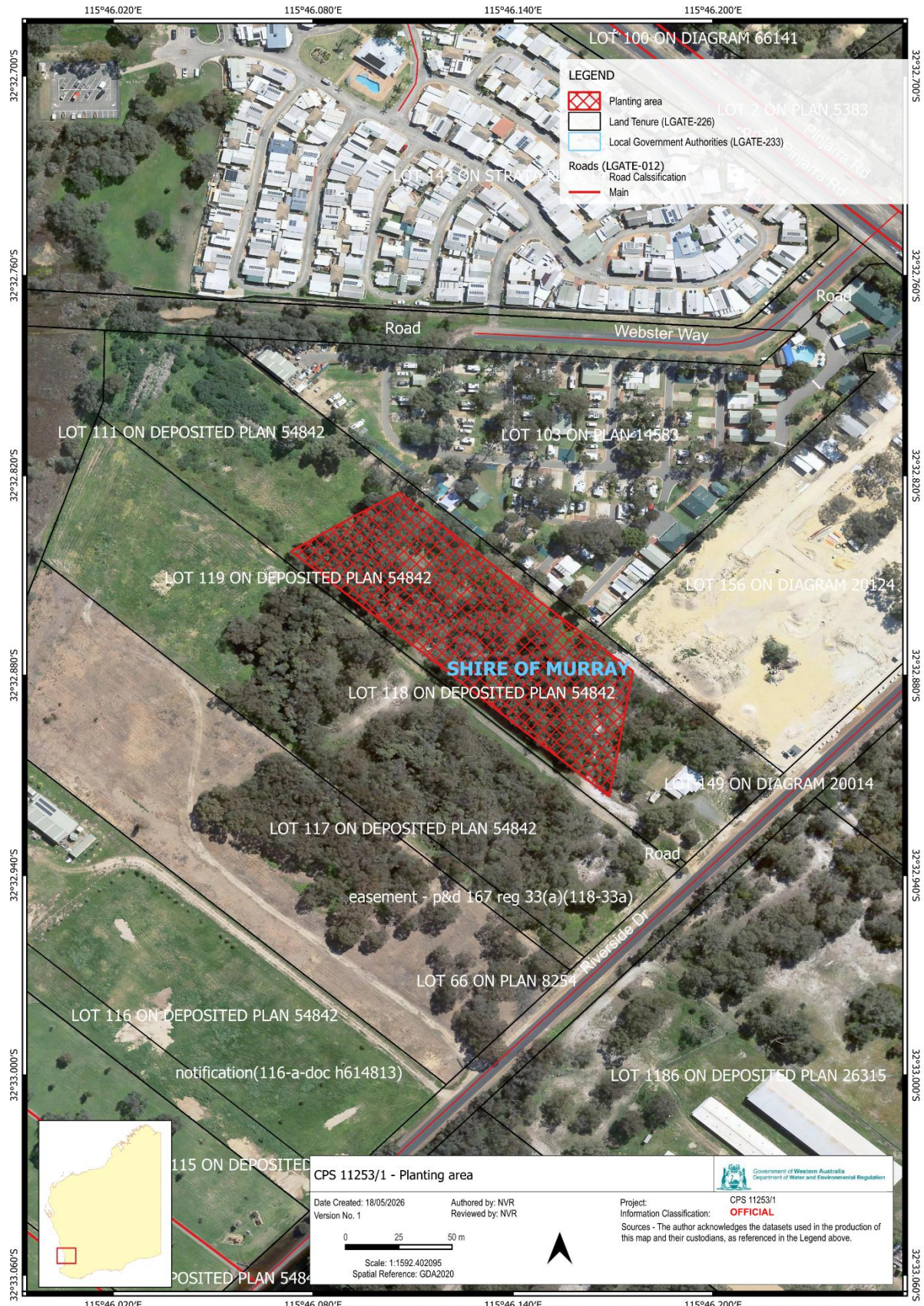
Figure 2: The area cross-hatched red is the area within which native tree planting must occur. Required plantings will be species that provide black cockatoo foraging habitat.