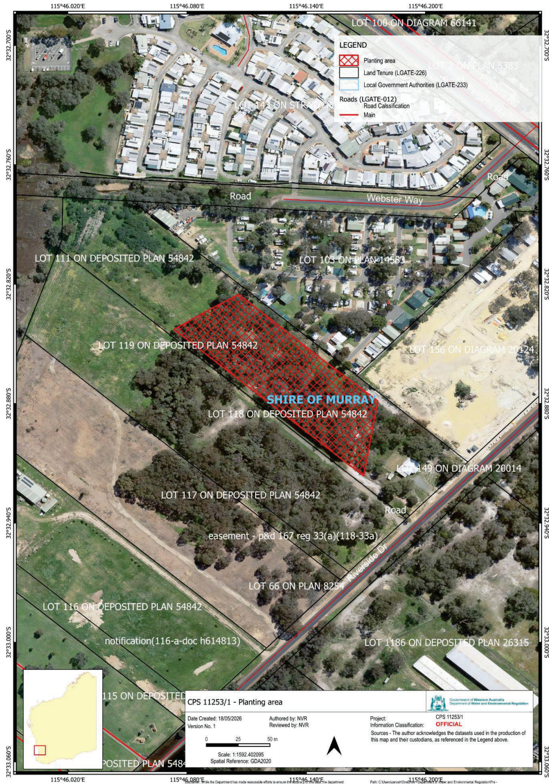
Figure 2: Map of the boundary of the area cross-hatched red within which planting pursuant to condition 9 must occur.

The boundary of the area subject to tree planting requirements is shown in Figure 2.