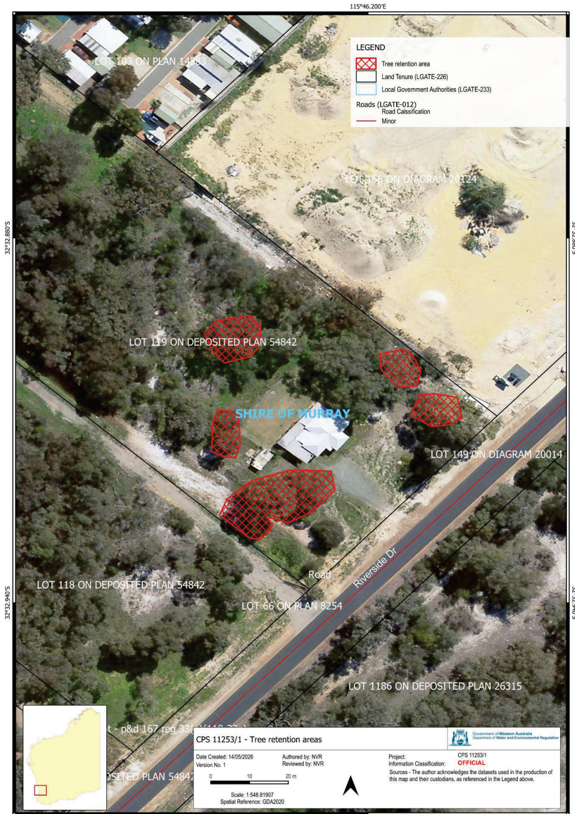
Figure 3: Map of the boundary of the area cross-hatched red within which tree retention pursuant to condition 11 must occur.

The boundary of the area subject to tree retention requirements is shown on Figure 3.