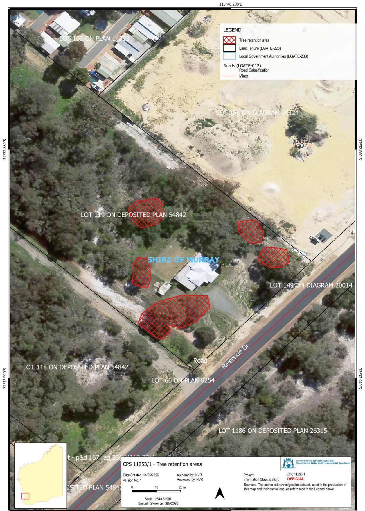
Figure 3: The area cross-hatched red includes the 8 native trees which must be retained.