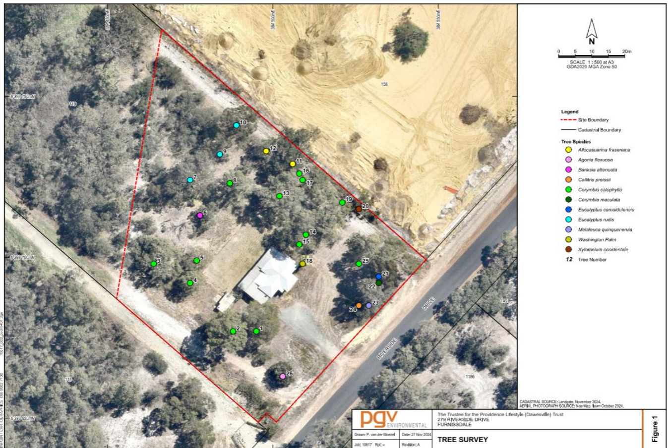
Figure 5. Location of trees recorded during the vegetation assessment. Note that trees 1-5, 7, 19 and 25 are proposed for retention.