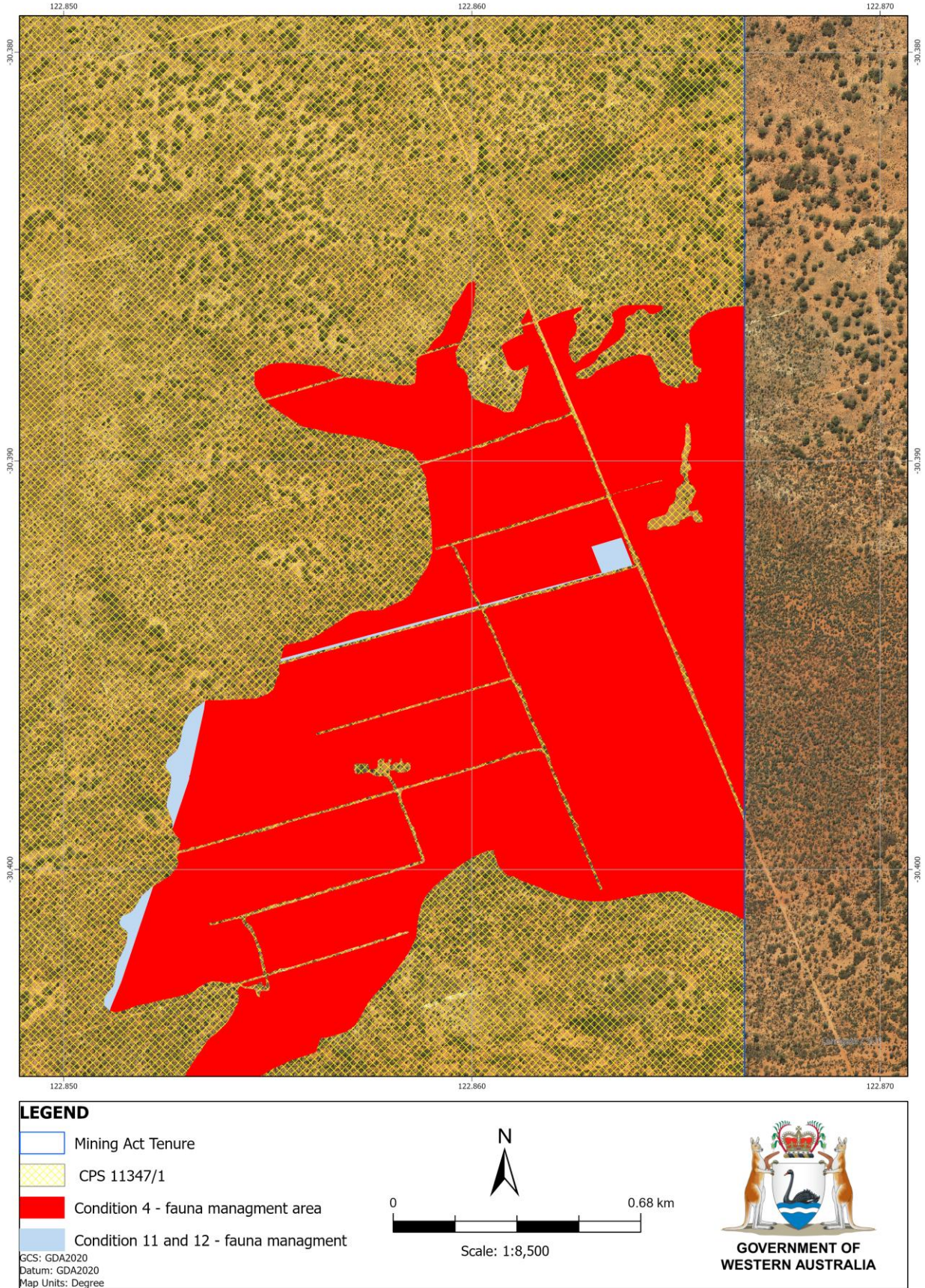
Figure 3: fauna management areas

Areas where conditions 11 and 12 apply to the area authorised to be cleared are shown in the map below (Figure 3).