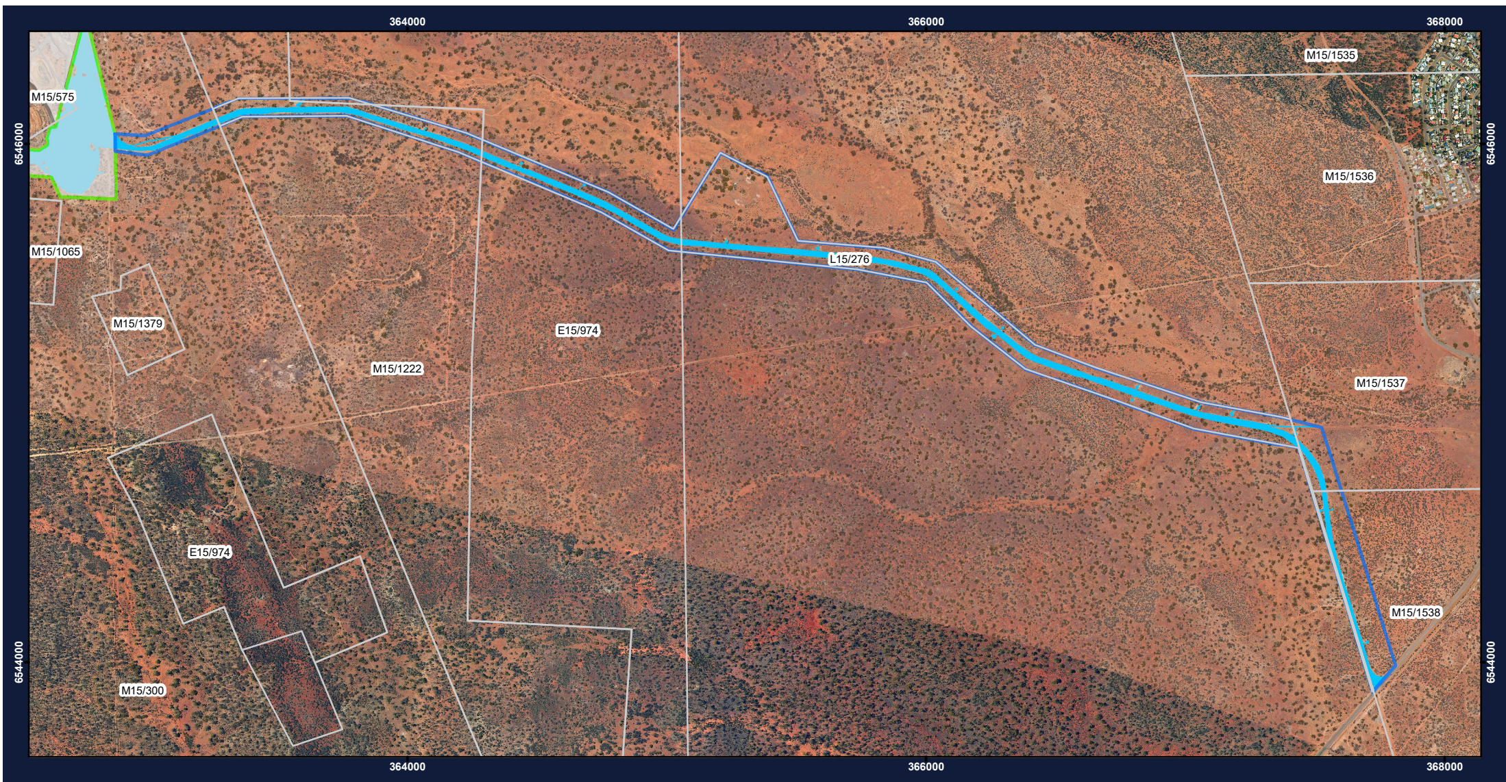
Figure 1. CPS 1519/5 Cave Rocks Haul Road cumulative clearing to date