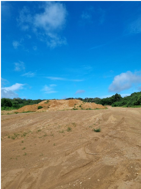
Waypoint 1824 – 7