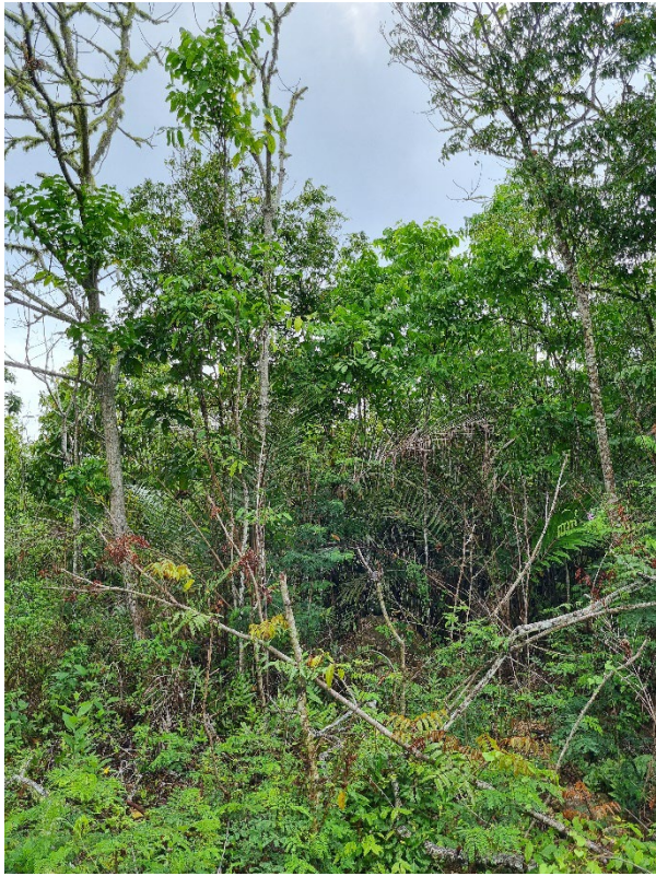
Waypoint 1797 – 5