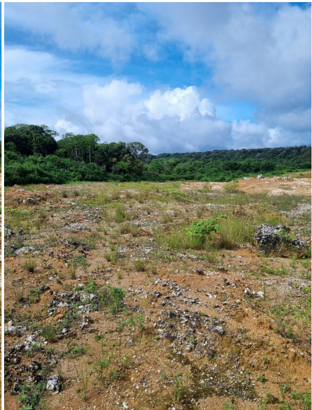
Waypoint 1821 – 7