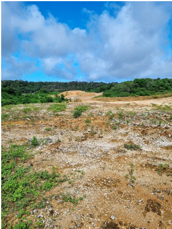
Waypoint 1820 – 7