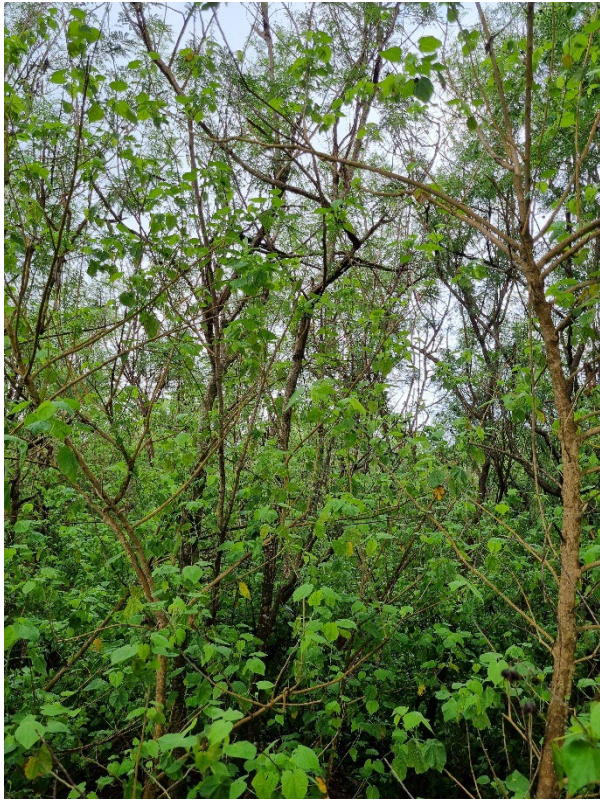
Waypoint 1801 – 5