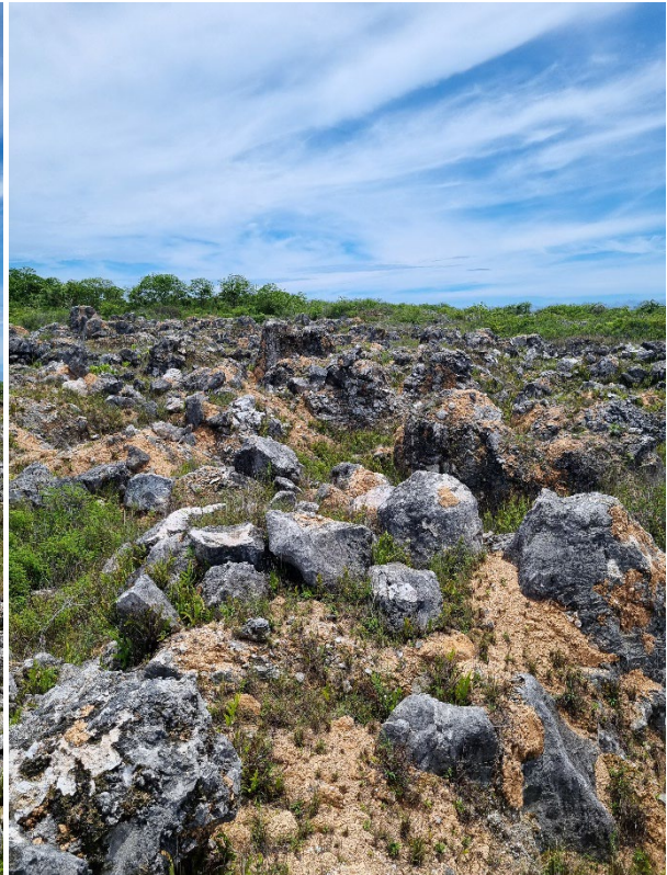
Waypoint 1806 - 6