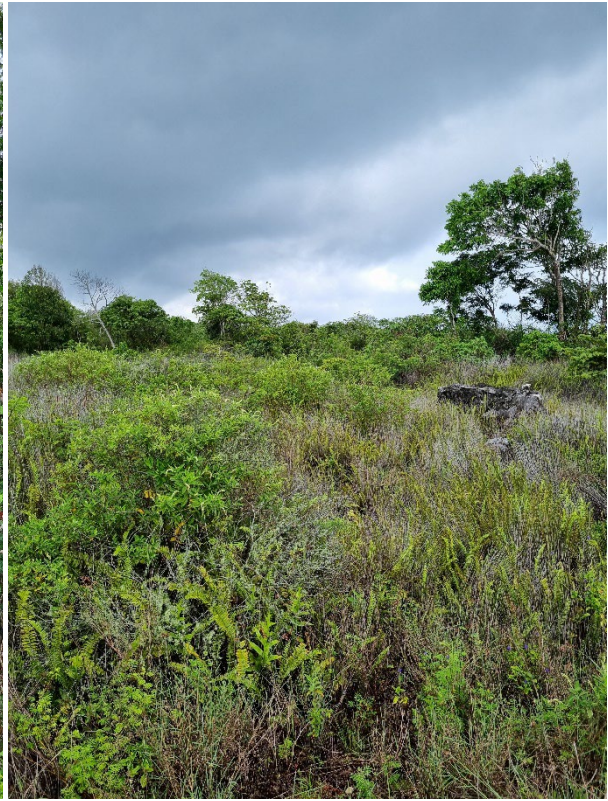
Waypoint 1798 - 6