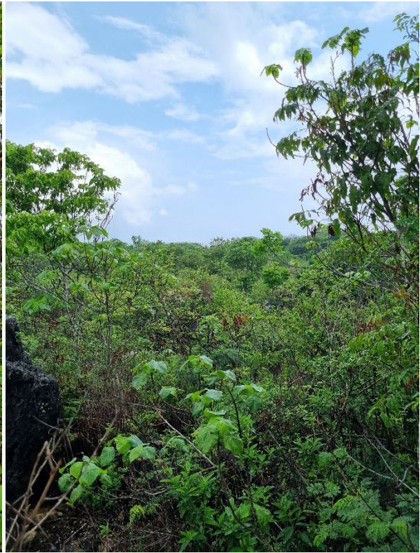
Waypoint 1802 – 5