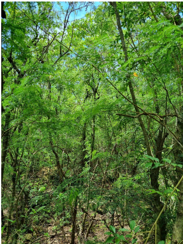
Waypoint 1803 – 5