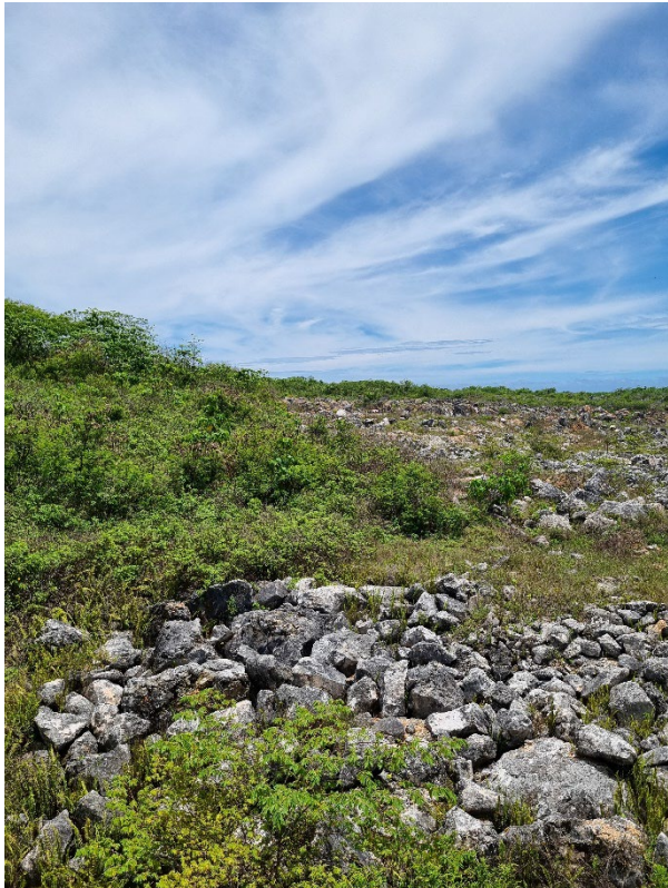
Waypoint 1805 - 6