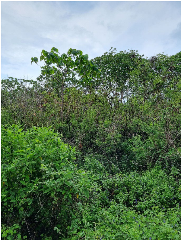
Waypoint 1799 – 5