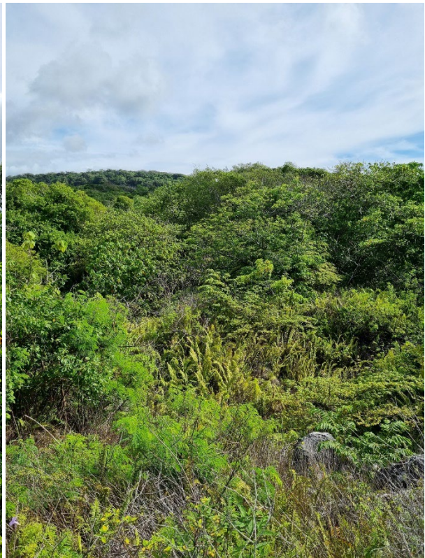
Waypoint 1811 – 4