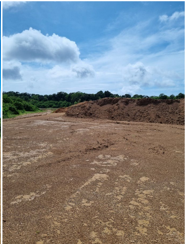
Waypoint 1825 – 7