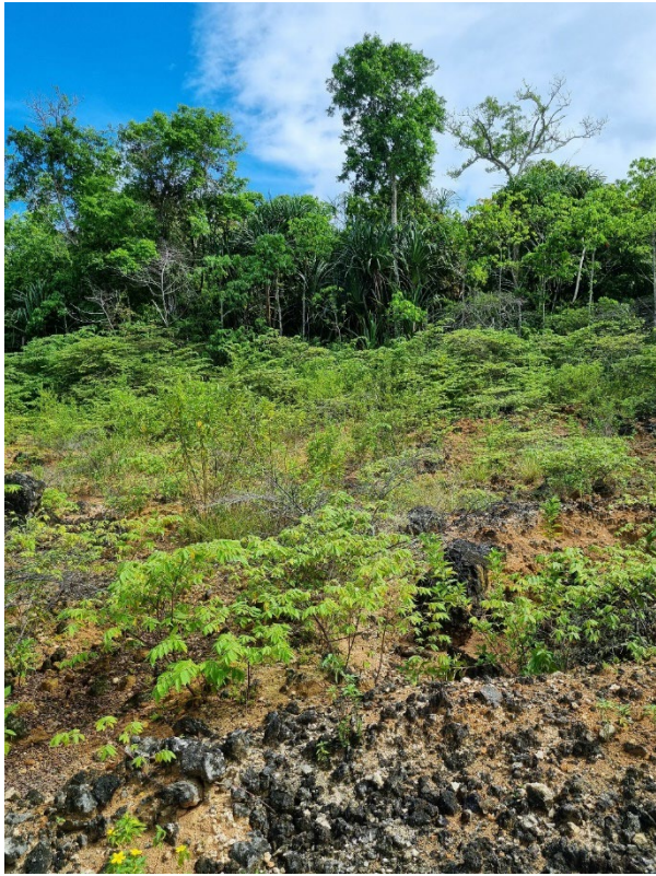
Waypoint 1822 – 7