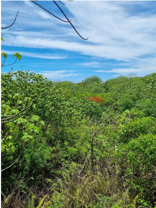
Waypoint 1809 – 5