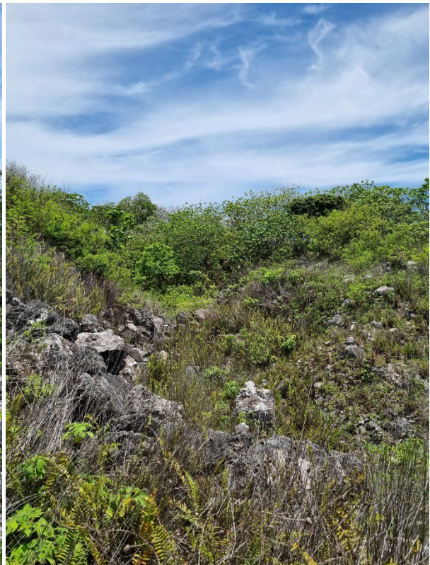
Waypoint 1808 - 5