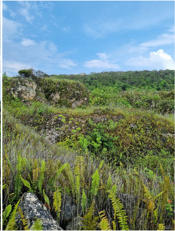
Waypoint 1795 - 6