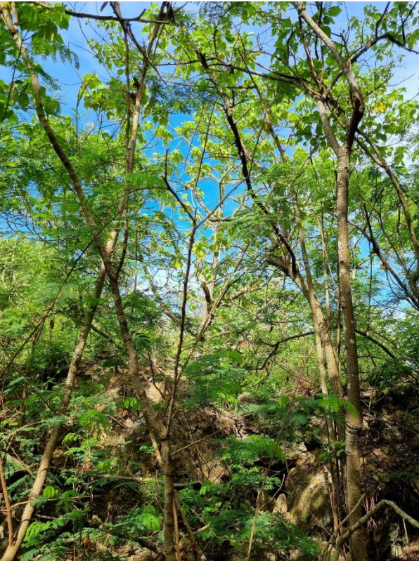
Waypoint 1812 - 5