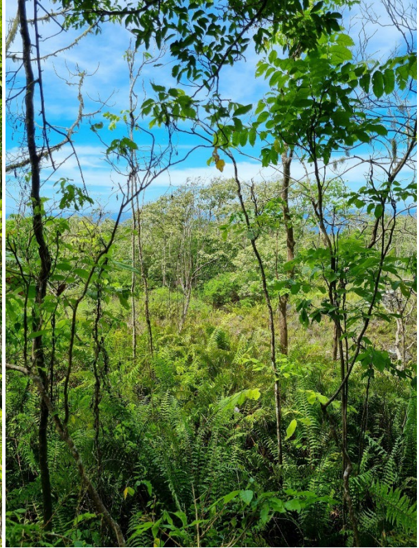
Waypoint 1816 - 5