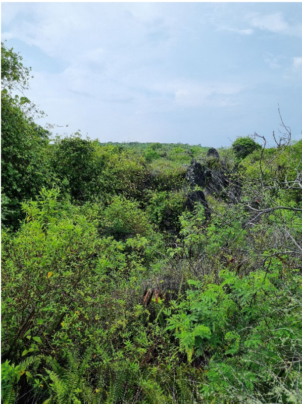
Waypoint 1796 - 6