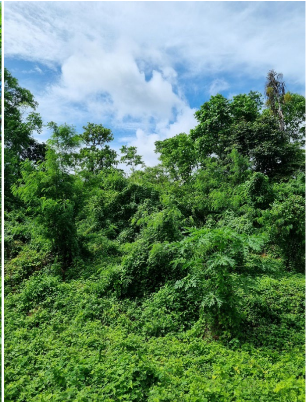
Waypoint 1827 - 5