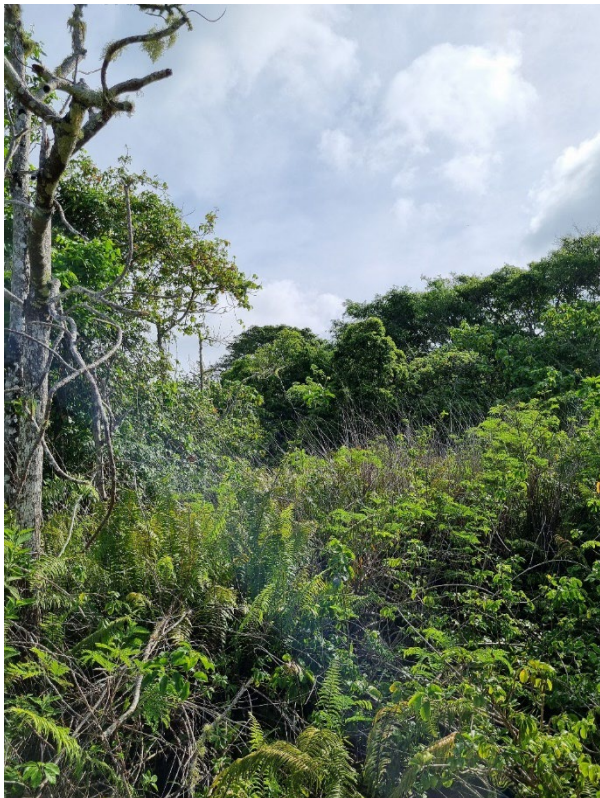
Waypoint 1810 – 5