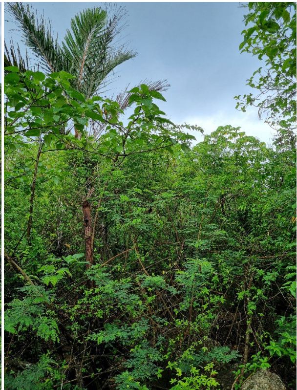
Waypoint 1800 – 6