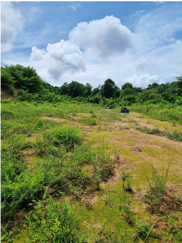
Waypoint 1828 - 7