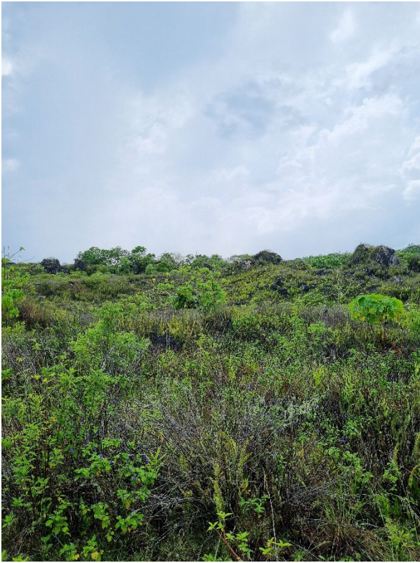
Waypoint 1794 – 6