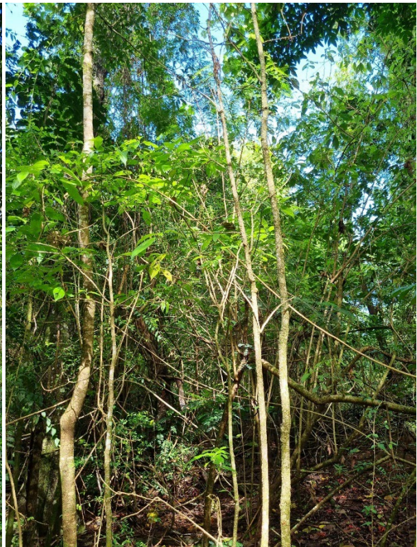
Waypoint 1818 - 4