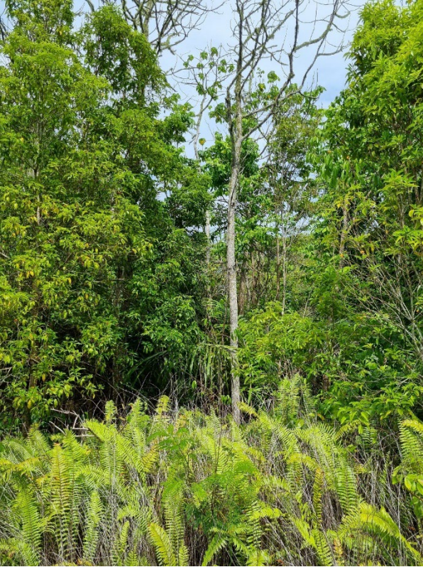
Waypoint 1815 - 4