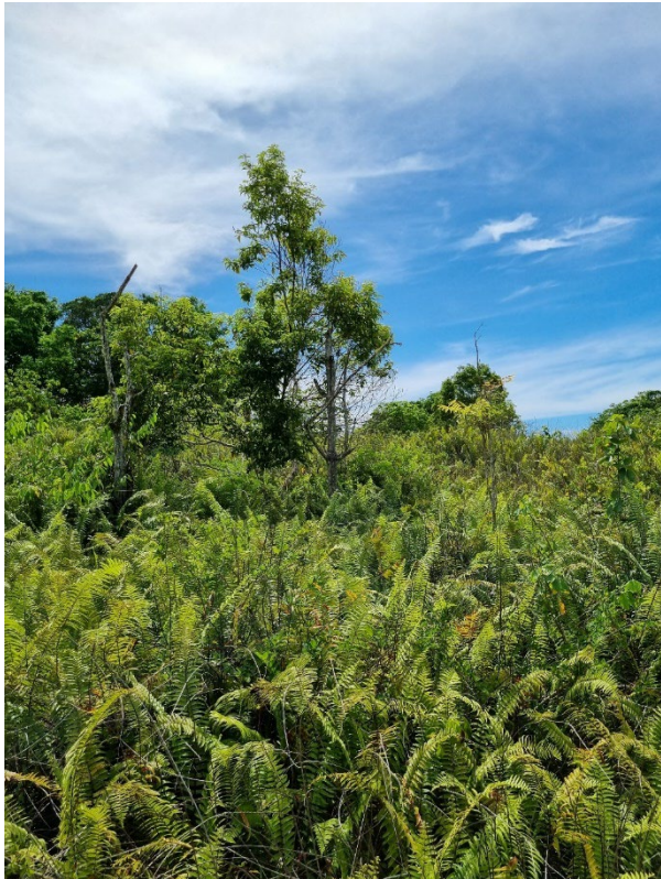
Waypoint 1814 - 5