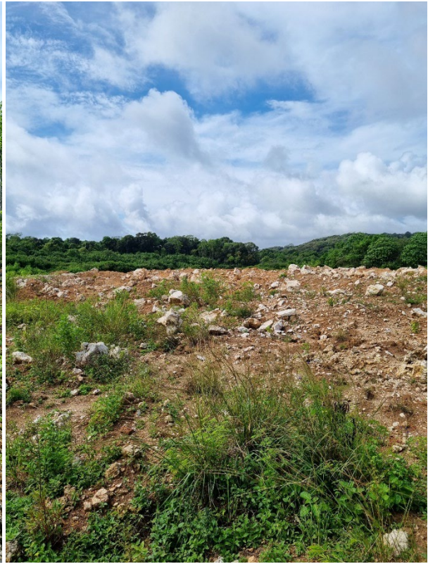
Waypoint 1823 – 7