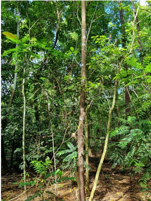
Waypoint 1819 – 3