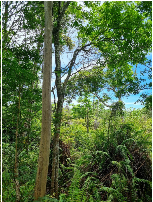
Waypoint 1804 - 5