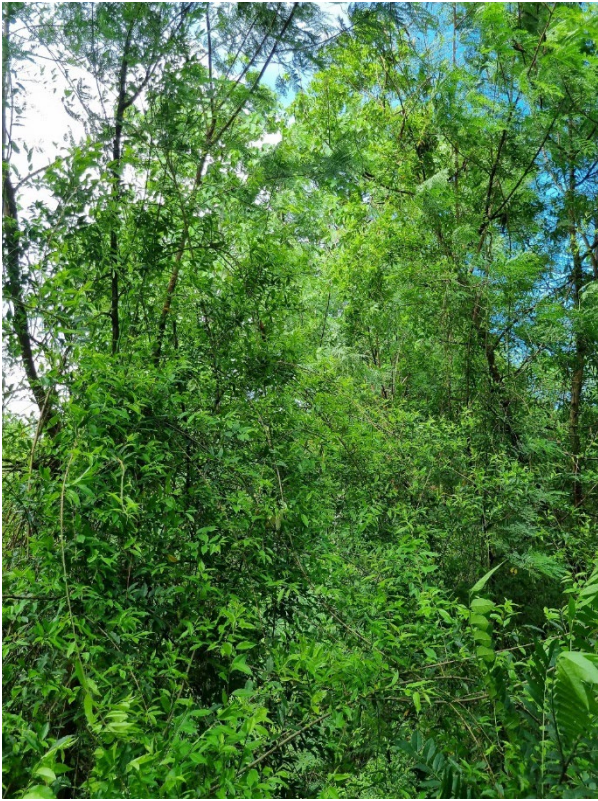
Waypoint 1826 - 5