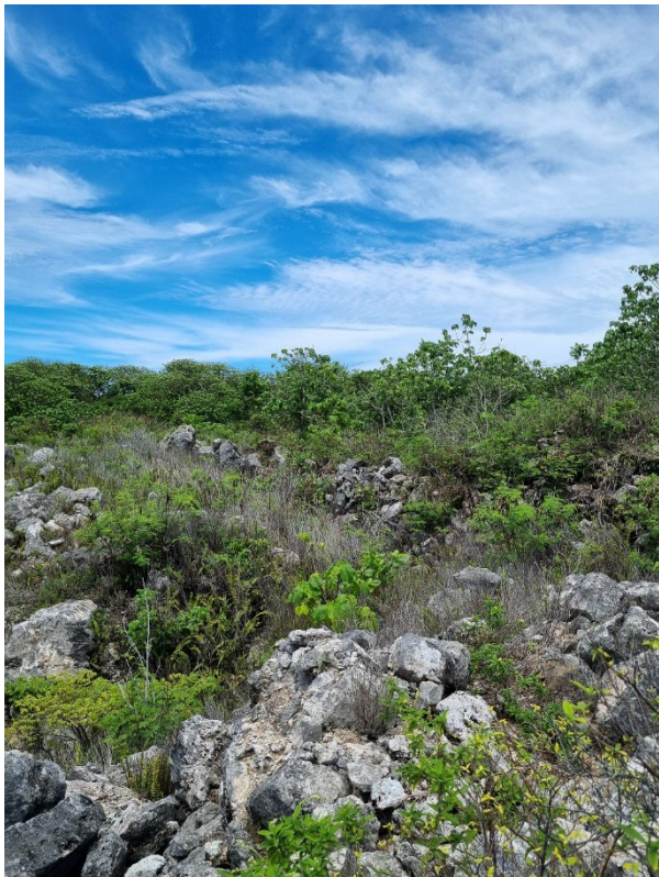
Waypoint 1807 - 5