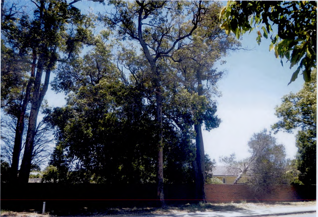
Corymbia calophylla (two) & Ficus rubiginosa