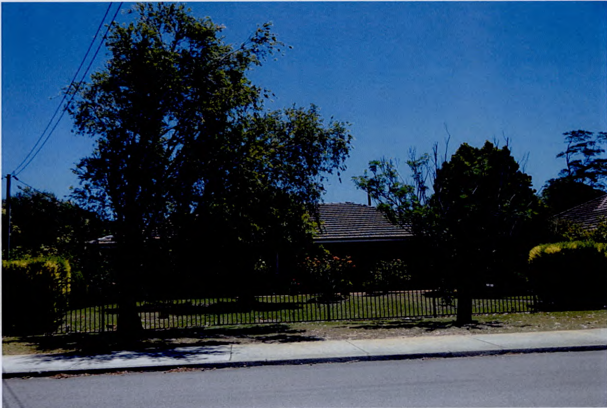
Cinnamomum camphora (two)