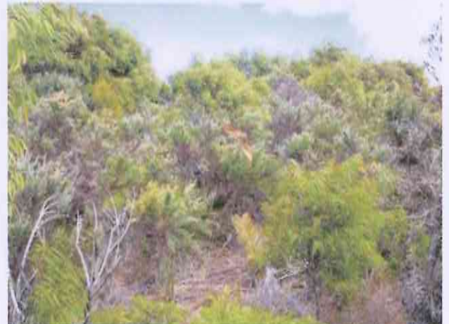
View of new access track on top of ridge