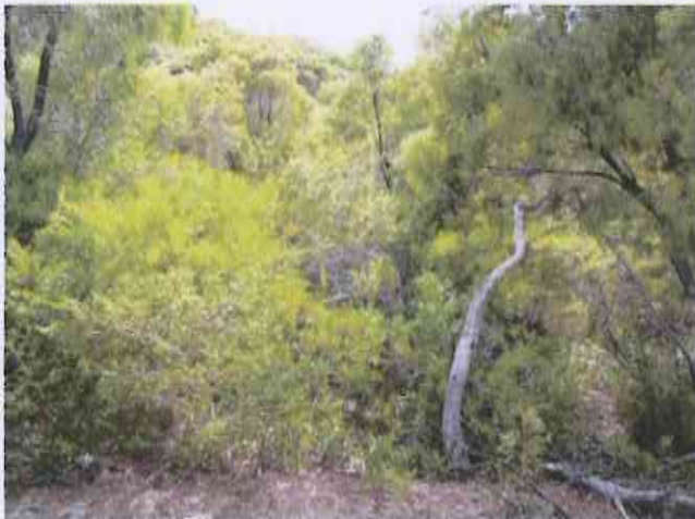
View of vegetation north west of existing track