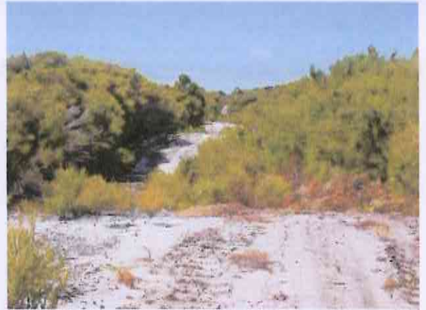
View of existing firebreak along eastern boundary