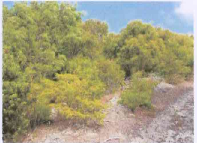
View of vegetation south of existing track