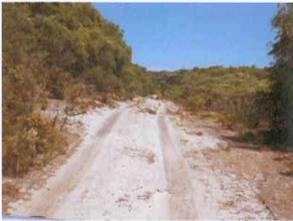
View of existing track in northern portion of property