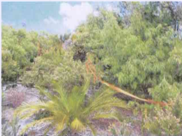
View of proposed new access track from eastern firebreak