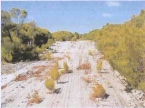
View of existing firebreak along eastern boundary