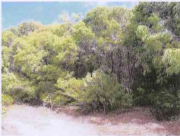
View of vegetation at proposed limestone pit