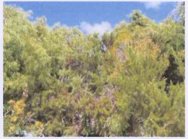
View of proposed new access track from eastern firebreak