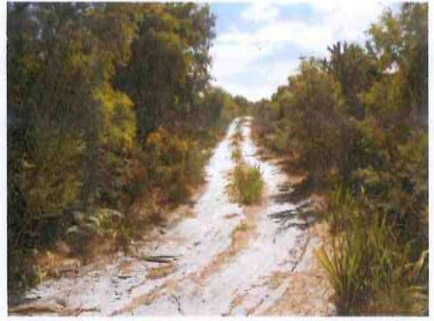
View of existing track in northern portion of property