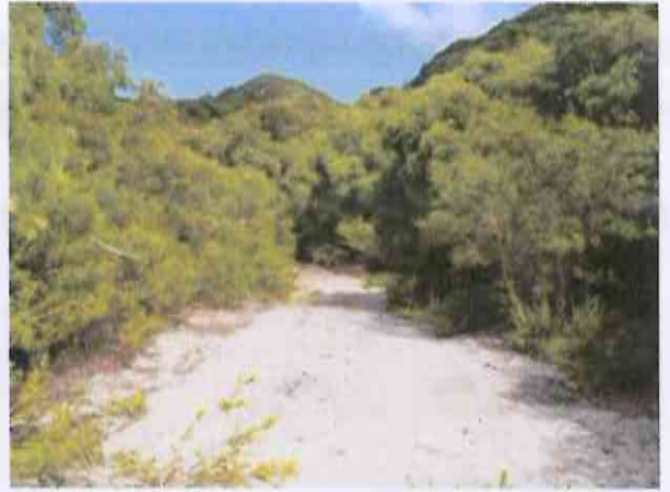
View of existing track into proposed limestone pit