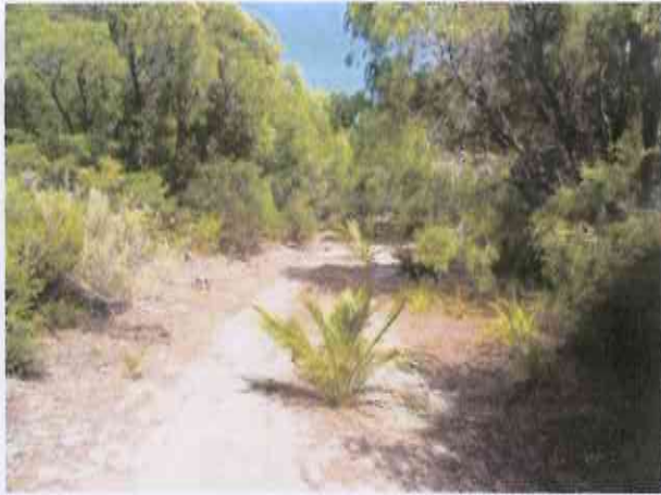
View of existing track into proposed limestone pit