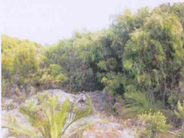
View of new access track on top of ridge