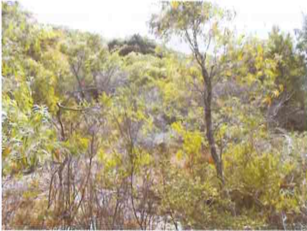
View of vegetation north of existing track