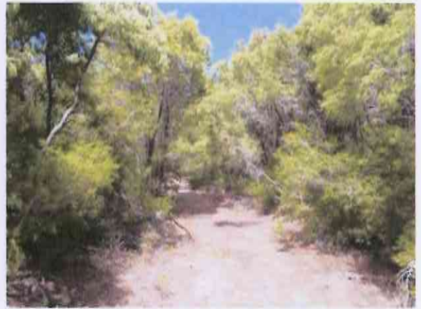
View of existing track through proposed limestone pit