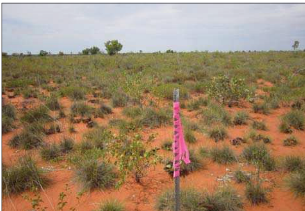
Pivot 5 looking south