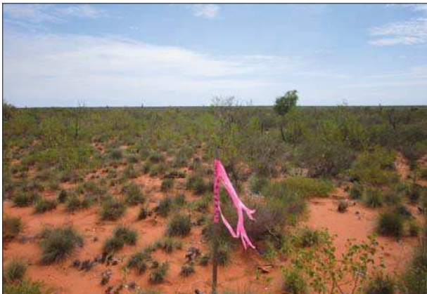
Pivot 5 looking north