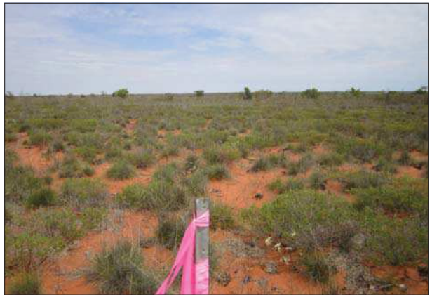
Pivot 4 looking west