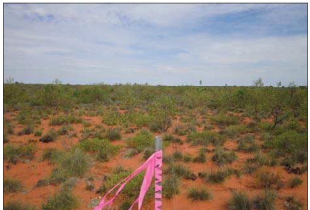
Pivot 5 looking west