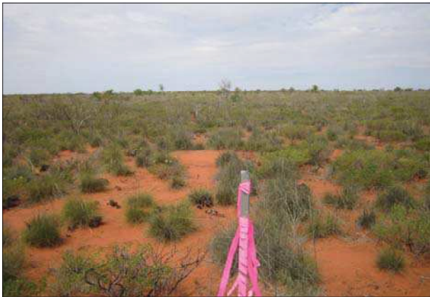
Pivot 4 looking south