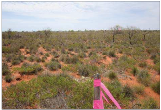
Pivot 4 looking east