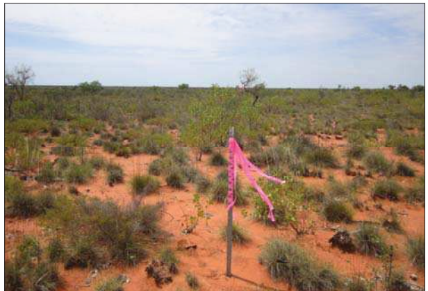
Pivot 5 looking east