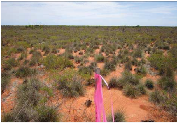
Pivot 4 looking north