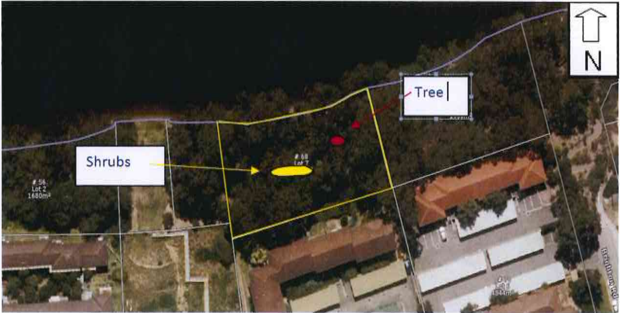
Figure 2. Location of tree and up to 5 shrubs to be cleared from Lot 7 (68) Riversdale Rd, Rivervale