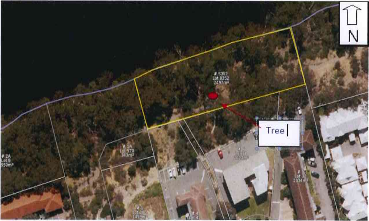
Thanks. Figure 3. Location of tree to be cleared from Lot 8352 (5352) Brighton Road, Rivervale