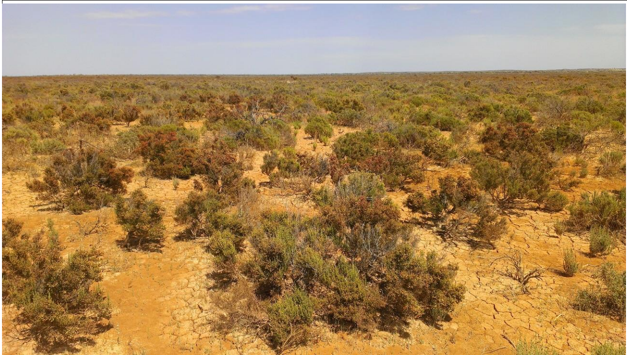
Plate 4. Major riverine plains with active lower floodplains flanking channelled watercourses; supports mixed acacia shrublands, low woodlands with minor perennial grasses and areas halophytic shrublands. The Murchison and Roderick River floodplains.