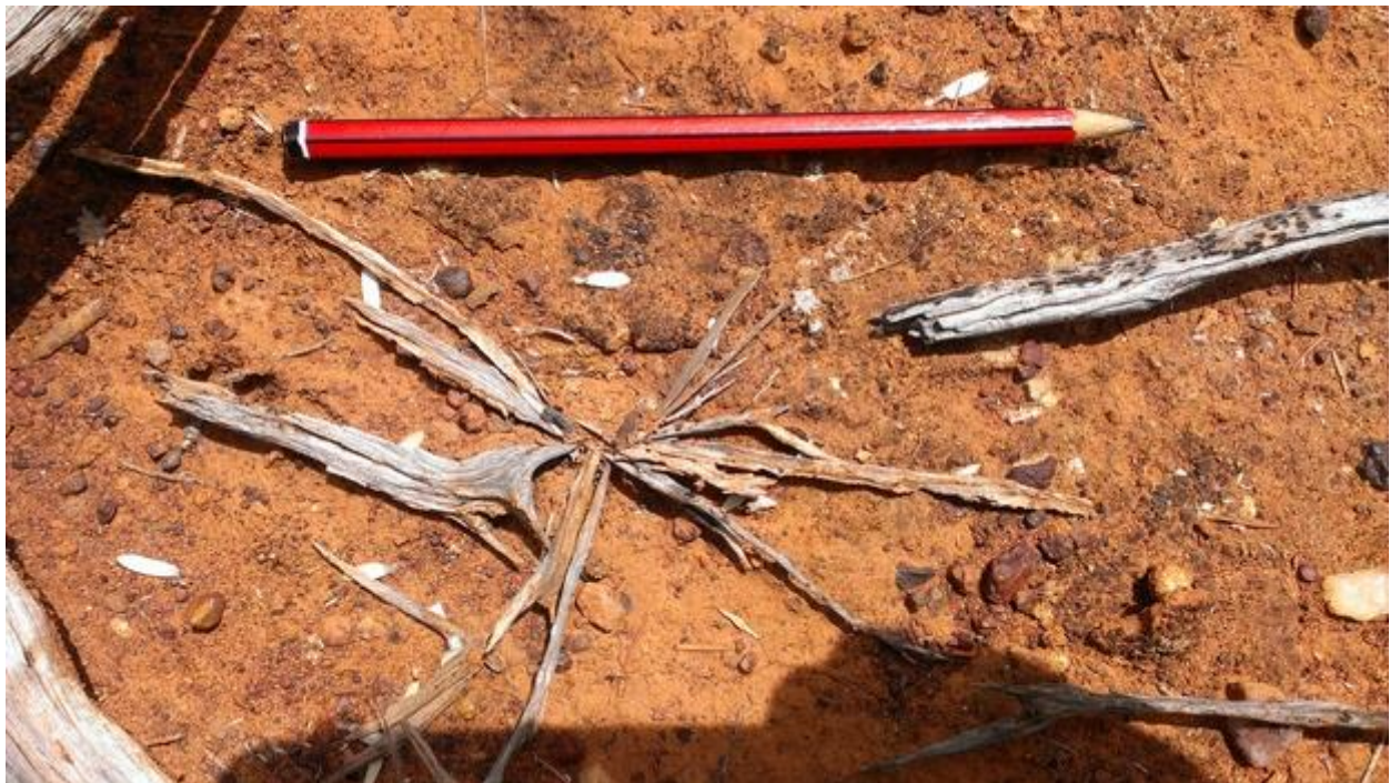
Figure 5. Shield-backed Trapdoor Spider burrow recorded near Borrow Pit 1.