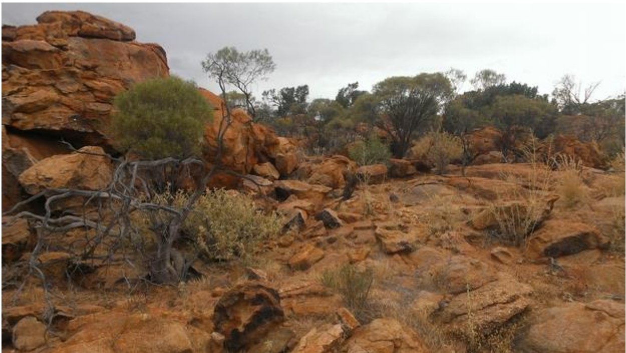
Figure 4. Egernia stokesii habitat recorded during the survey.