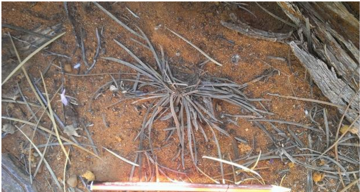
Figure 6. Shield-backed Trapdoor Spider burrow in Borrow Pit 3.