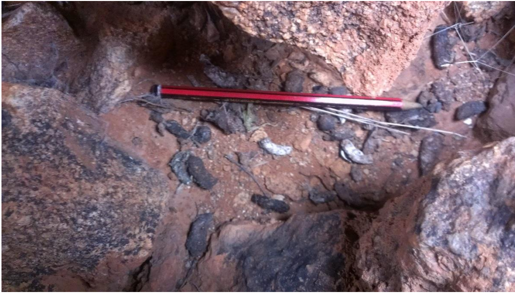
Figure 3. Egernia stokesii scat piles recorded during the survey.