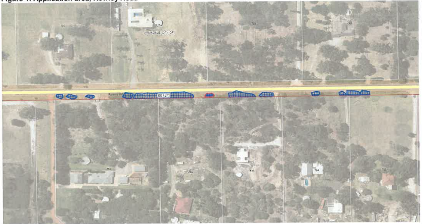
Figure 1: Application area, Rowley Road