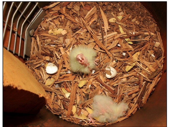
Bottom of an artificial hollow showing ladder that is fixed to the wall and a chewed sacrificial post which is 200 mm from the floor.

It is recommended that at least two posts are provided. Posts 70 x 50 mm have been used, but require replacing at least every second breeding season when the nest is active. Birds do vary in their chewing habits and therefore the frequency at which the chewing posts require replacement will also vary.