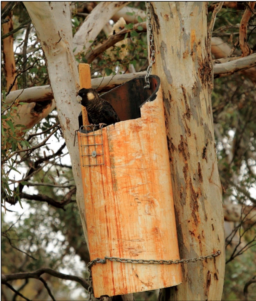
Carnaby's cockatoo female prospecting an artificial hollow.