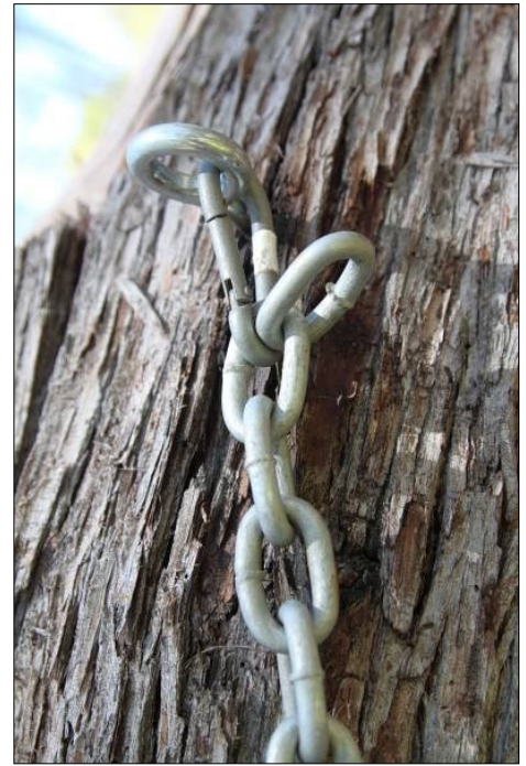
Example fixing for artificial hollow