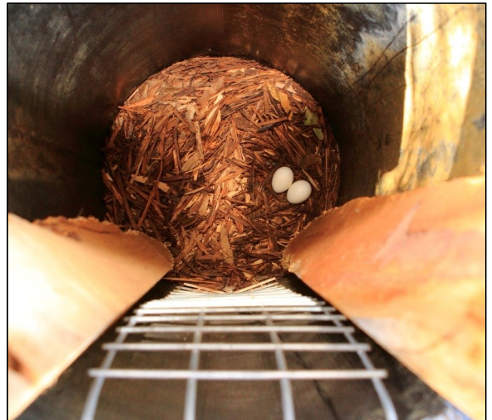
Carnaby's cockatoo eggs in an artificial hollow.

Example materials that could be used for artificial hollow bases include heavy duty stainless steel, galvanised or treated metal (e.g. Zinalume ®), thick hardwood timber slab or marine ply (not chipboard or MDF). The base material must be cut to size to fit internally with sharp or rough edges ground away or curled inwards and fixed securely to the walls.