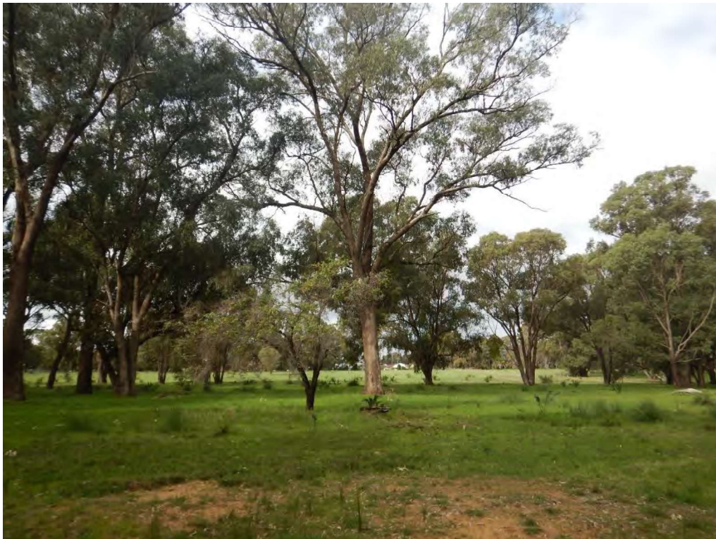
Plate 2. Tuart/Jarraah Woodland in the north-western part of the study area. Photo taken 26 July 2018.