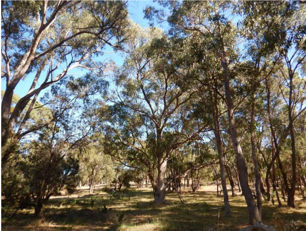
Plate 1. Tuart/Jarraah Woodland in the north-western portion of the study area. Photo taken 9 May 2018.