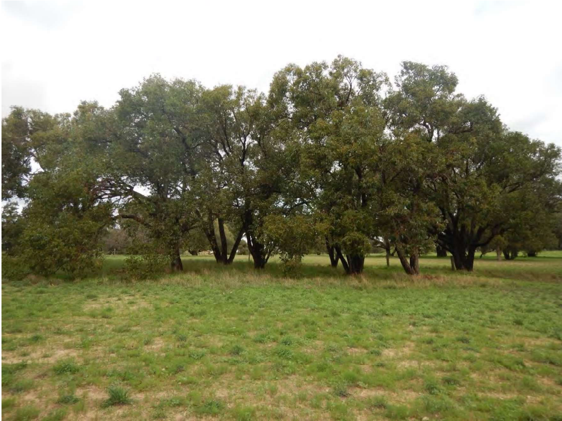
Plate 3. Stand of Jarrah trees within the area mapped as Parkland Cleared within the centre of the study area. Photo taken 26 July 2018.