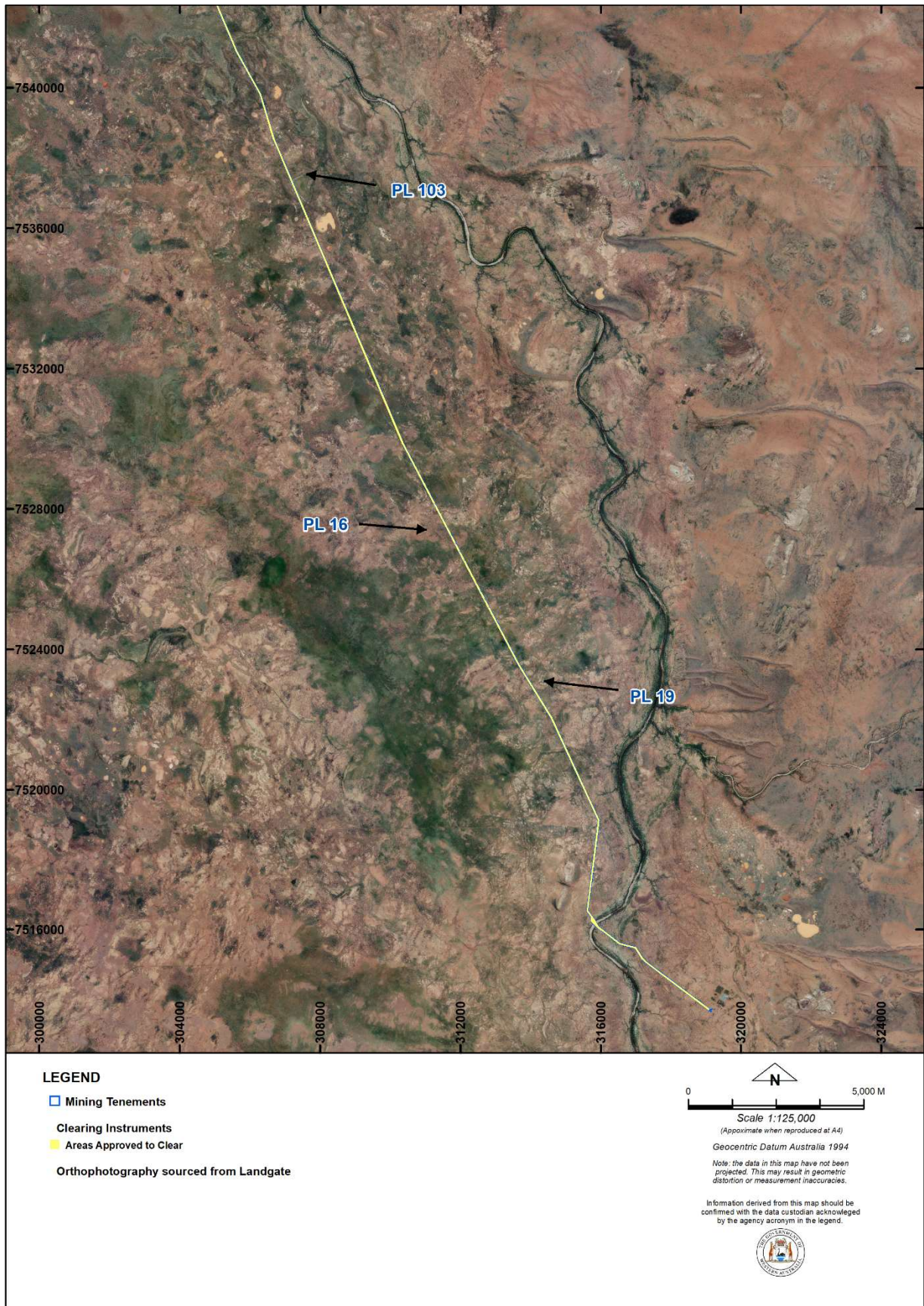
Figure 3: Map of the boundary of the area within which clearing may occur