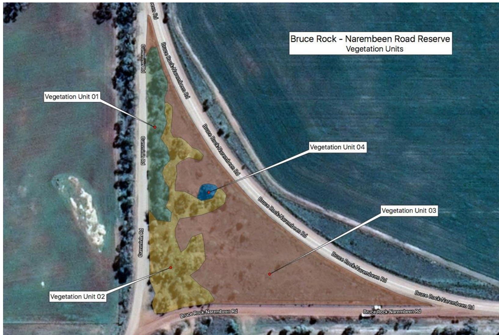
Figure 6: The Bruce Rock – Narembeen Rd Reserve showing the areas covered by each of the four identified Vegetation Units