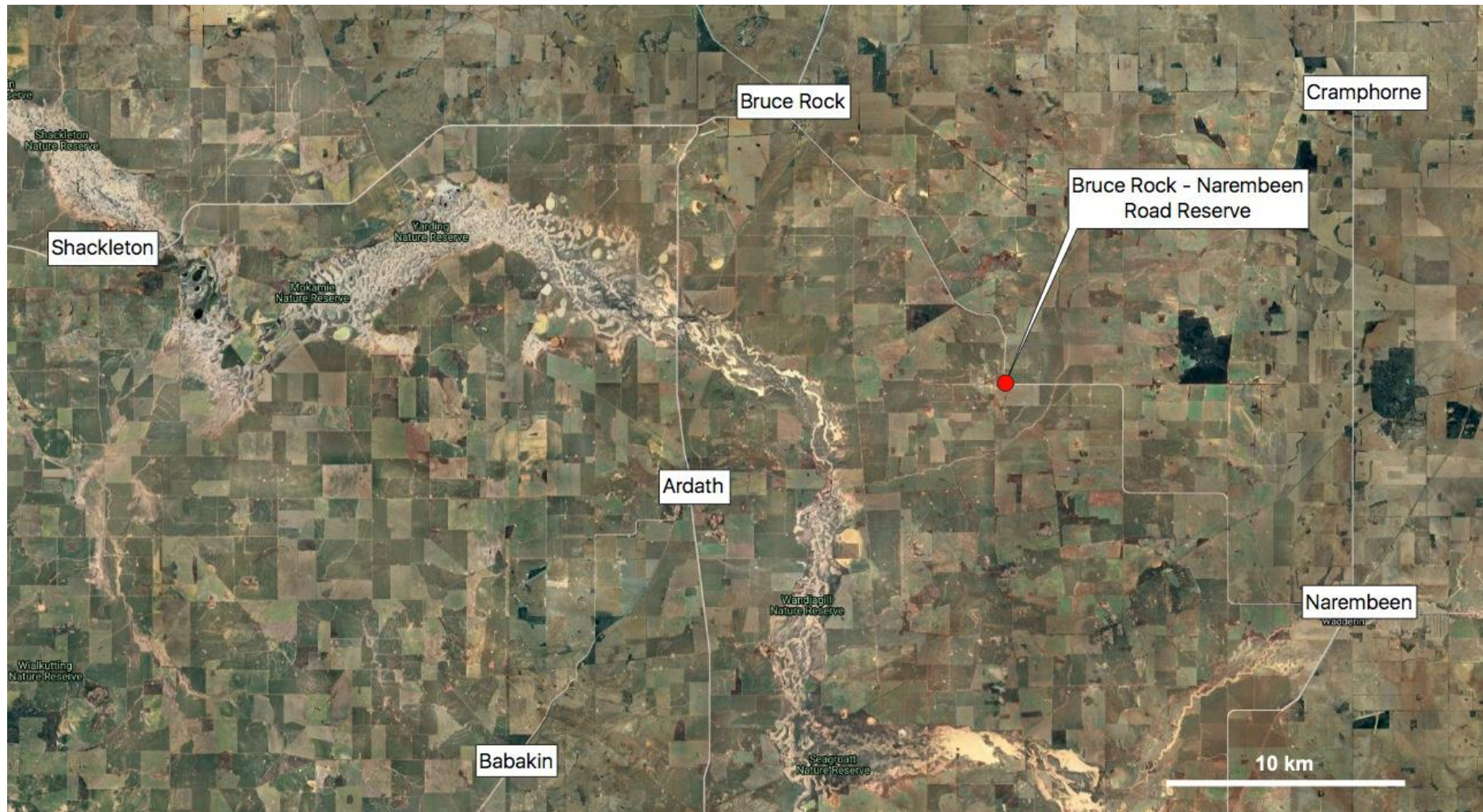
Figure 2: Location of the Bruce Rock Naremben Road Reserve in regional context showing nearby towns, the Seagroatt Nature Reserve and larger patches of remnant vegetation. The town of Bruce Rock is located 16.2 km to the north east of the reserve and the town of Naremben is 23.3 km to the south west (Base image source: Google Satellite).