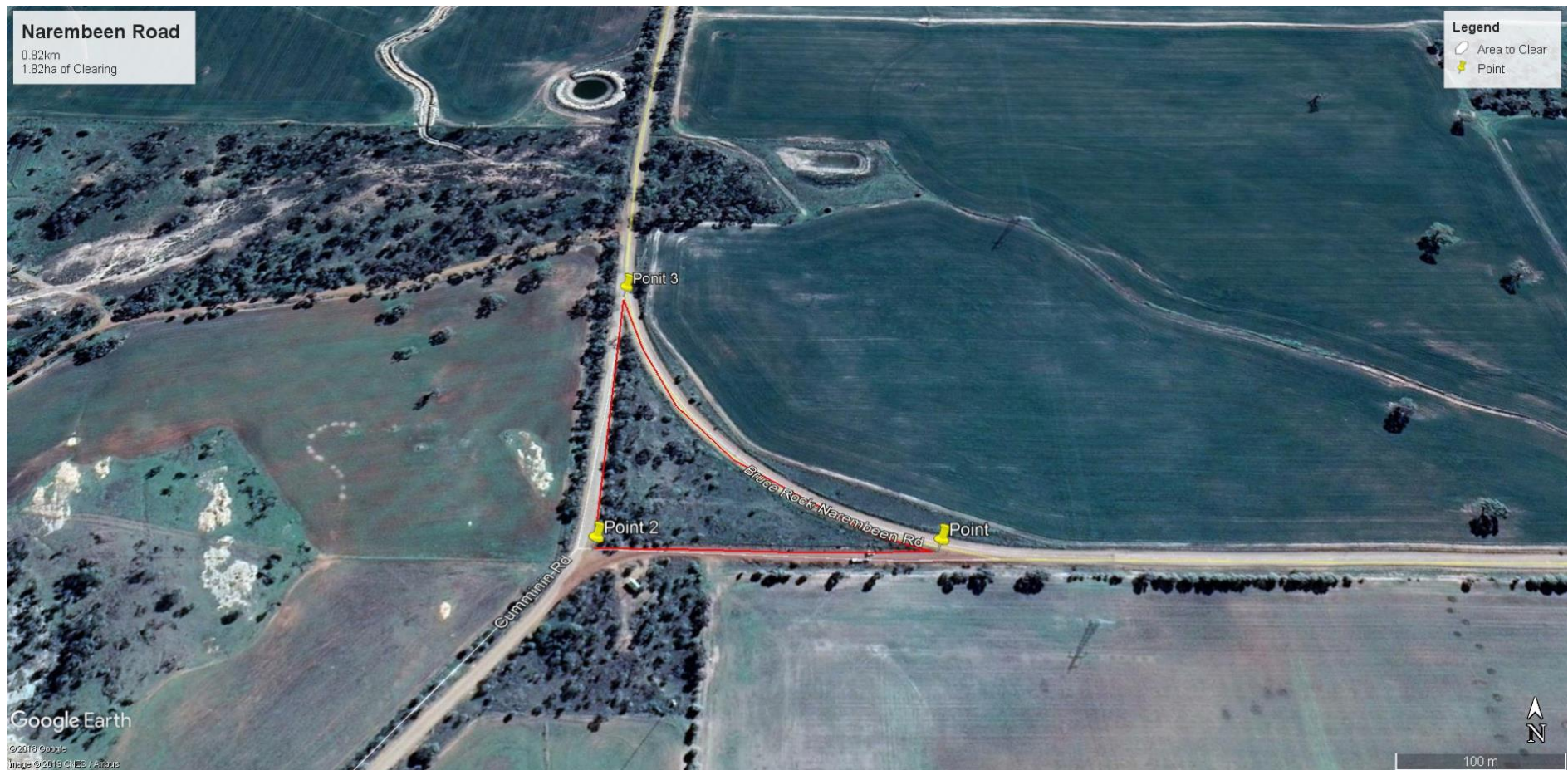
Figure 4: Bruce Rock – Narembeen Road reserve showing the area (bounded by red) that the Shire requested be surveyed for this proposal. Map provided by the Shire of Bruce Rock (Base image source: Google Earth).