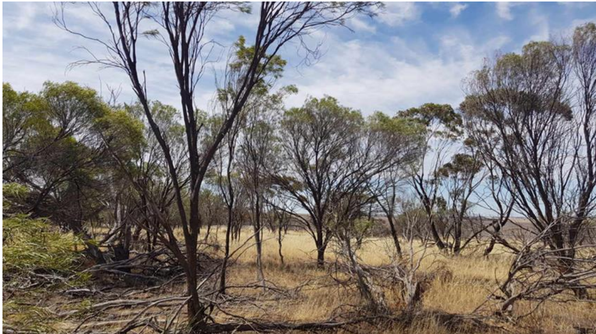
Figure 8: Vegetation Unit 2 ( Eucalyptus / Acacia Open Low Woodland) showing the characteristic open Acacia woodland with occasional York Gum ( Eucalyptus loxophleba subsp. loxophleba ) emergents and the ground stratum heavily infested with Wild Oats ( Avena fatua ). This Vegetation Unit is very similar to Vegetation Unit 1, the main difference being the number of York Gum emergents. There were also some differences in mid-stratum and ground stratum species..

species diversity (Figure 8). As with Vegetation Unit 1, there is scope for regeneration but intensive and ongoing weed management and biodiversity plantings would be required to achieve a state approaching Good condition.