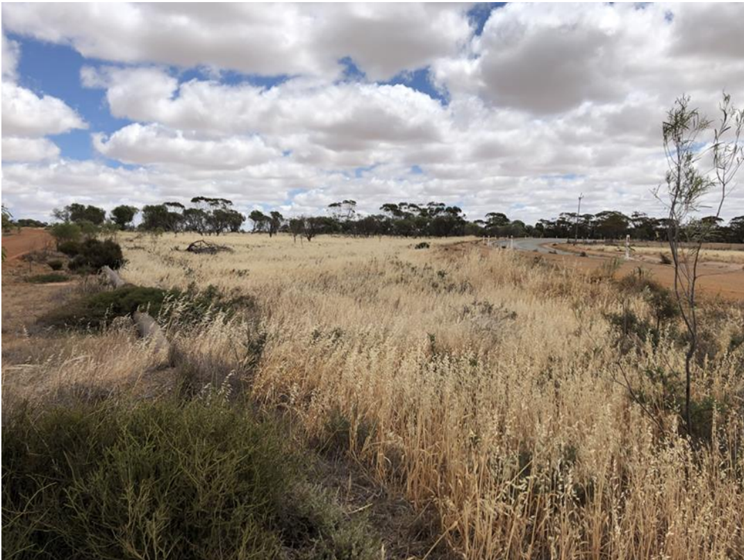
Figure 10: The increased vegetation diversity in Vegetation Unit 3 along the water pipeline showing Exocarpos aphyllus and Acacia acanthaster as well as the generally greener vegetation where leakage from the water pipe is creating a moister environment.