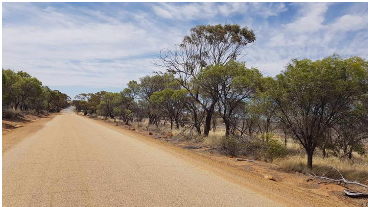
Figure 7: Vegetation Unit 1 ( Eucalyptus / Acacia Open Low Woodland) on the right hand side of the road) showing the mix of Eucalyptus loxophleba subsp. loxophleba and Acacia acuminata and the dense Wild Oats ( Avena fatua ) in the understorey. The vegetation on the left hand side of the road is part of a potential vegetation corridor that will not be impacted by the road realignment.

Vegetation Unit 1 ( Eucalyptus / Acacia Open Low Woodland) occupies an area of 0.27 hectares in a strip along the north western edge of the patch adjacent to Cumminin Road (Figure 7). It was assessed as Degraded as the basic vegetation structure was severely impacted by weed species, particularly Wild Oat Avena fatua , that almost completely replaced the native ground stratum (G) and the mid-stratum (M) had reduced species diversity. There is scope for regeneration but intensive and ongoing weed management and biodiversity plantings would be required to achieve a state approaching Good condition. The potential for regeneration is further limited by the fact that the reserve is surrounded by agricultural land and the adjacent vegetation unit (Unit 3) within the reserve is Completely Degraded being even more heavily impacted by weed species that would require very intensive management to prevent continual reinvasion of the site.