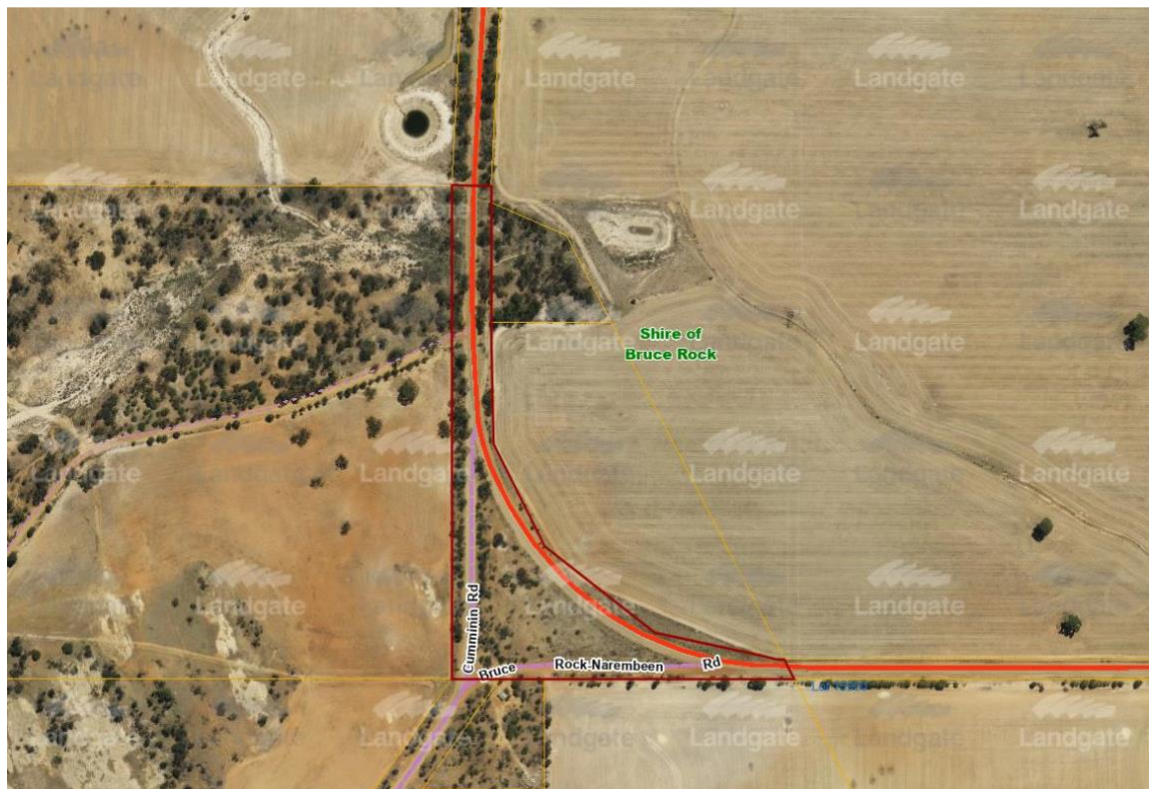
Figure 1: The Bruce Rock – Narembreen Rd Reserve provided by the Shire of Bruce Rock with the boundaries of the Reserve marked in dark red. The road labelling is from Landgate and the road labelled “Bruce Rock Narembreen Rd” is the road that is locally known as an unnamed slip road, with the Bruce Rock – Narembreen Road continuing round the curve and to the north (Map source Landgate November 20, 2020, provided by Shire of Bruce Rock).

The Bruce Rock – Narembreen Road reserve (PIN 11650235, Land ID 3677894) is a 4.549 ha roughly triangular shaped reserve bounded by the Bruce Rock – Narembreen Road to the east, Cumminin Road to the west and an unnamed slip road to the south of the reserve that connects the Bruce Rock – Narembreen Road with Cumminin Road (Figure 1).