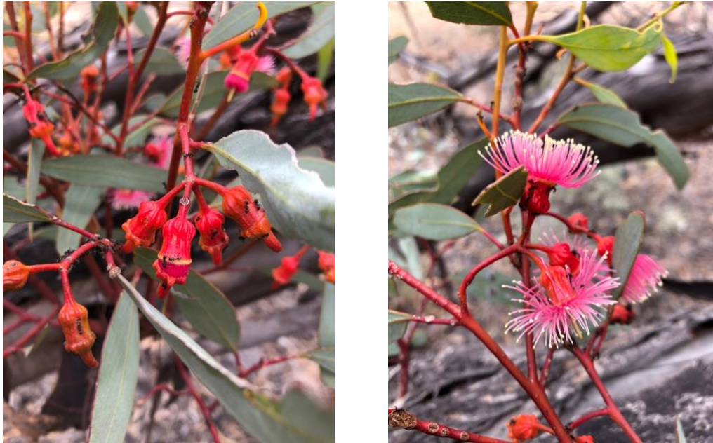
Figure 11: Left - Coral gum ( Eucalyptus torquata ) flowers just prior to opening and beginning to open with the operculum still in place Right - Coral gum ( Eucalyptus torquata ) flowers fully open.

Vegetation Unit 4 is a small patch of 0.022 hectares surrounding a single, old Eucalyptus torquata (Figure 11). This species is out of range for the area, occurring naturally in one patch south of Kalgoorlie and entirely within the Eremaean Province (Western Australian Herbarium, 1998) suggesting that it may have been planted at some unknown time in the 20 th century.