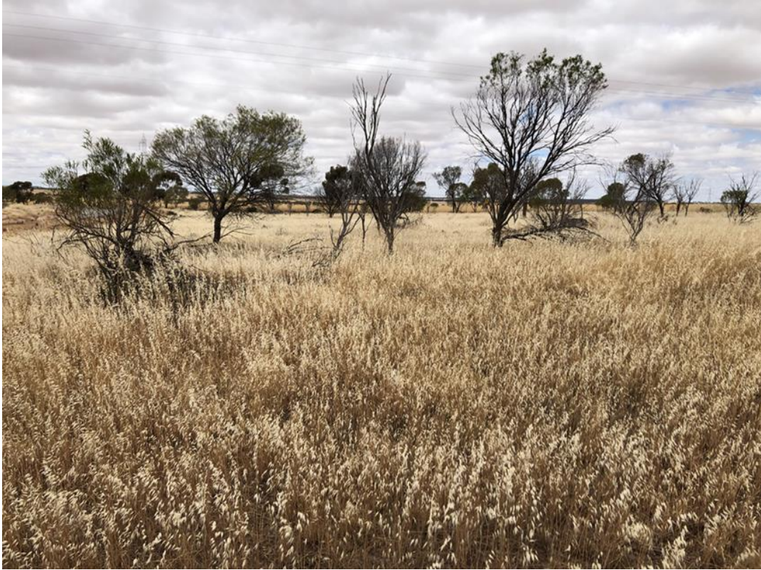
Figure 9: Vegetation Unit 3 (Open Acacia Scrub) at the Bruce Rock – Narembeen Road reserve showing the dominance of Wild Oat ( Avena fatua ) and scattered Acacias.