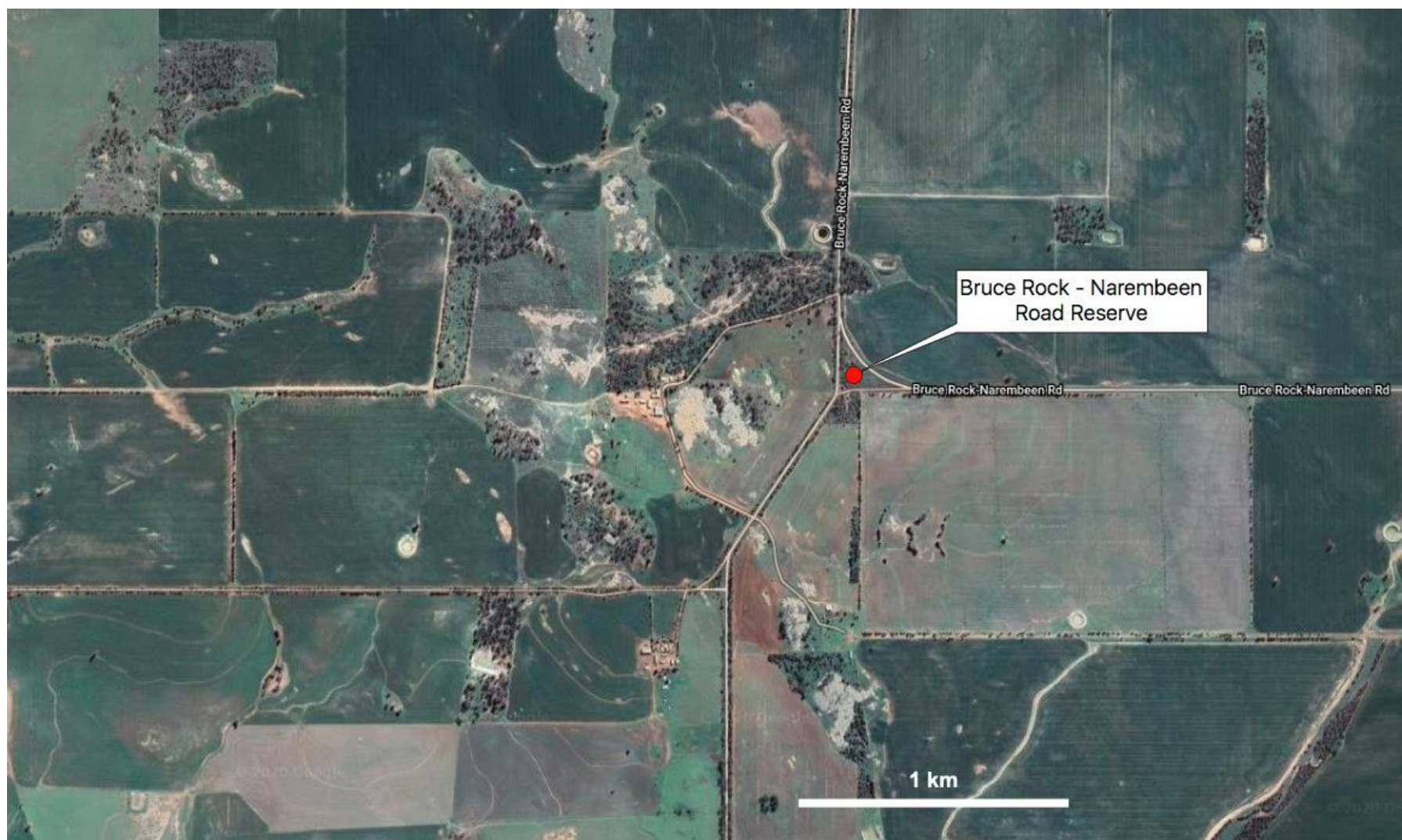
Figure 3: Location of the Bruce Rock-Narembeen Road Reserve in local context showing nearby patches of remnant vegetation