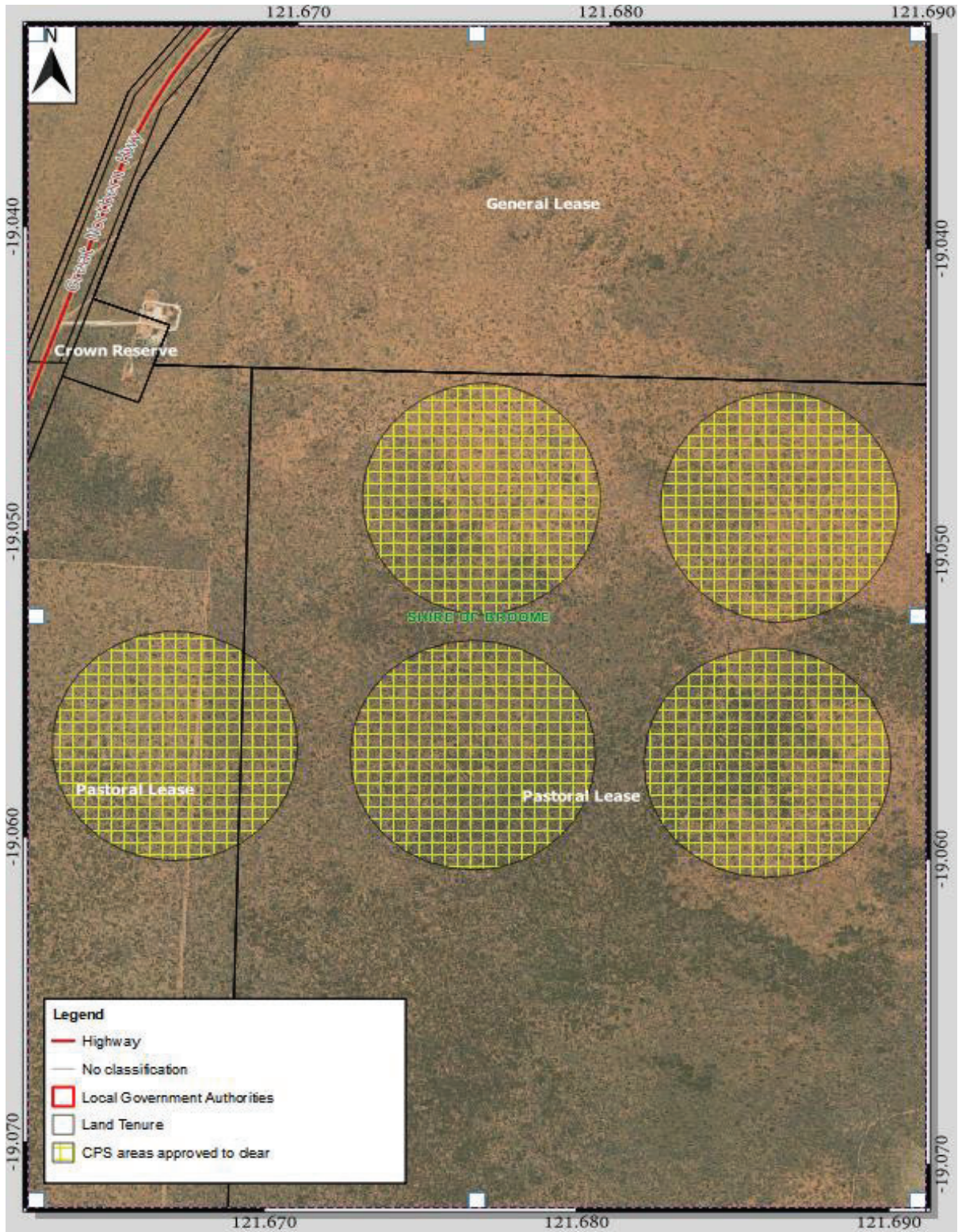
Figure 1: Boundary of the areas (cross-hatched yellow) within which clearing may occur.

The boundary of the areas authorised to be cleared are shown cross-hatched yellow in the map below (Figure 1).