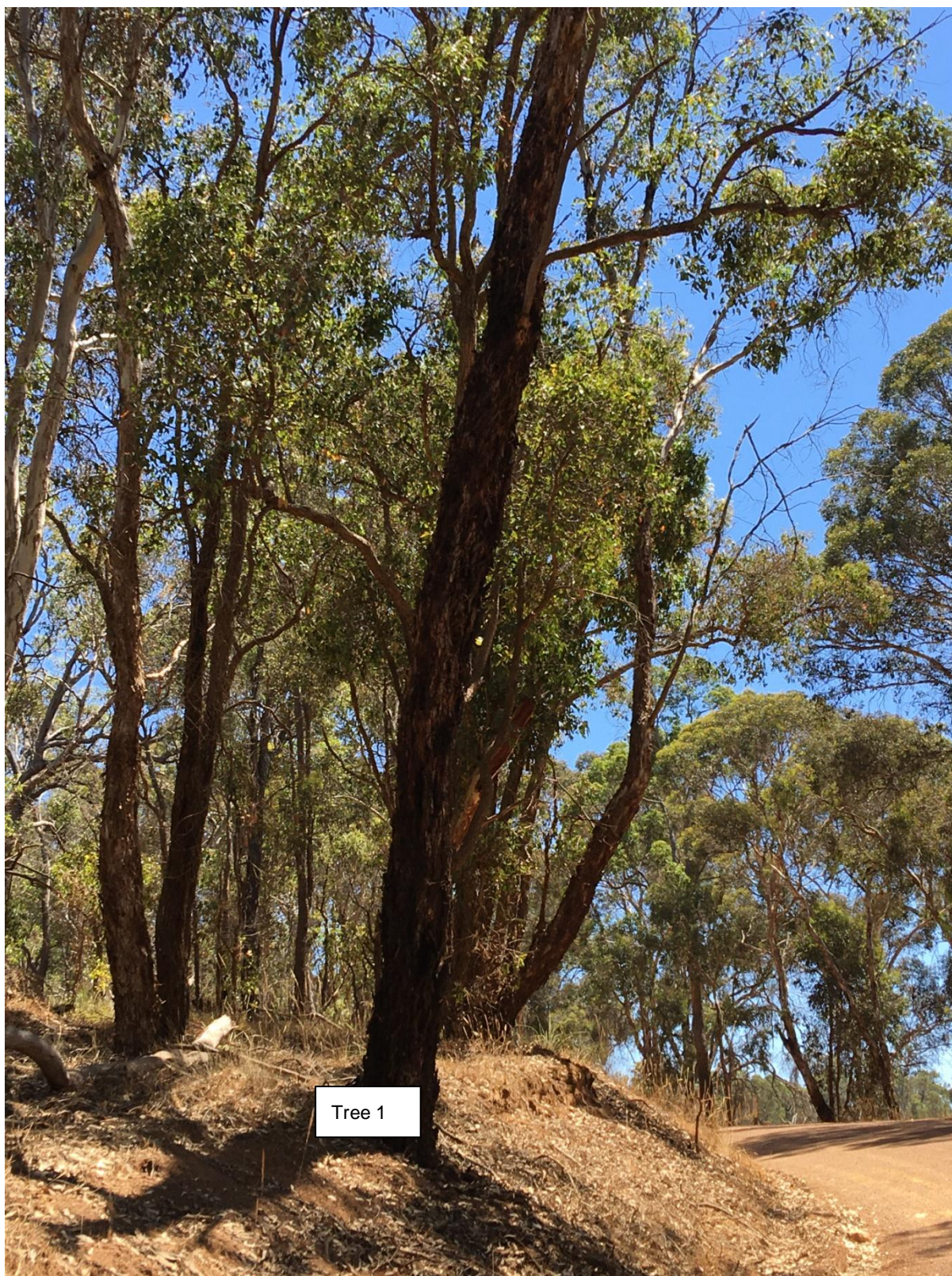
Tree No 1. Right on the edge of the steep bank that needs to be removed including some of the bank to widen the corner.