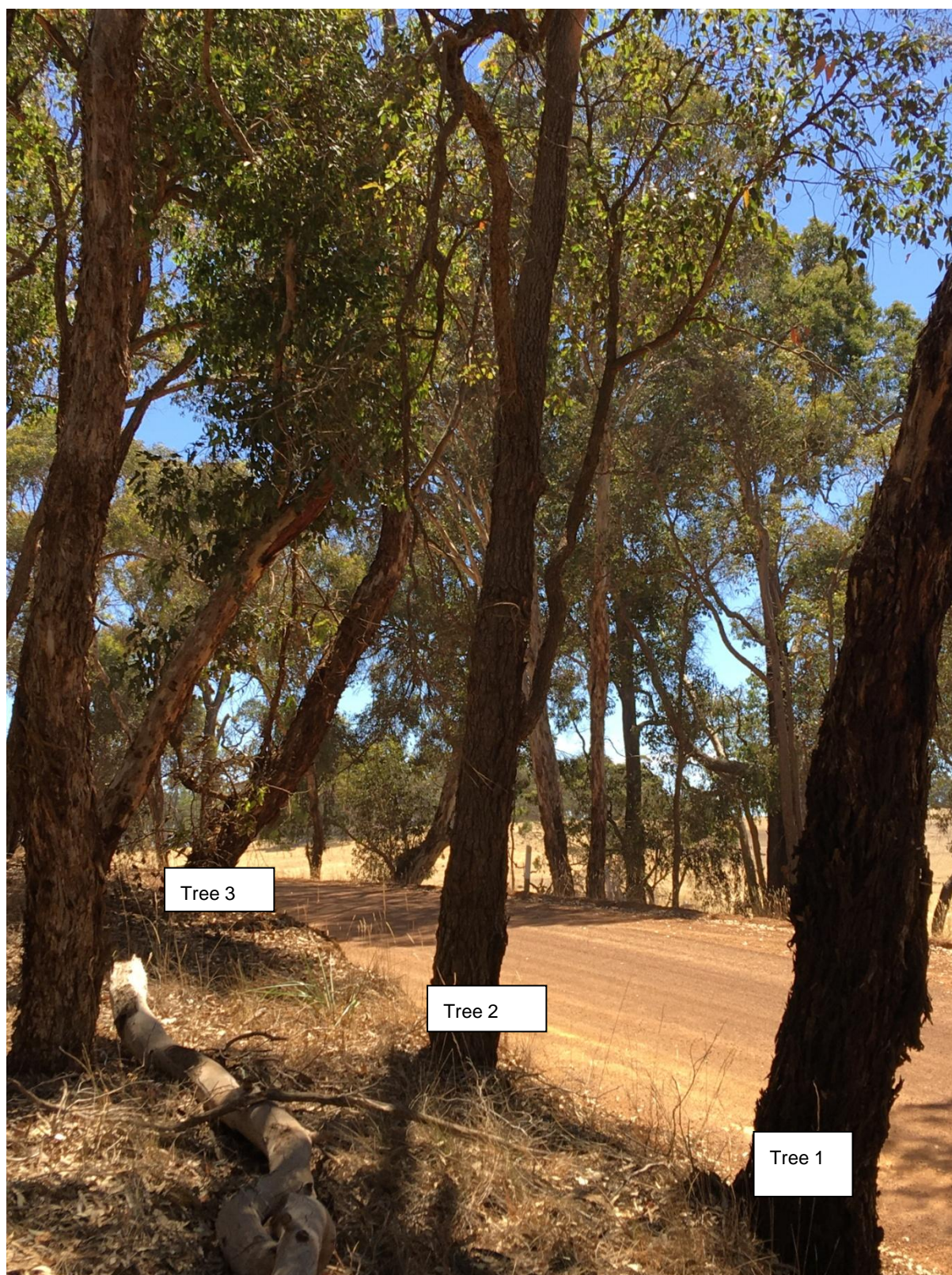
Tree No 1,2,3. Right on the edge of the steep bank that needs to be removed including removing some of the bank to widen and lift the corner.