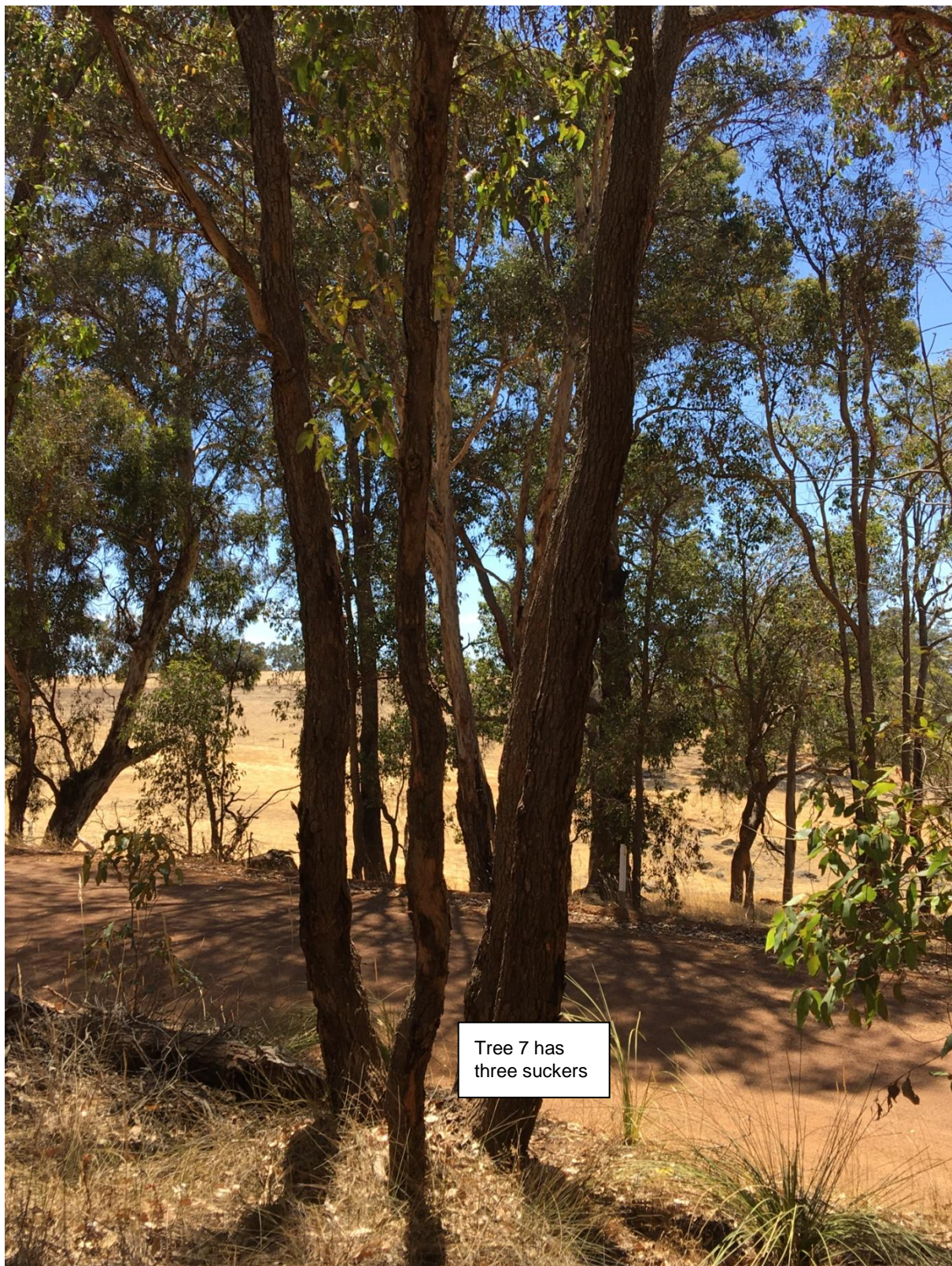
Tree No 7. Right on the edge of the steep bank that needs to be removed including some of the bank to widen the corner.