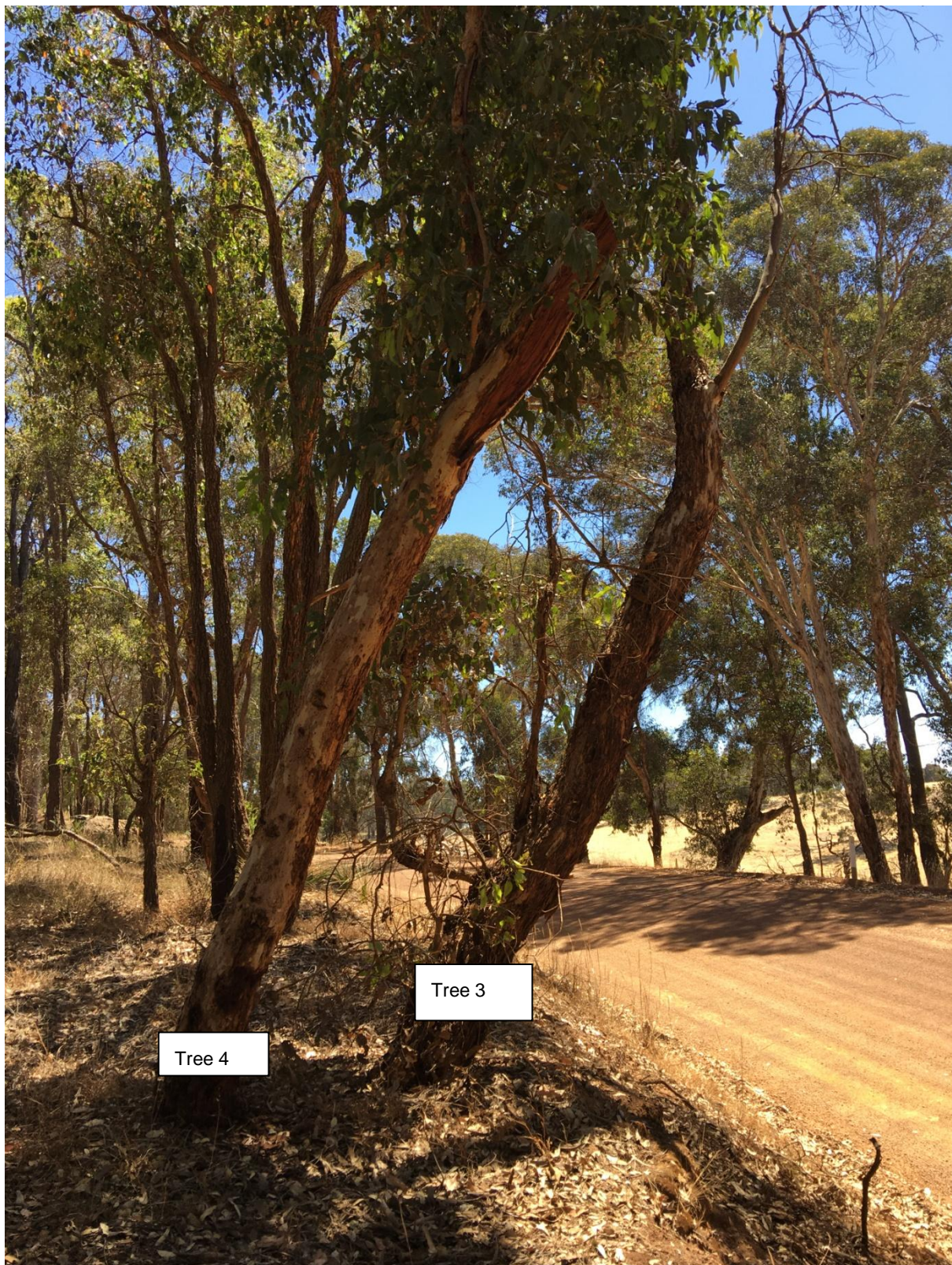
Tree No 3 & 4. Right on the edge of the steep bank that needs to be removed including some of the bank to widen the corner.