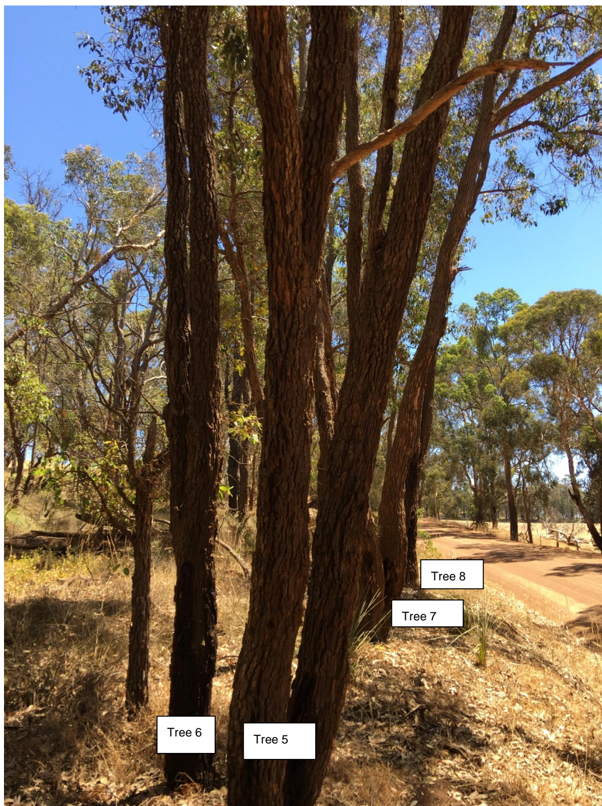
Tree No 5 & 6. Right on the edge of the steep bank that needs to be removed including some of the bank to widen the corner.