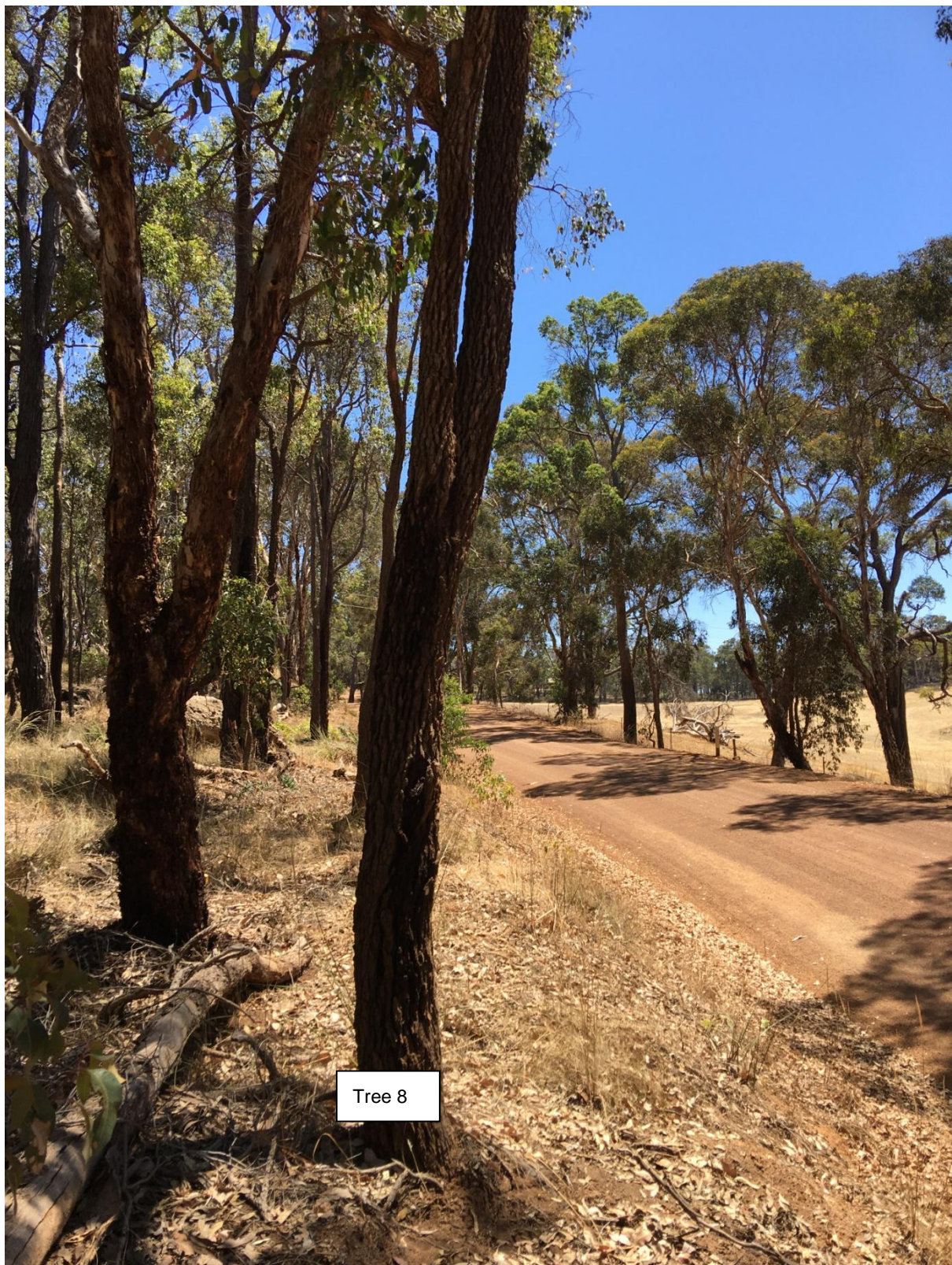
Tree No 8. Right on the edge of the steep bank that needs to be removed including some of the bank to widen the corner.