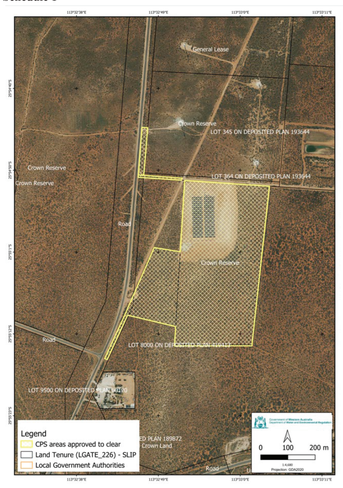
Figure 1: Map of the boundary of the area within which clearing may occur