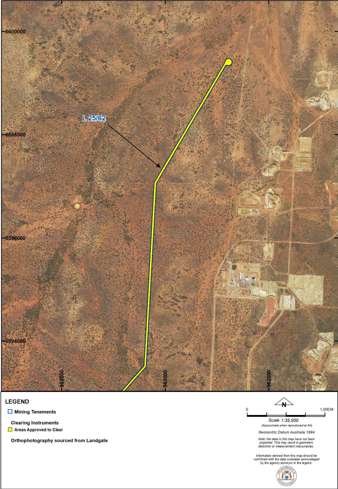
Figure 1: Map of the boundary of the area within which clearing may occur

The boundary of the area authorised to be cleared is shown in the map below (Figures 1 and 2).