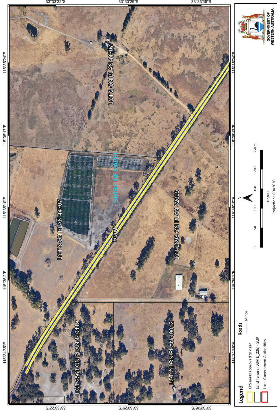
Figure 1A: Map of the boundary of the area within which clearing may occur.