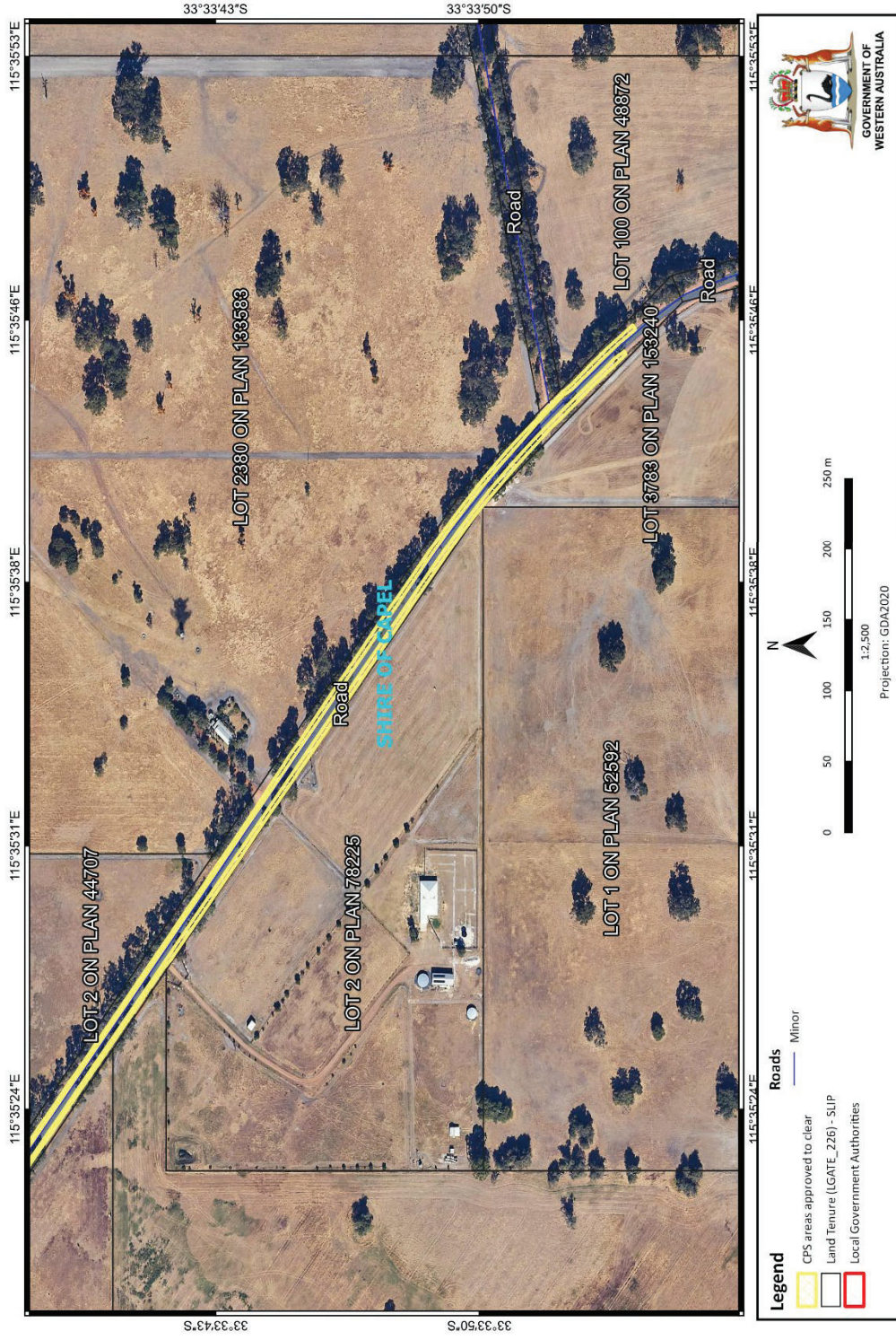
Figure 2B: Map of the boundary of the area within which clearing may occur.