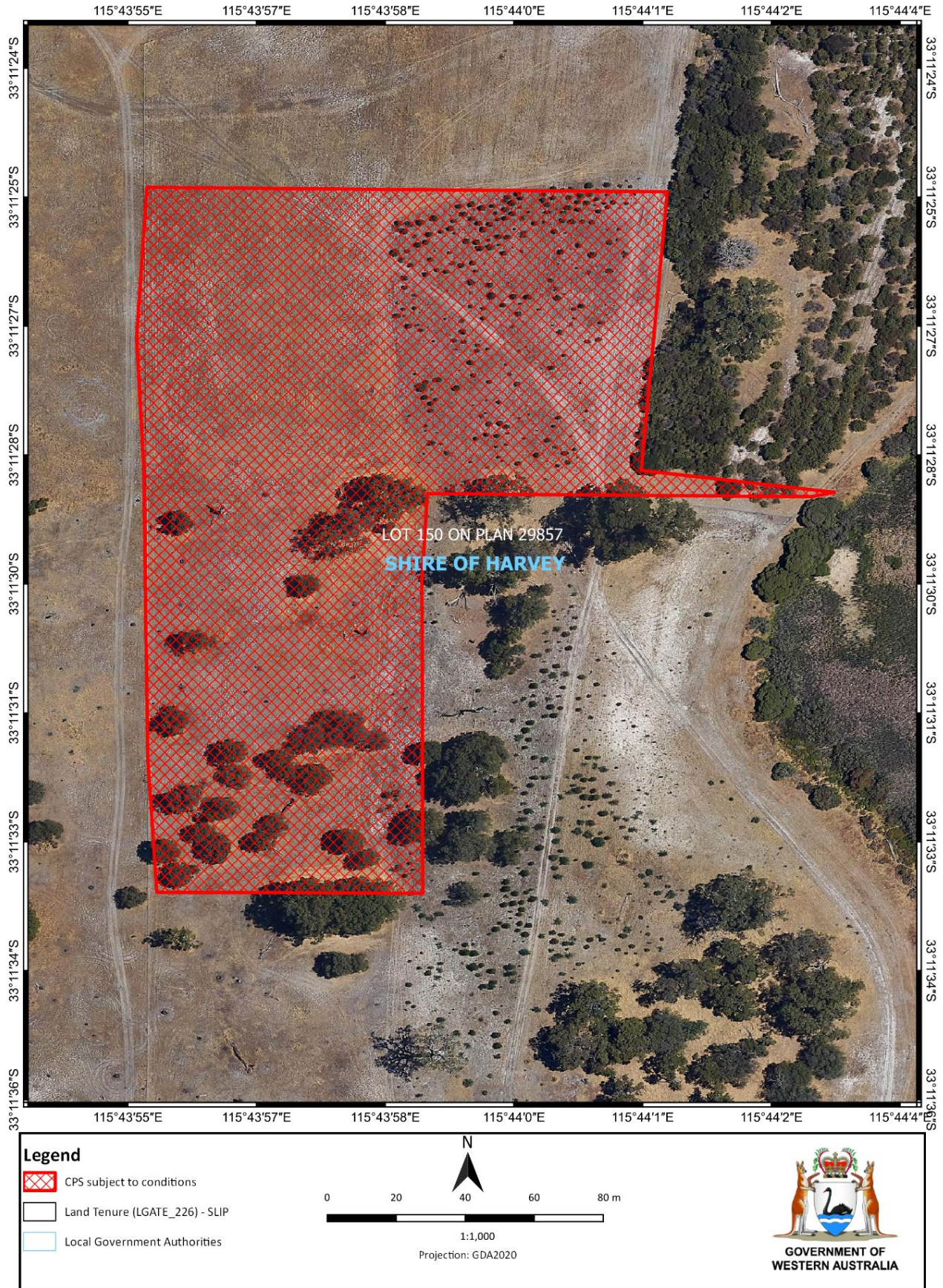
Figure 4: Map of the offset area. The area cross-hatched red indicates area which will be revegetated in accordance with the offset conditions on the permit.