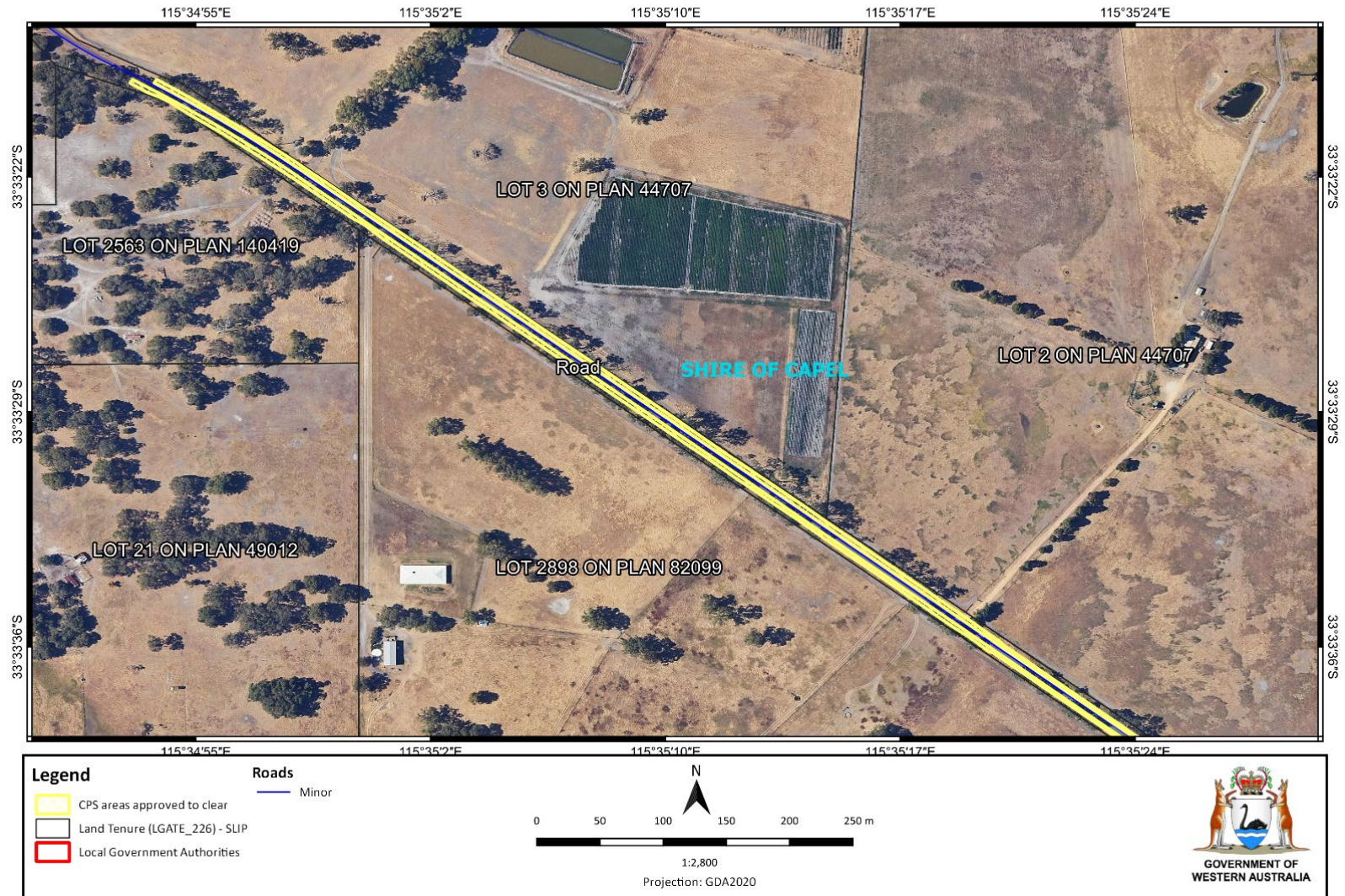
Figure 1A: Map of the application area. The areas crosshatched yellow indicate the areas authorised to be cleared under the granted clearing permit. The areas crosshatched red indicate areas for which fauna management conditions apply.