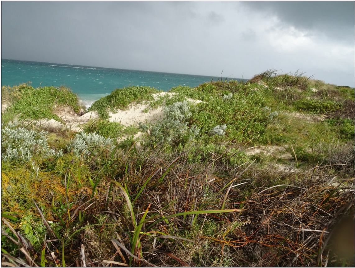
North path 2