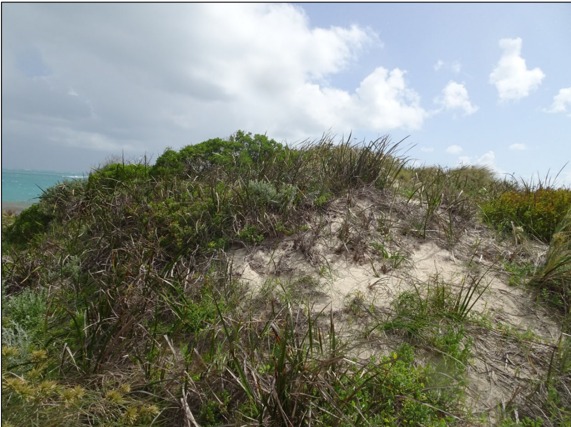
South path 2