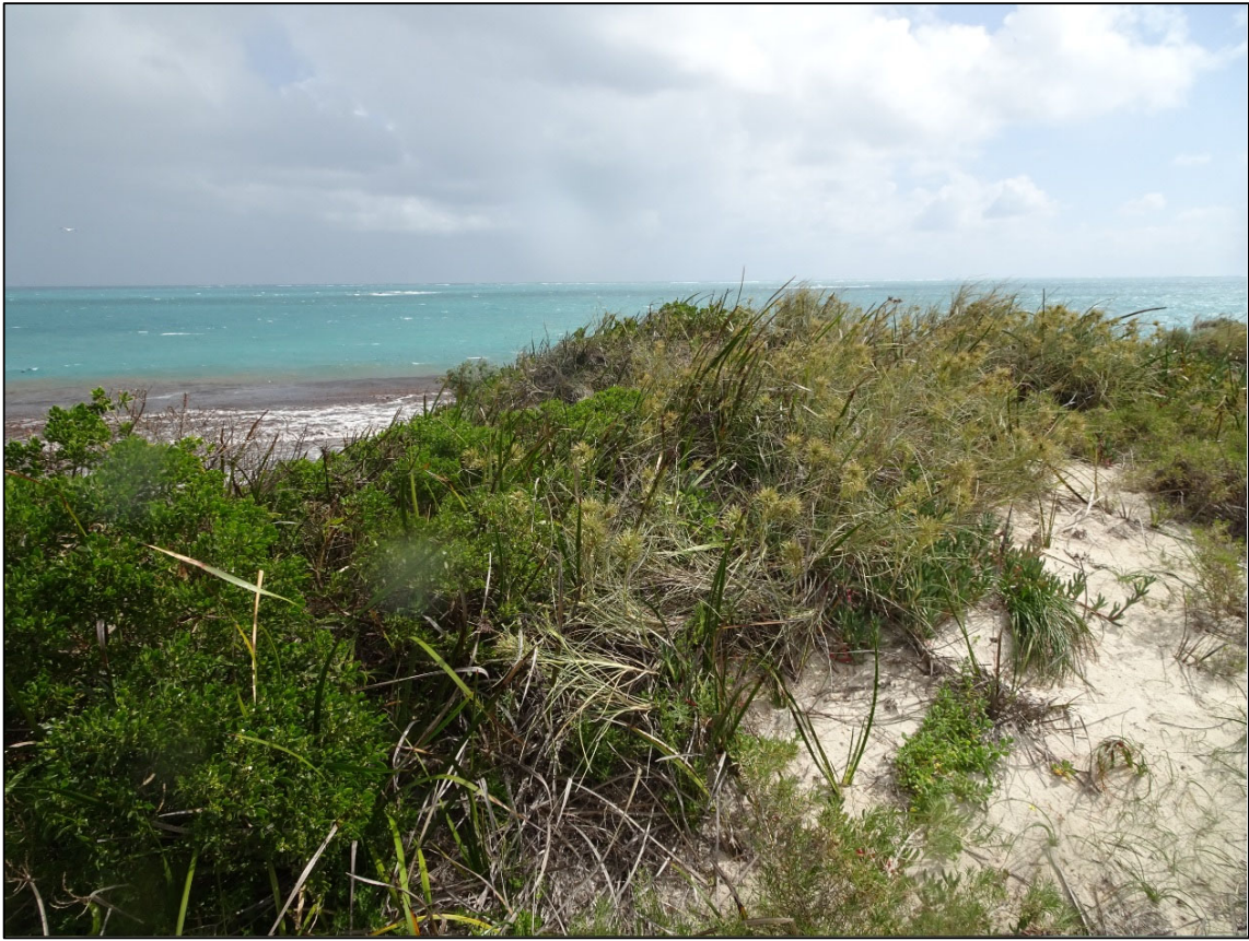
South path 3