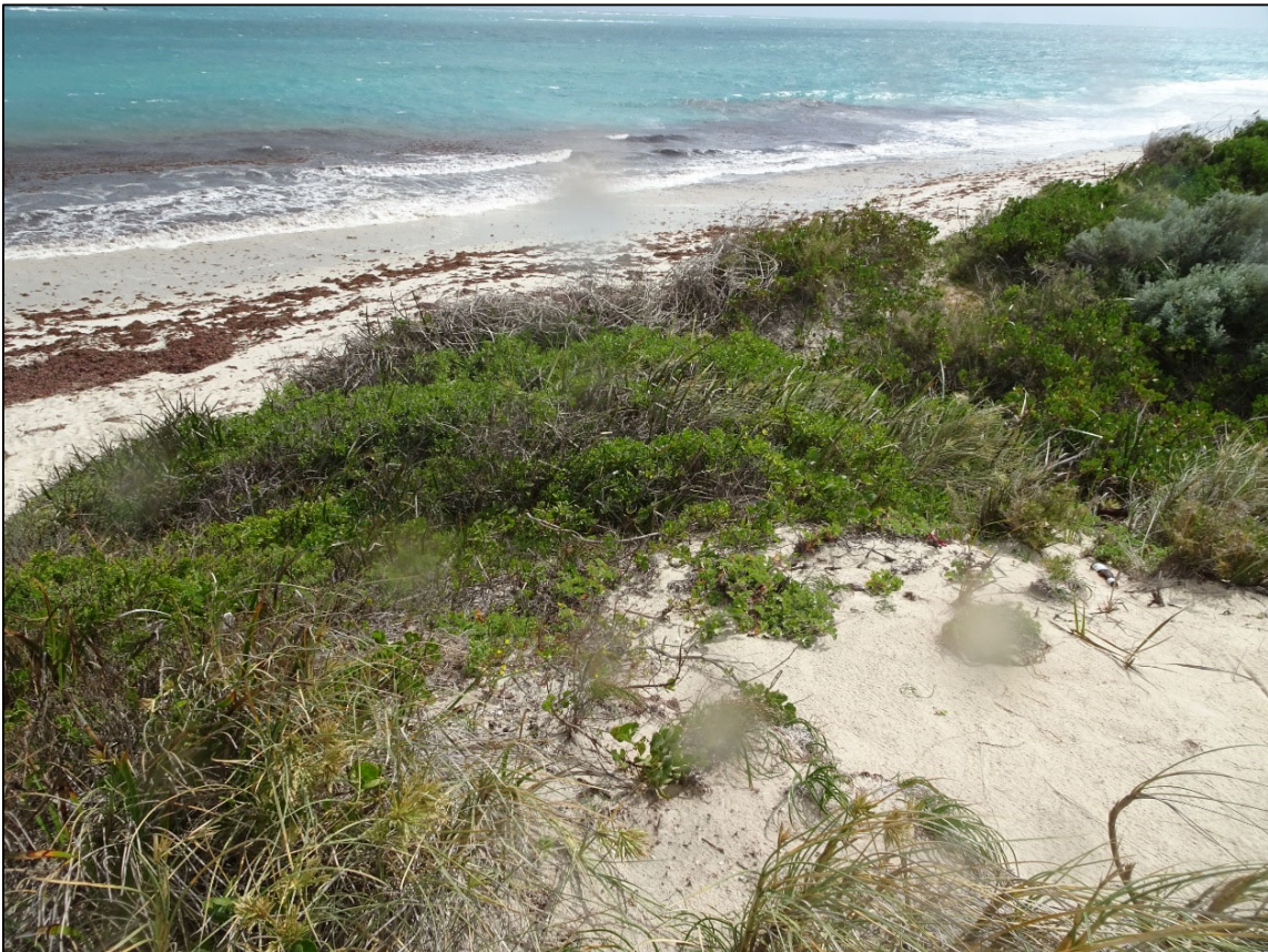
South path 4