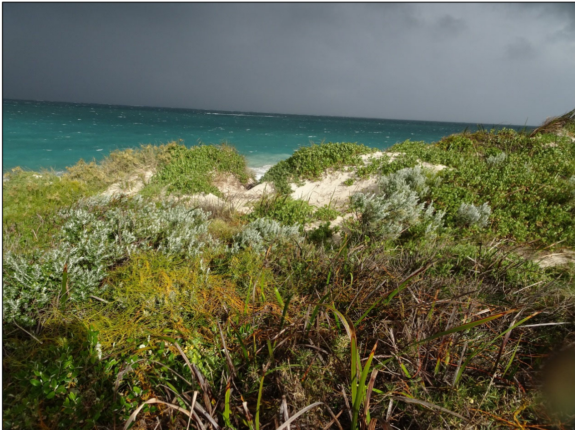
North path 1