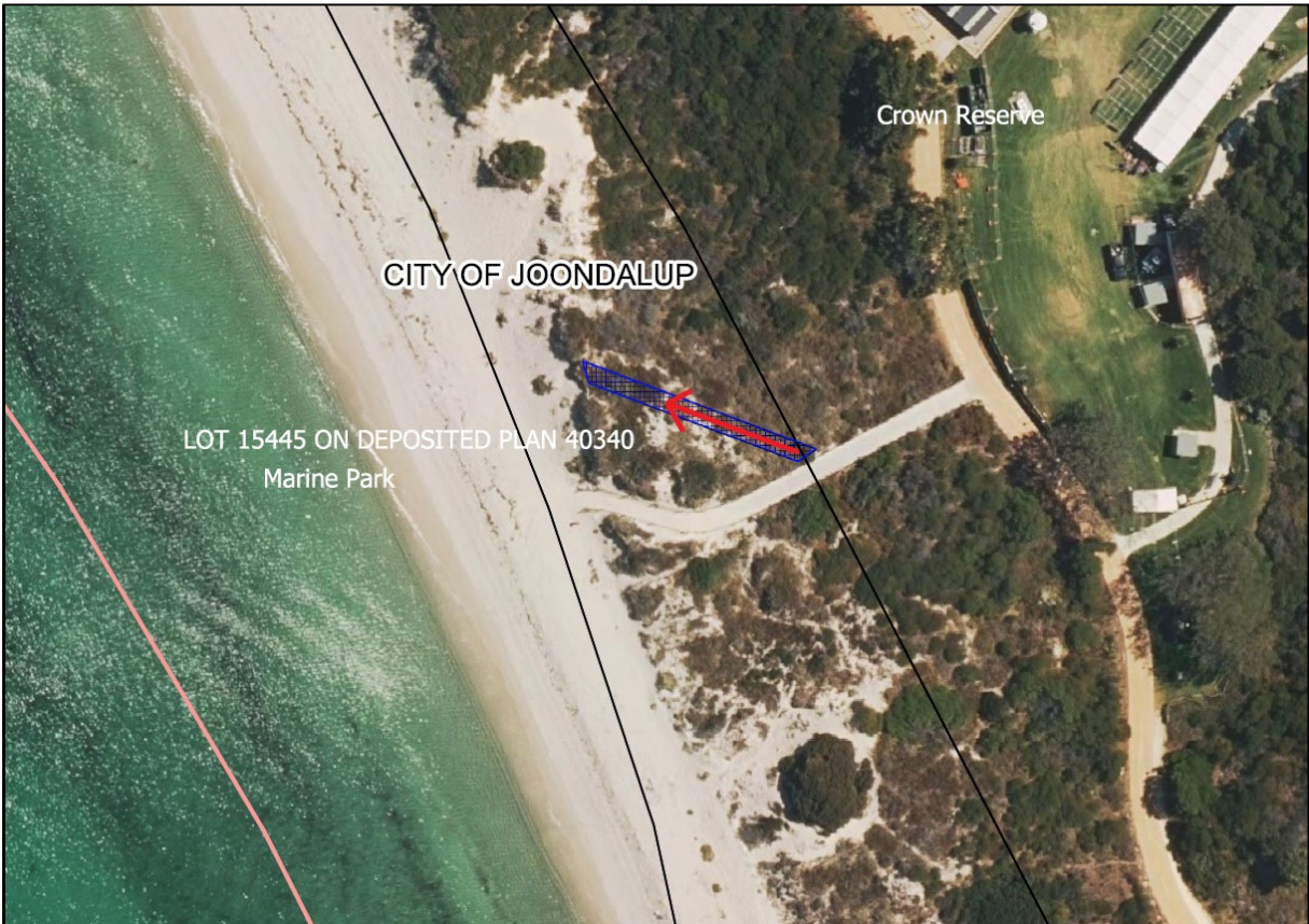
Hillarys southern path