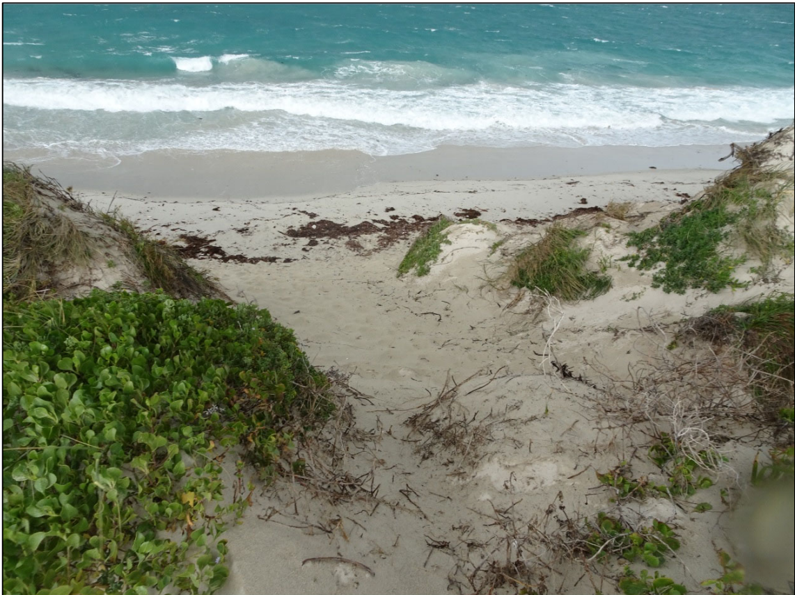
North path 3