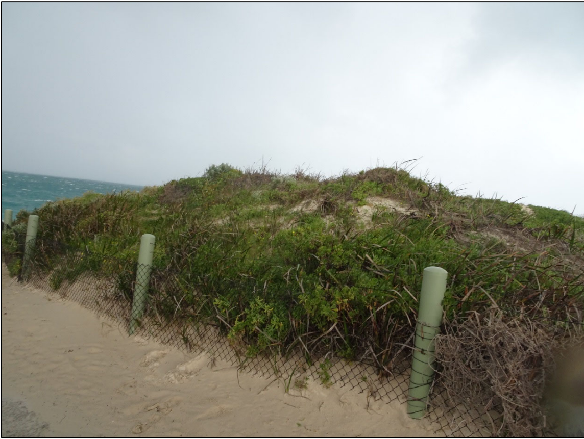
North path 4