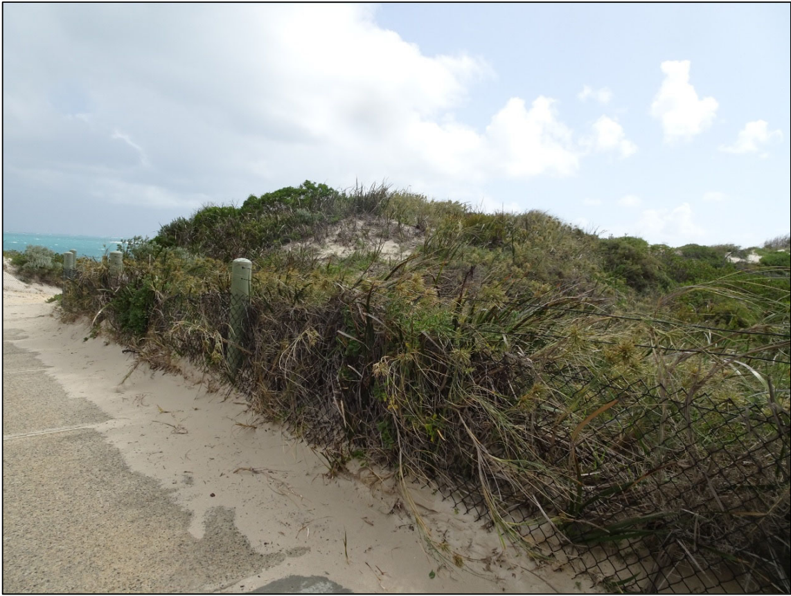
South path 1