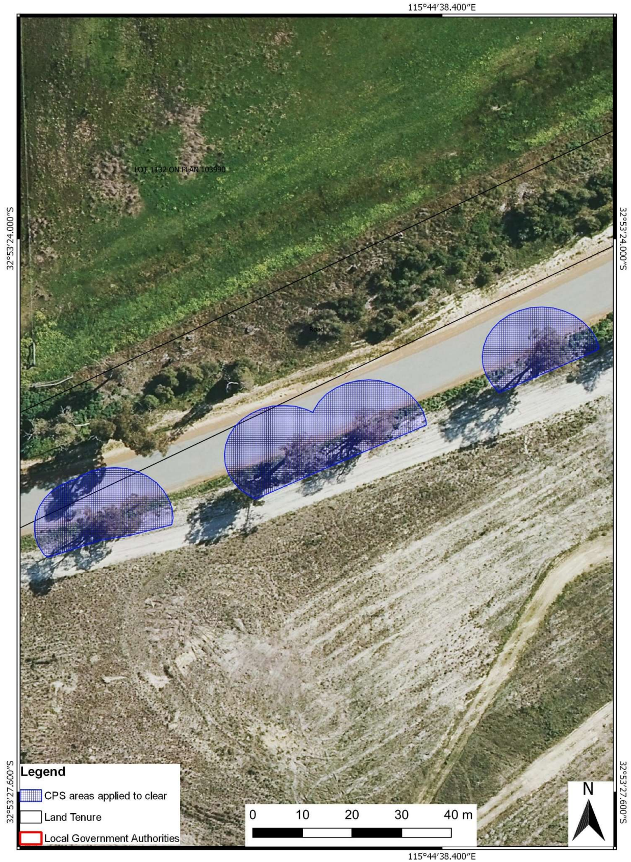
Figure 1. Map of the application area. The areas cross-hatched blue indicate the areas proposed to be cleared.