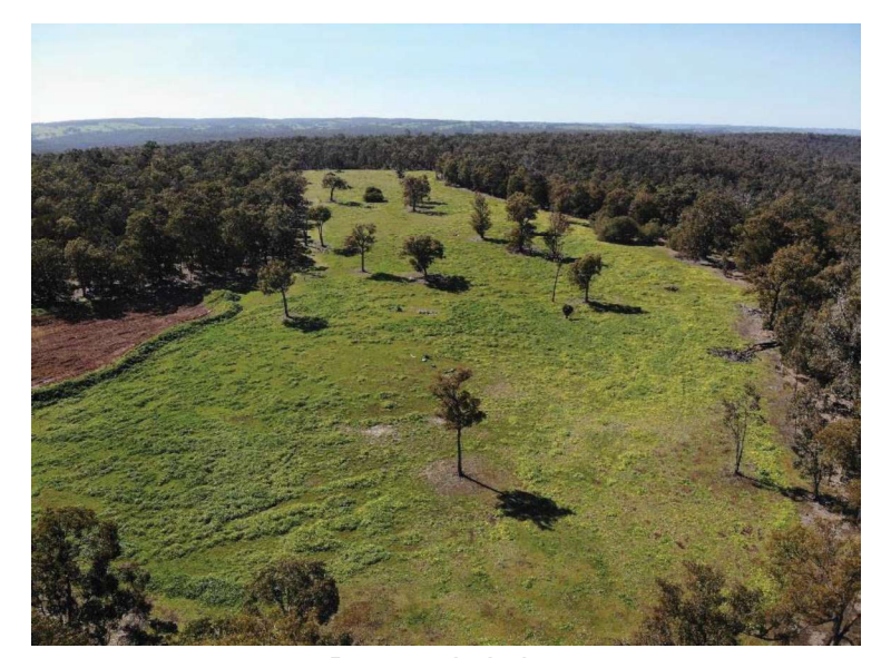
Lot 333 Nybo Road Gwindinup