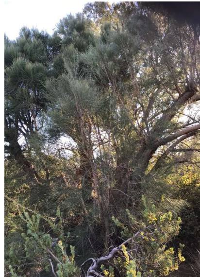
Figure 1a Photograph on the northern side of Kelvin Road showing dense remnant vegetation inside the lots to the