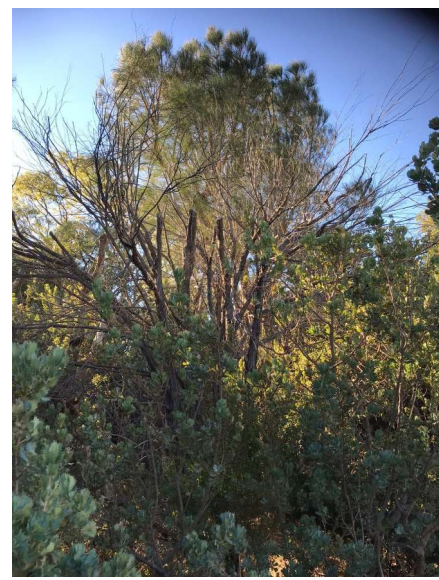
Figure 1b Photograph showing dense vegetation on the northern side of the road, inside the lots to the north