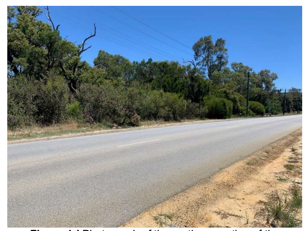
Figure 1d Photograph of the northern portion of the application area