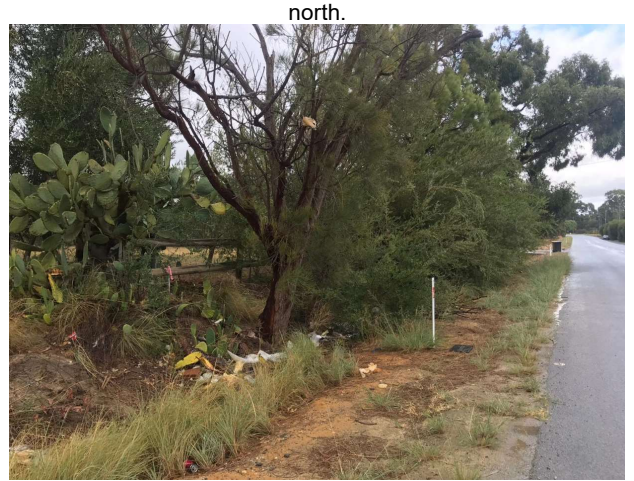
Figure 1c Photograph at western end of application area facing west towards White Road.