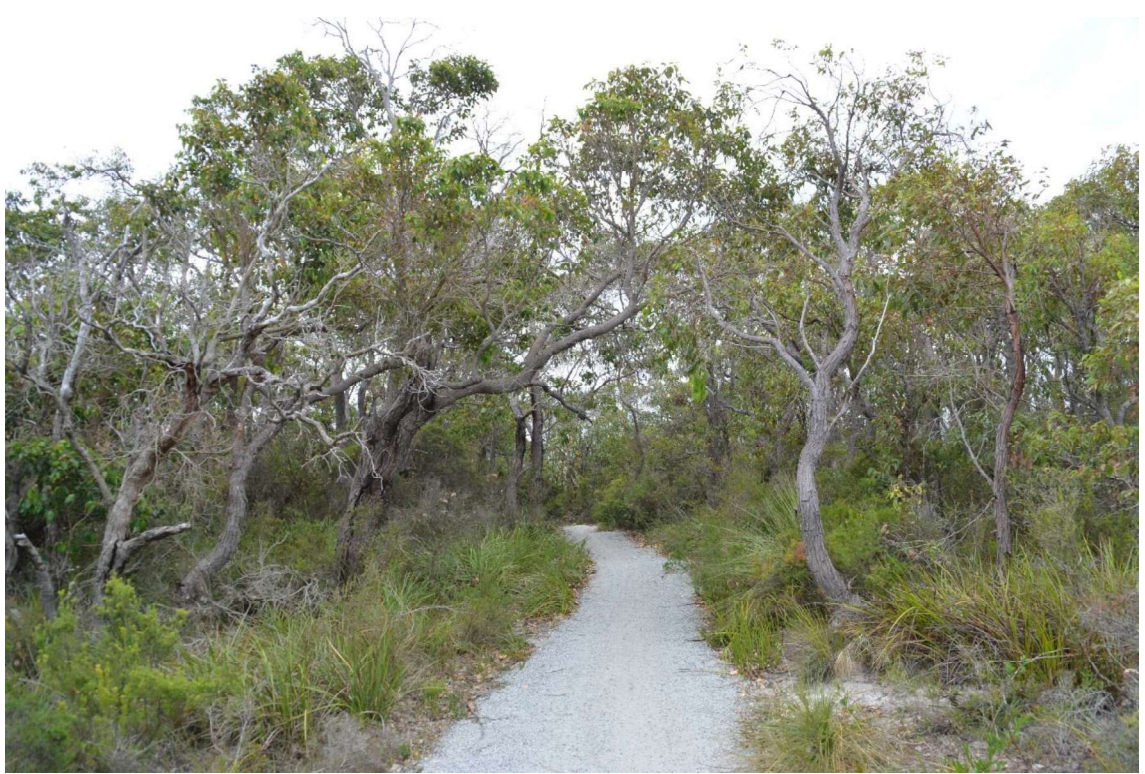
Open Jarrah / Marri Woodland (May 2019) Naturally has open canopy, will some canopy connection.