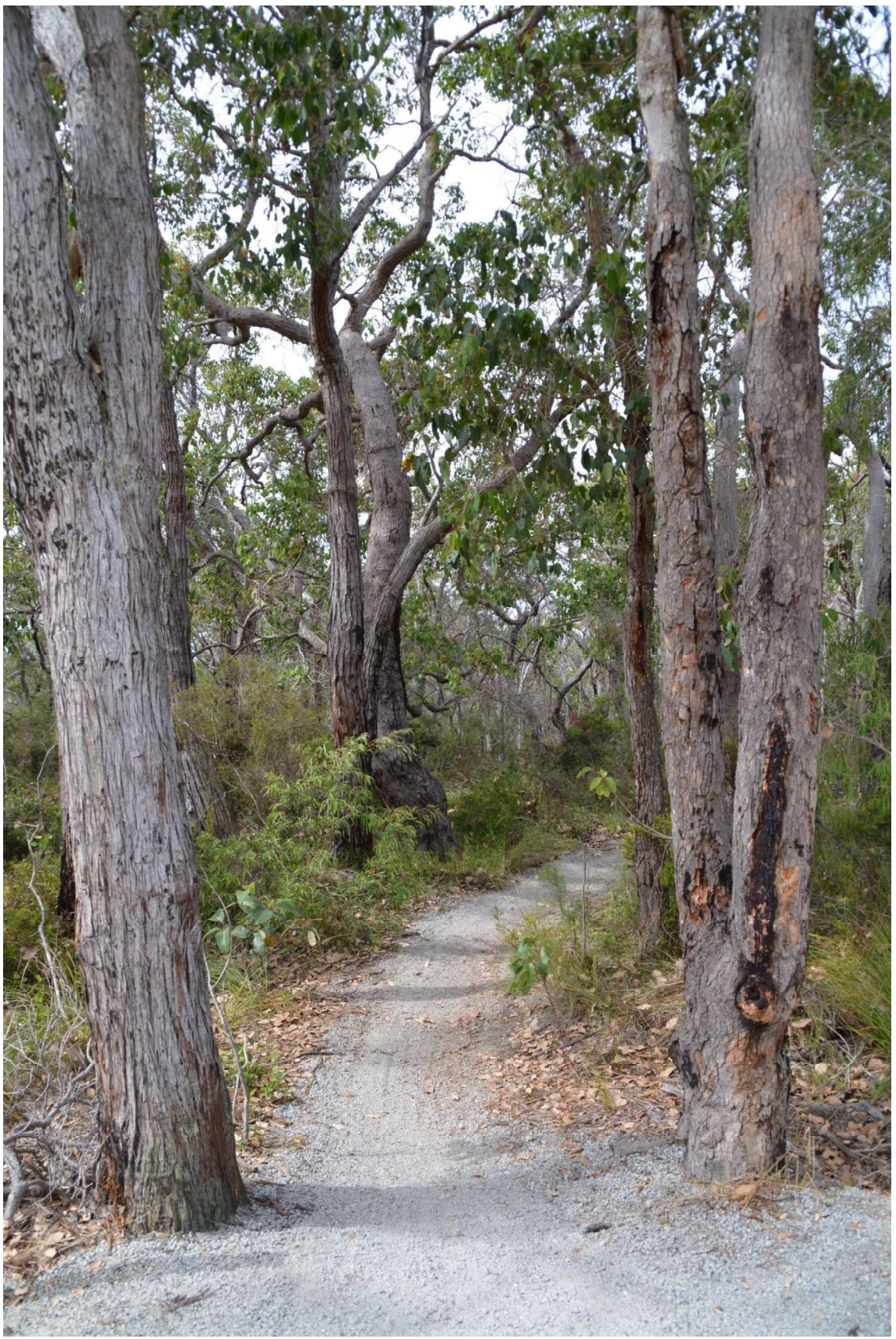
Demonstrating canopy linkages in the Open Jarrah Marri Woodland (2019)