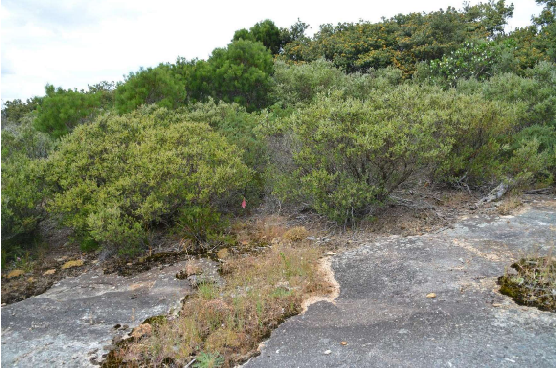
Granite outcrop and fringing Taxandria shrub land (2016 before trail was built) Naturally has no upper canopy connection

Tall Gastrolobium Shrub land (June 2018) Naturally has a dense tall shrubland structure A gap in vegetation connectivity is formed by the trail.