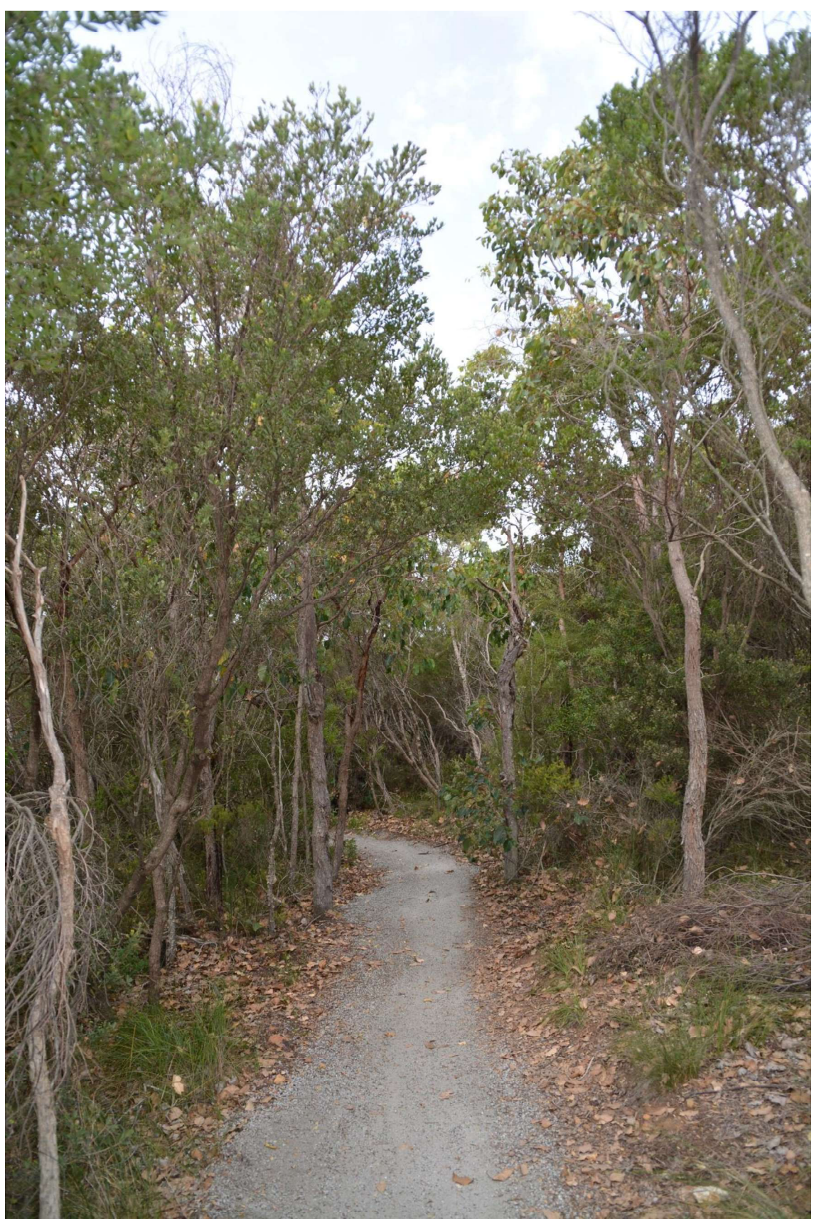
Demonstrating canopy linkages in the Open Jarrah Marri Woodland (2019)