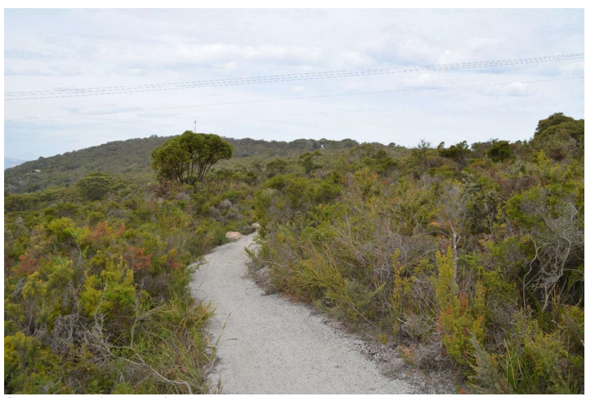
Coastal Heath (May 2019) Naturally has no upper canopy connection