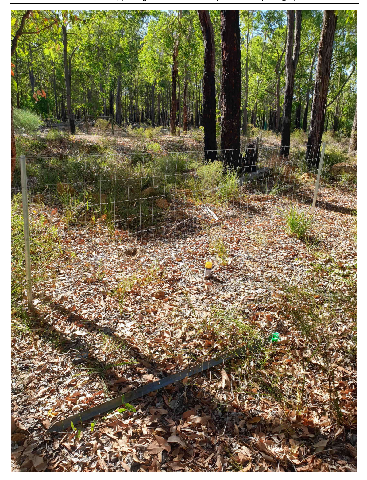
Photograph\ 1-Photograph\ taken\ from\ the\ applicant's\ property\ looking\ across\ the\ road\ reserve