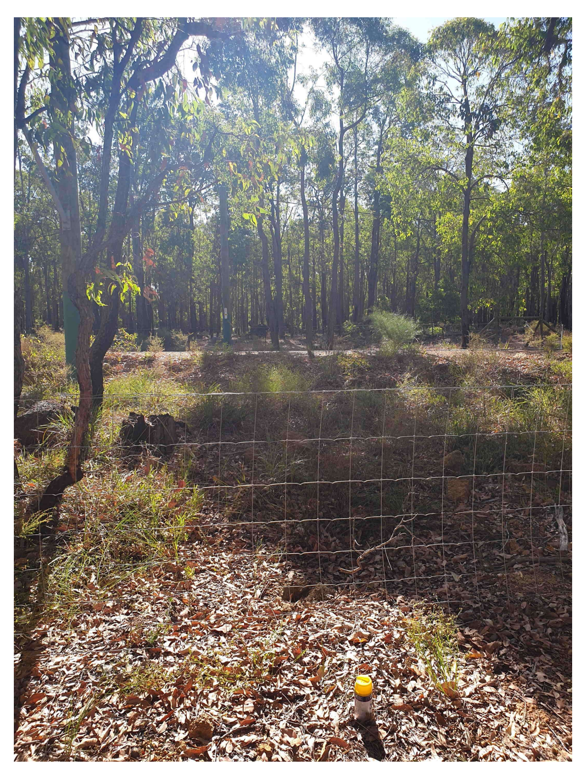
Photograph 2 – Photograph taken from the applicant's property looking across the road reserve