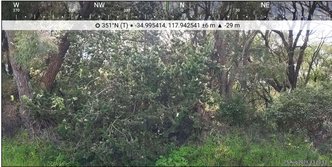
Photograph 3 on Amended Clearing Area Map