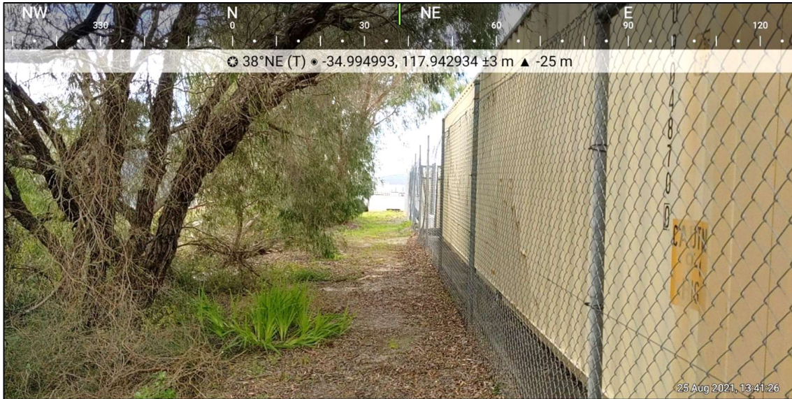
Photograph 6 on Amended Clearing Area Map