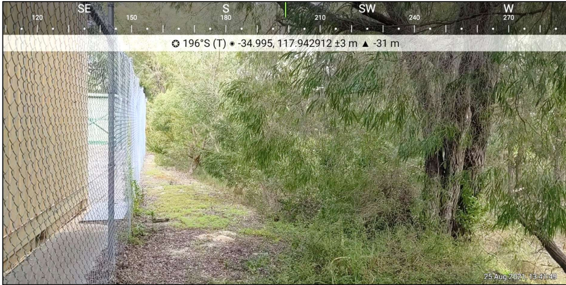
Photograph 5 on Amended Clearing Area Map