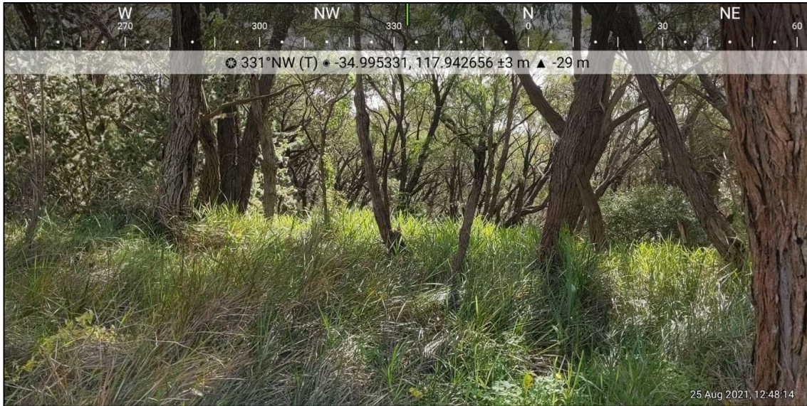
Photograph 4 on Amended Clearing Area Map